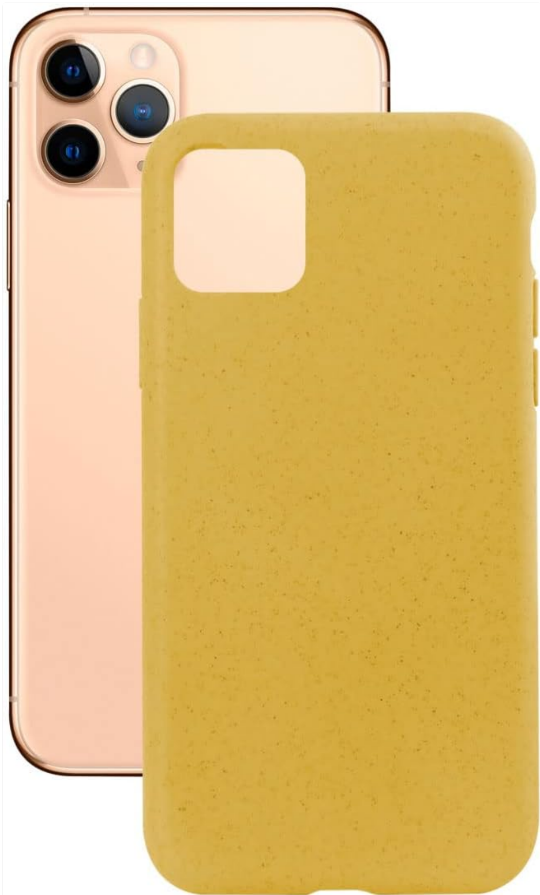
Figure 2.1: The KSIX Eco-Friendly Case (lemon tree color) securely installed on an iPhone 11 Pro, showcasing its fit and design.