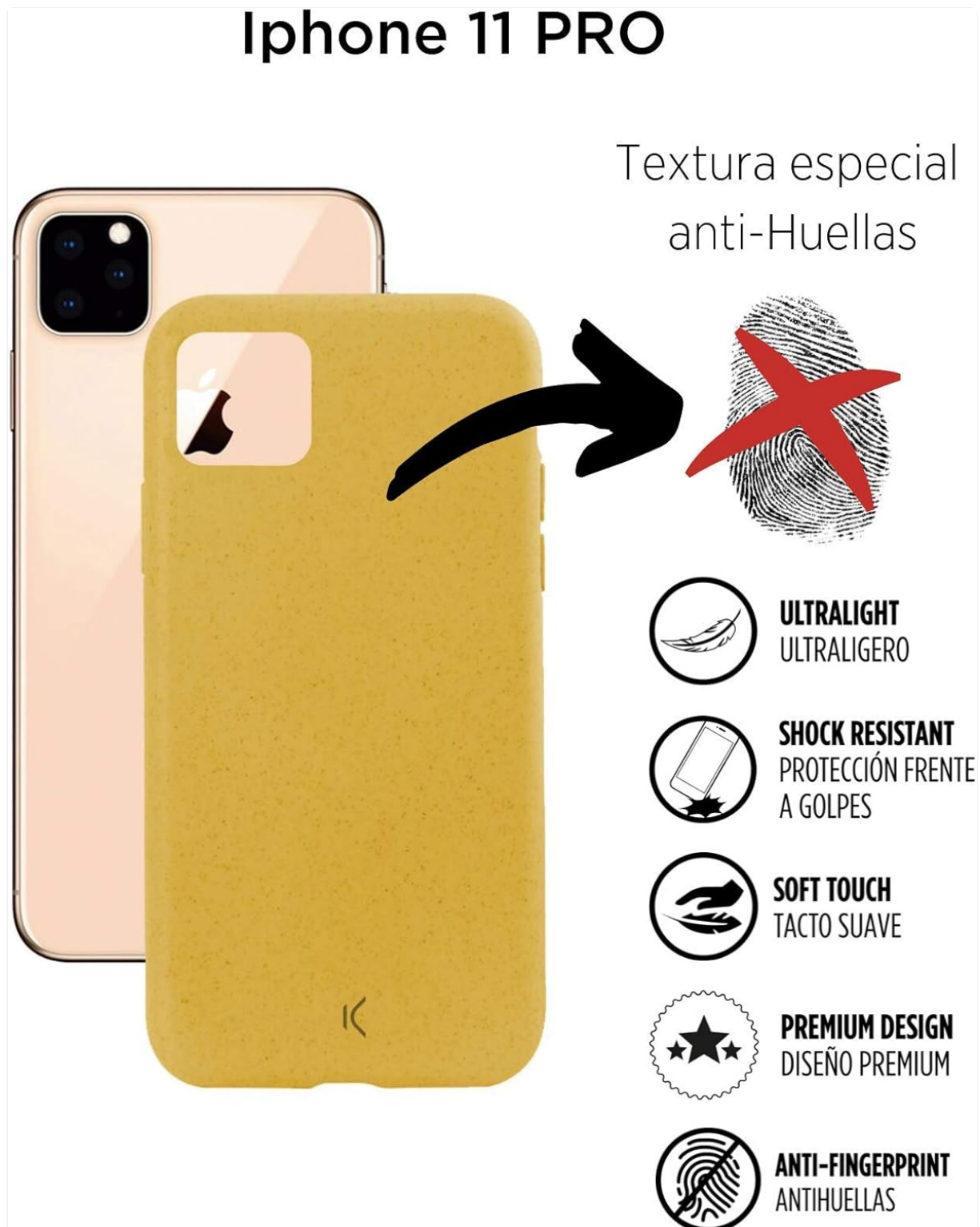
Figure 3.1: Visual representation of the case's key attributes, including its ultralight design, shock resistance, soft touch, premium design, and anti-fingerprint properties.