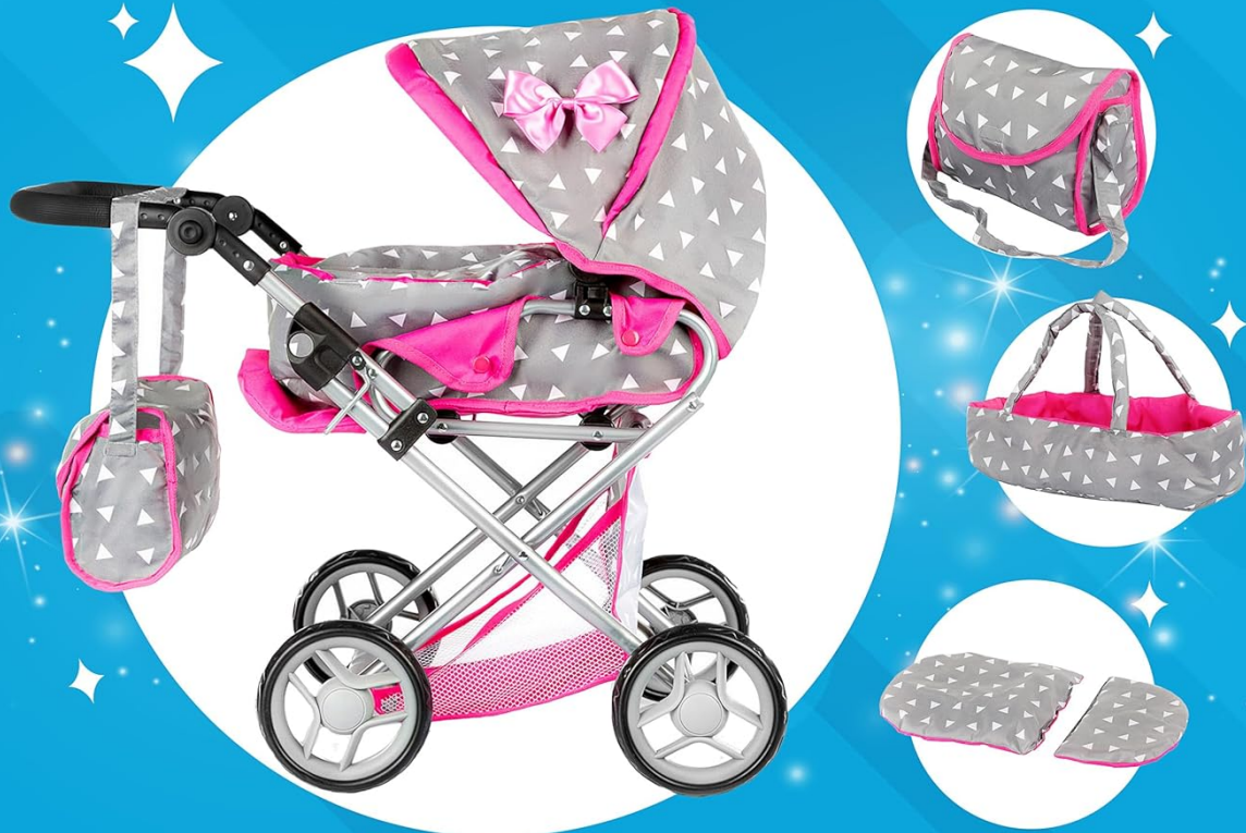
Figure 6: Illustration of the easy-to-clean design with removable fabric components.