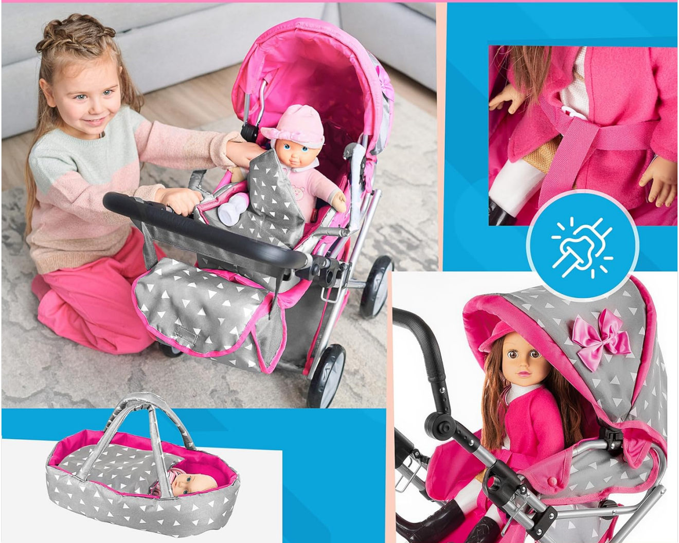
Figure 4: Demonstrates doll compatibility and the use of safety belts to secure the doll.