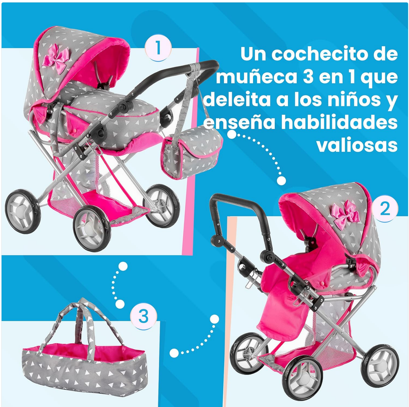
Figure 2: The doll stroller demonstrating its 3-in-1 functionality as a pram, pushchair, and carrycot.