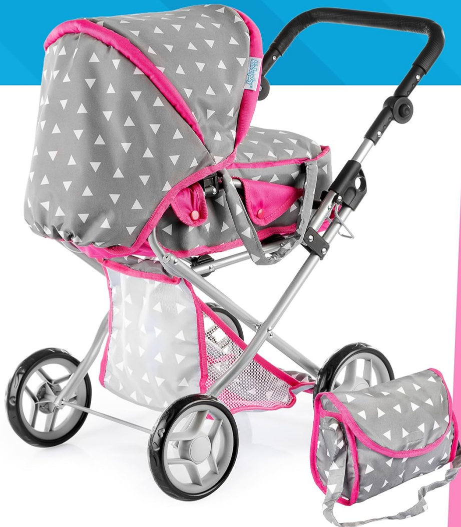
Figure 5: The foam wheels ensure quiet and smooth movement, protecting indoor surfaces.