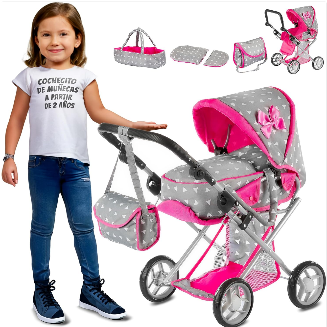
Figure 1: Fully assembled Kinderplay Doll Stroller, Model KP0200S.