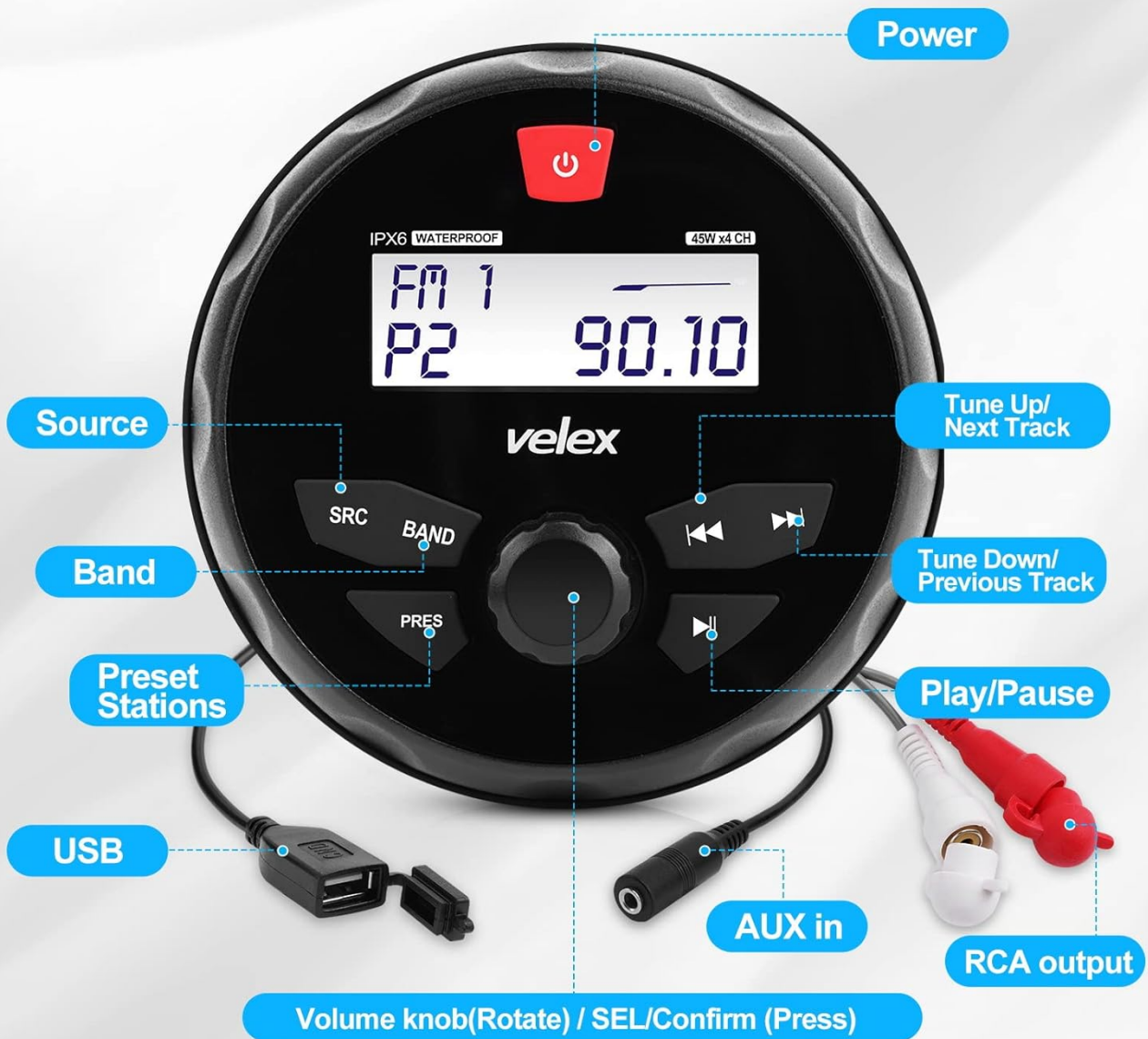
Image: Close-up view of the head unit, highlighting controls such as Power, Source, Band, Preset Stations, Tune Up/Next Track, Tune Down/Previous Track, Play/Pause, Volume knob (Rotate)/SEL/Confirm (Press), and ports for USB, AUX in, and RCA output.