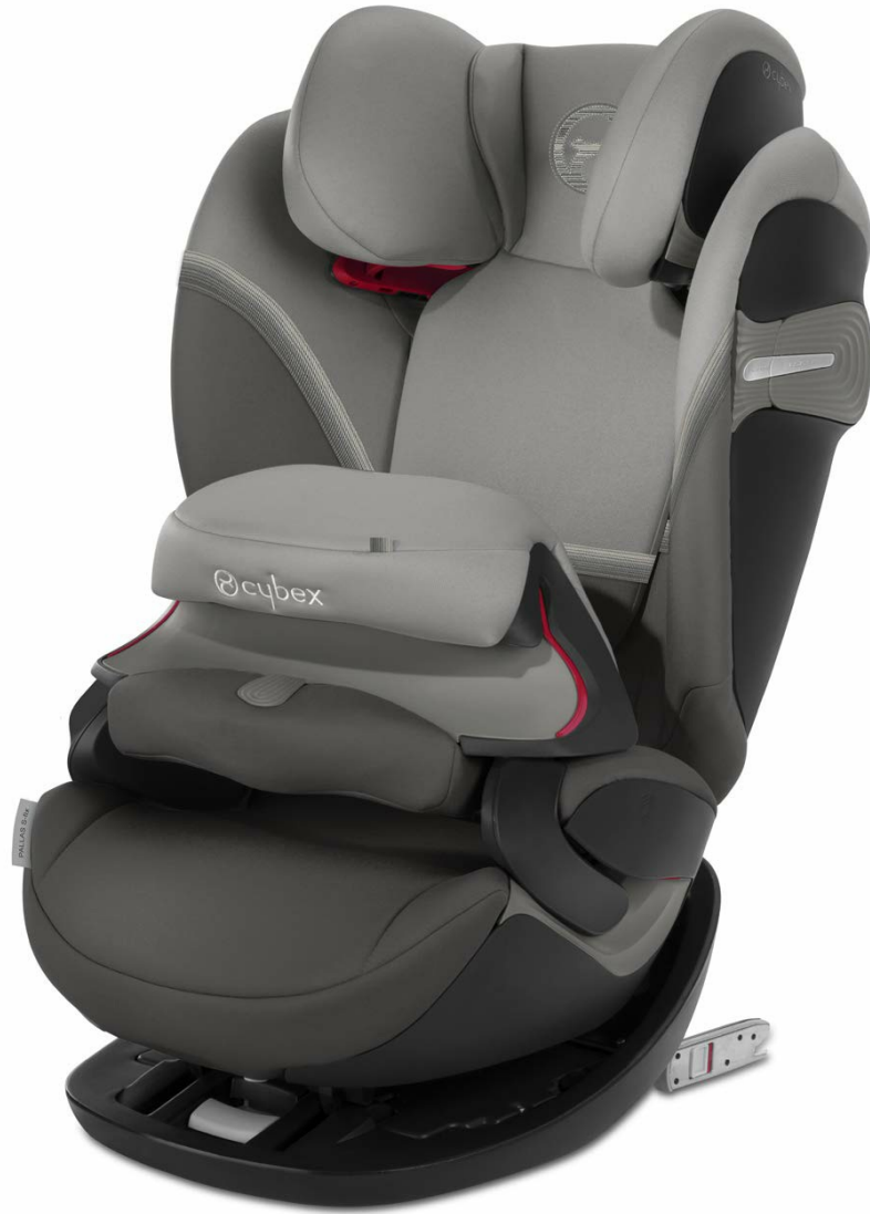
Image 1.1: The Cybex Gold Pallas S-Fix car seat with its adjustable impact shield.