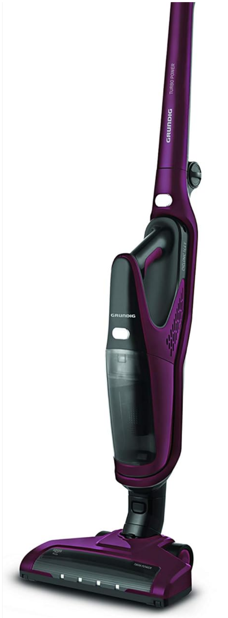
Figure 2.1: The Grundig VCH 9930 2-in-1 Cordless Vacuum Cleaner in its full stick configuration. This image displays the