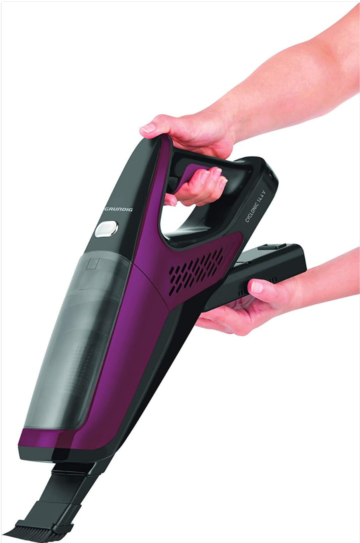
Figure 4.2: The Grundig VCH 9930 handheld unit being used to clean a surface. This demonstrates its portability and ease of use for targeted cleaning tasks.