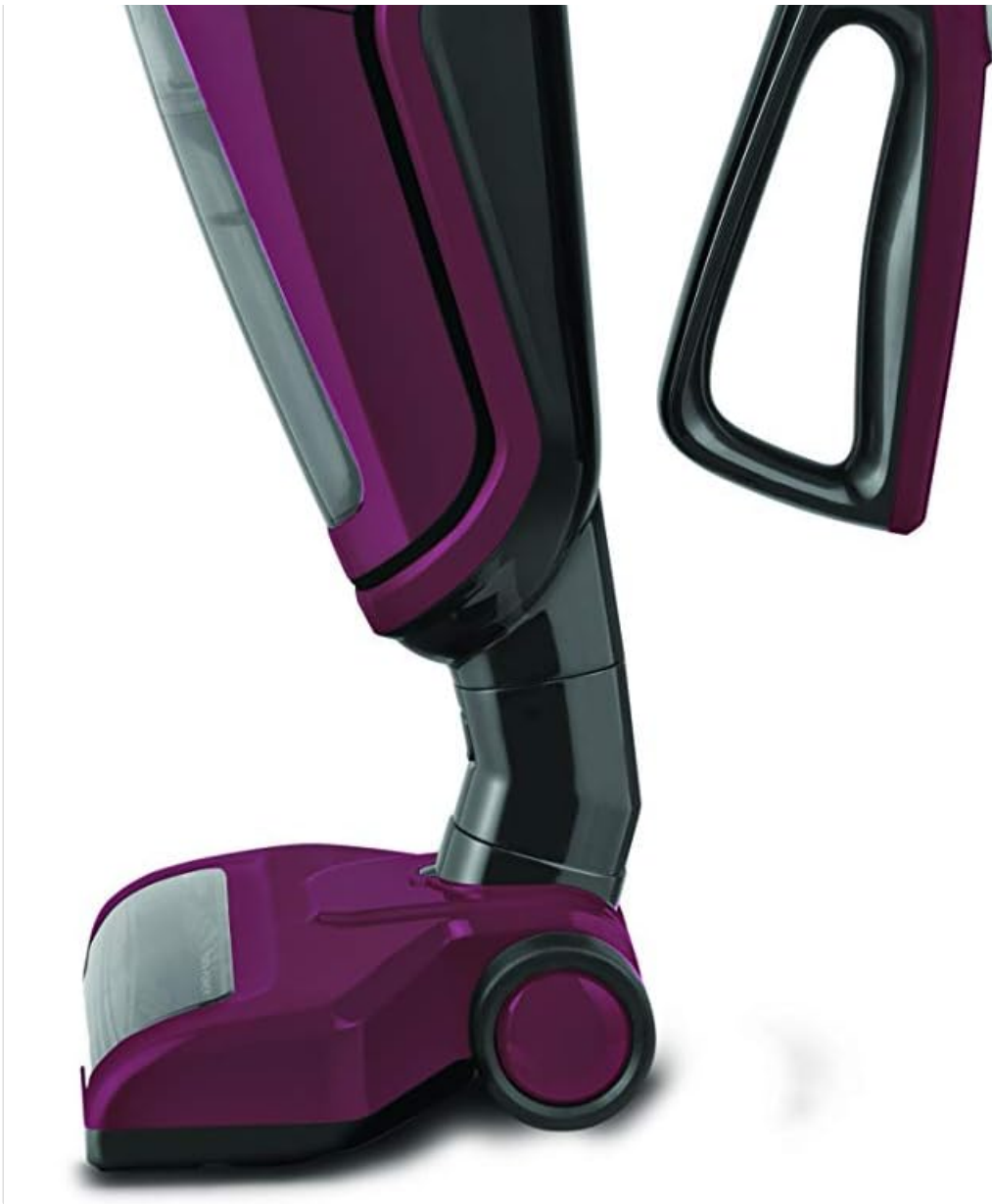
Figure 3.1: The Grundig VCH 9930 in a folded position, illustrating its compact storage capability. This also shows the main components assembled.