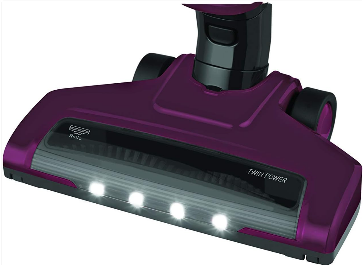
Figure 4.1: Close-up view of the Grundig VCH 9930's floor nozzle, highlighting the integrated LED lights. These lights improve visibility of dust and debris on the floor during operation.

For floor cleaning, ensure the handheld unit is securely docked in the main body. The motorized brush roll in the floor nozzle is effective on various hard ground surfaces. The integrated LED lights on the nozzle illuminate the cleaning path, making dust and debris more visible.