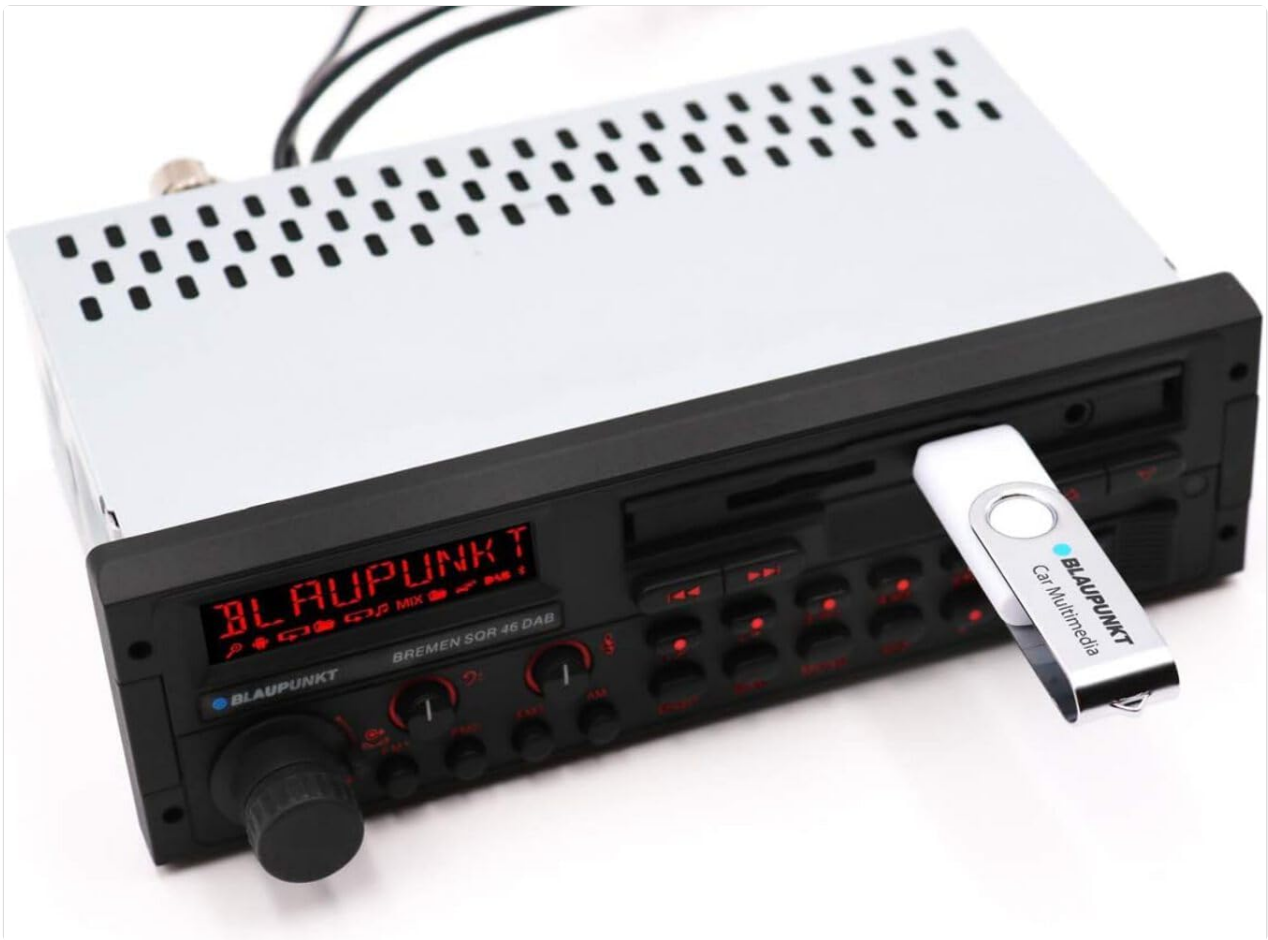
Figure 4.2: USB drive inserted into the front panel.