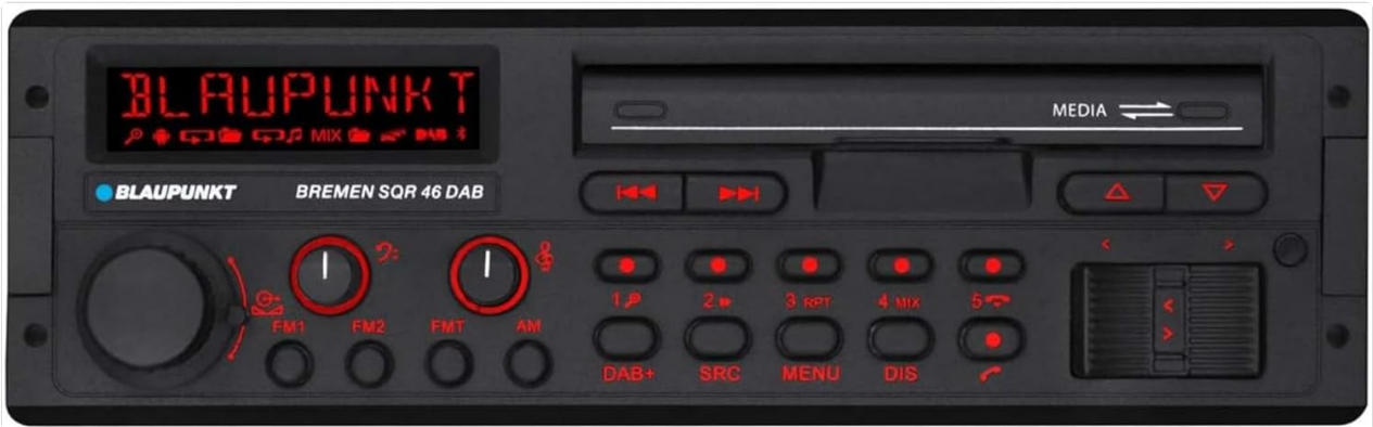
Figure 4.1: Front panel controls and display.

Insert a USB drive or SD card into the respective slot. The unit will automatically switch to the USB/SD source and begin playing compatible audio files (MP3, WMA). Use the forward/back arrows to skip tracks.