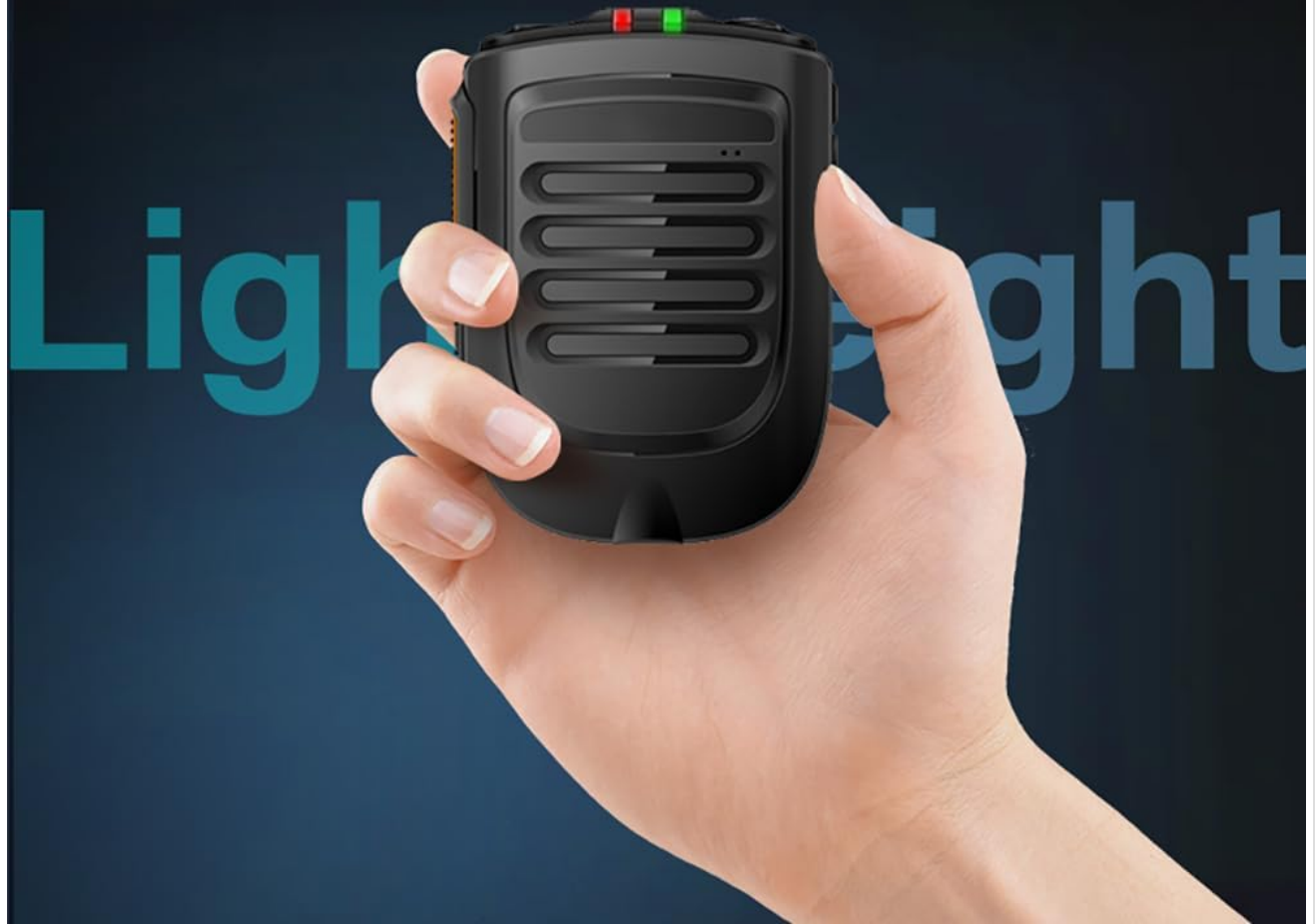
Image 5: An image illustrating an SOS button for emergency use. However, for the AWASBO BM001, this function is explicitly stated as unavailable.