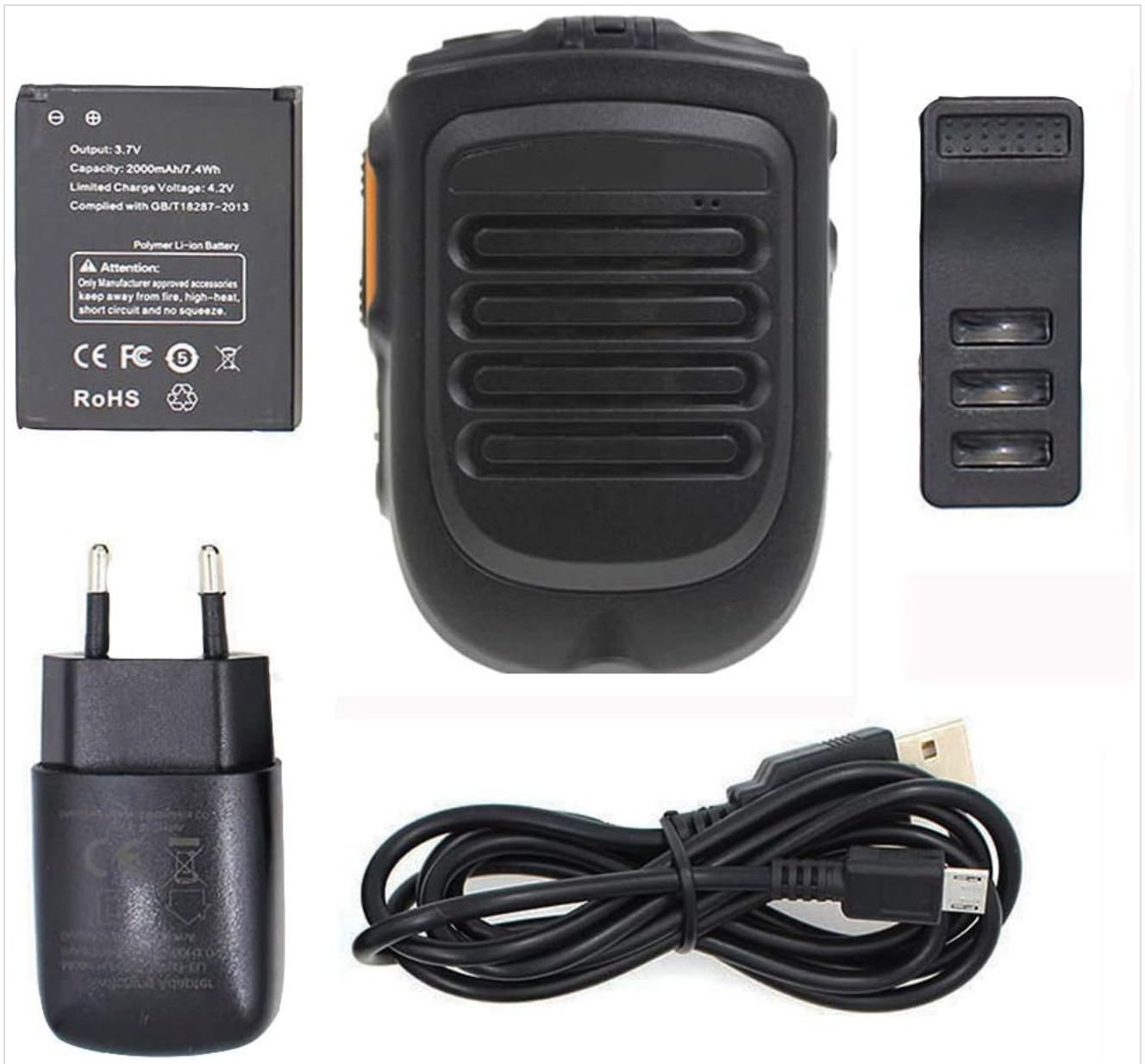
Image 2: The standard packaging contents for the AWASBO BM001, including the handheld microphone, USB data cable, clip, and a wall charger.