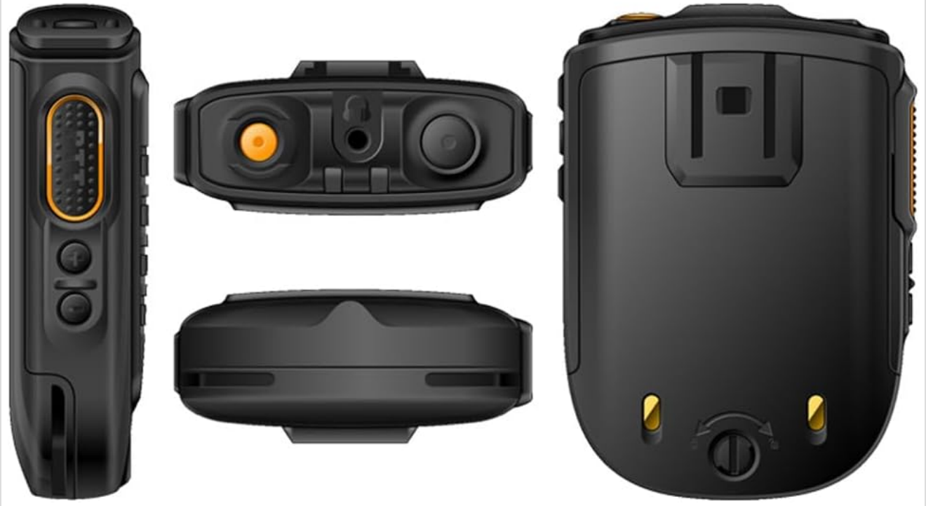
Image 3: A detailed diagram identifying the various components of the AWASBO BM001, including the PTT button, power indicator, function indicator, power button (Play/Pause), microphone, speaker, USB port, and volume/group switch buttons (V+/V-).

14 hours of talk/12 hours of music/90 hours standby time