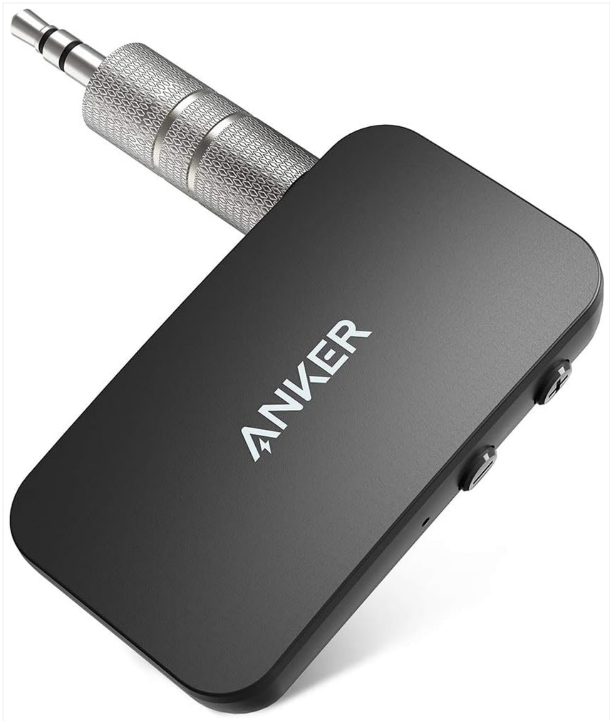
Image 1: The Anker Soundsync A3352 Bluetooth Receiver, a compact black device with the Anker logo, featuring a 3.5mm audio jack for connection.