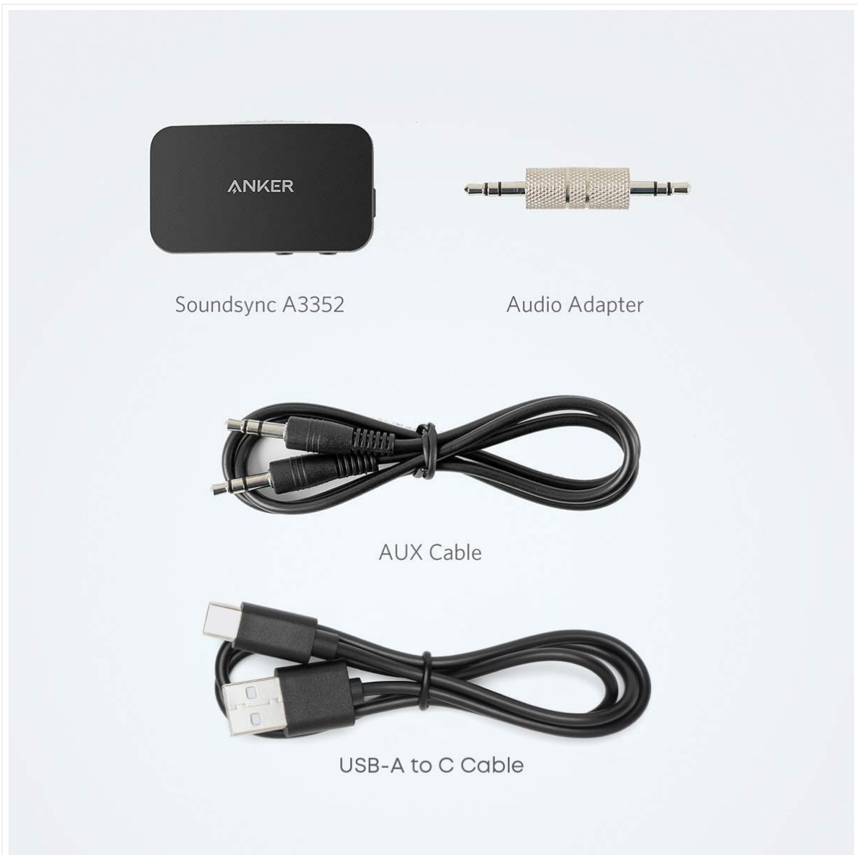
Image 2: Contents of the Anker Soundsync A3352 package, including the receiver, a 3.5mm audio adapter, an AUX cable, and a USB-A to C charging cable.