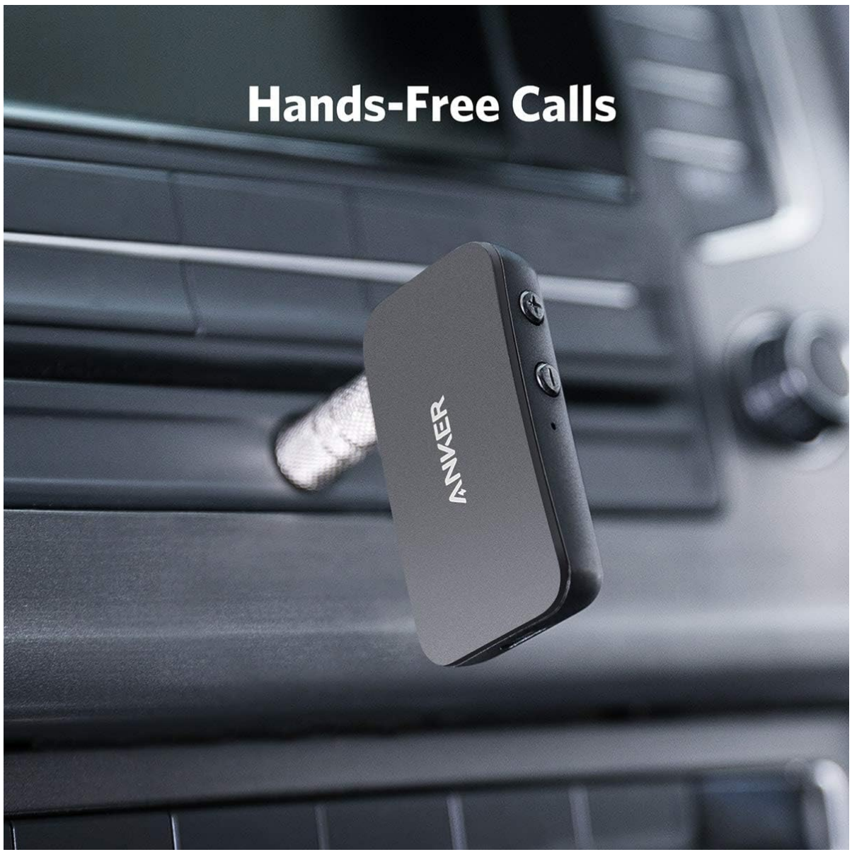
Image 6: Anker Soundsync A3352 mounted in a car's air vent, demonstrating its use for hands-free calls while driving.