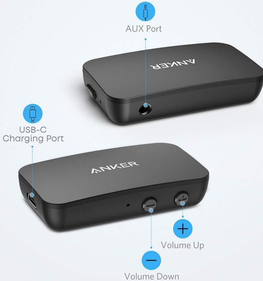
Image 3: Diagram showing the AUX Port and USB-C Charging Port on the Anker Soundsync A3352, along with the Volume Up and Volume Down buttons.