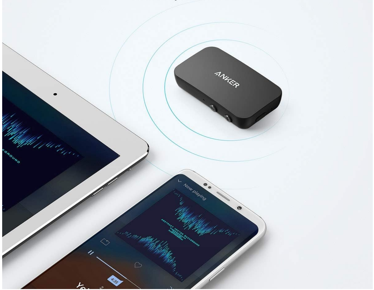
Image 5: Anker Soundsync A3352 wirelessly connected to both a tablet and a smartphone, demonstrating its dual connection capability.

Pair up to two devices to Soundsync A3352.