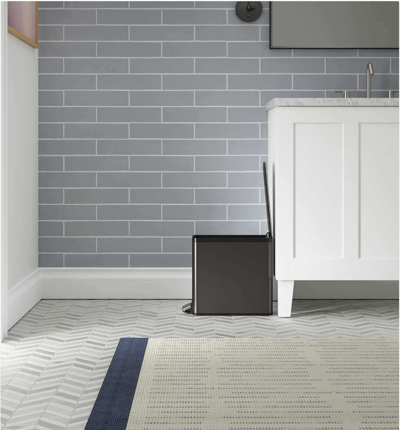
Figure 4: The lid in its convenient stay-open position.