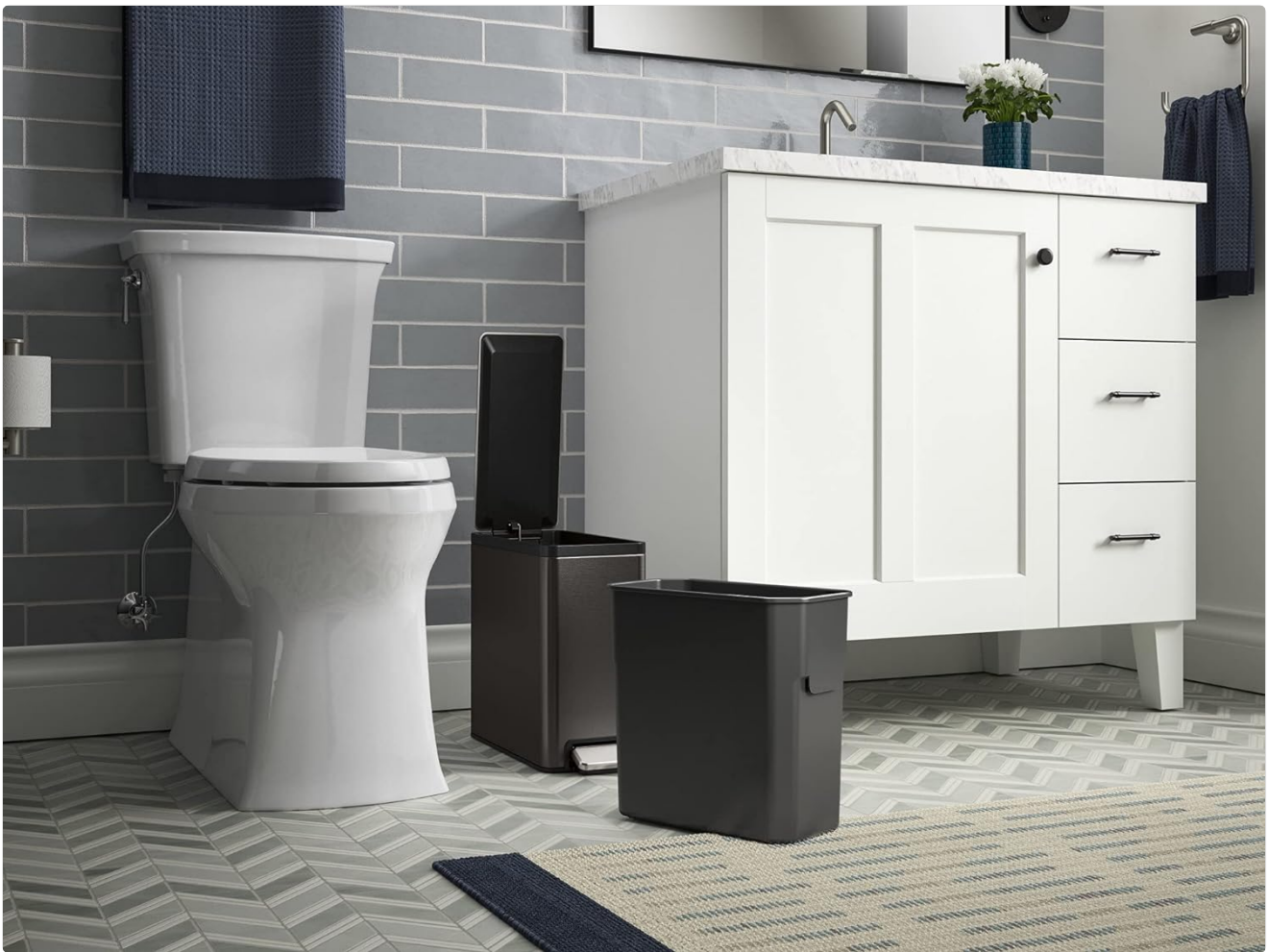
Figure 3: The removable liner for easy bag changes and cleaning.