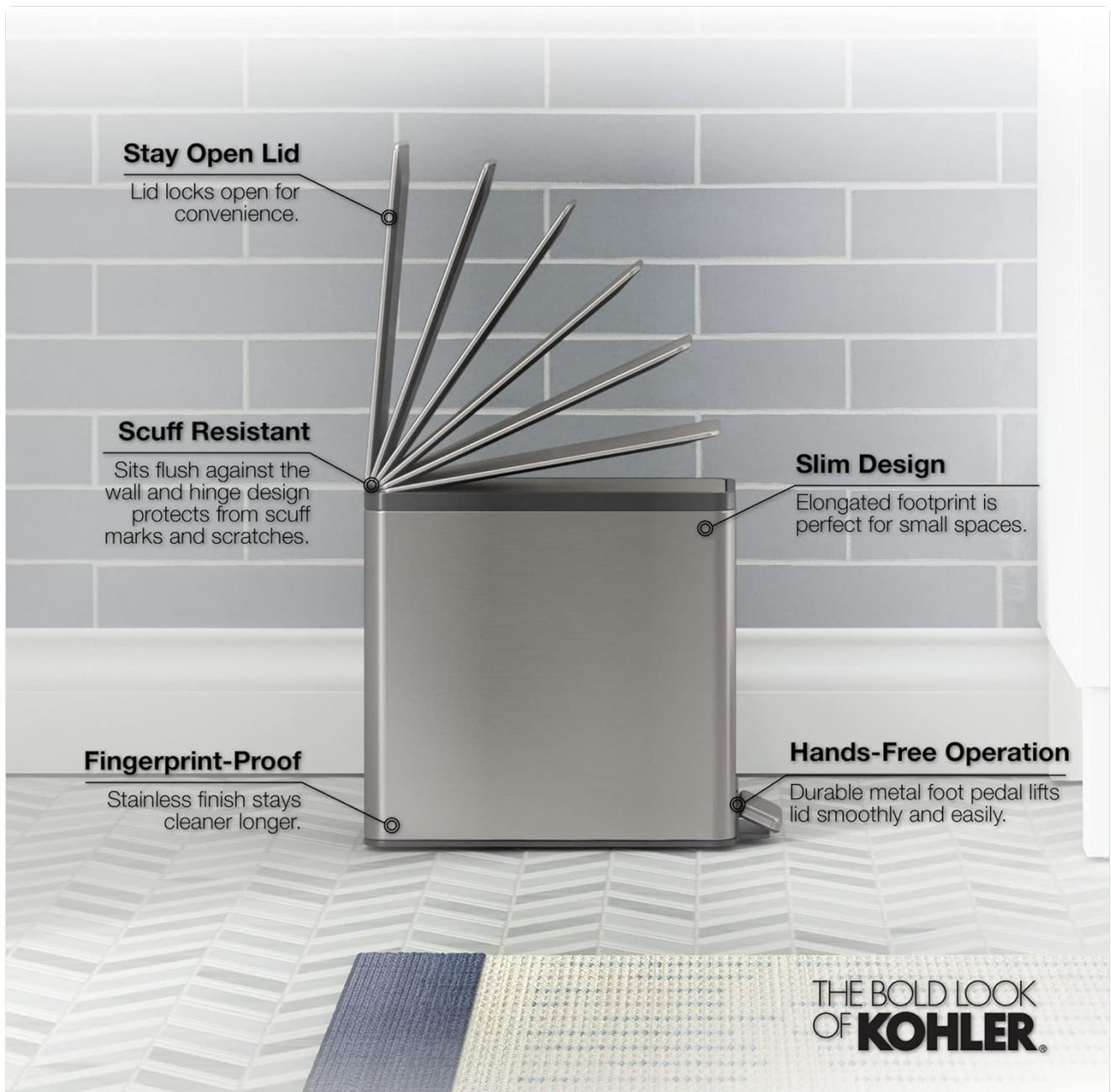
Figure 1: Key features of the KOHLER 2.5 Gallon Slim Step Trash Can.