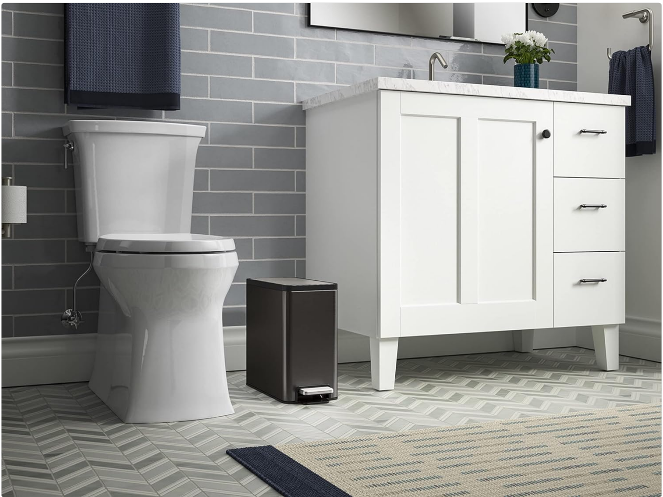
Figure 2: Optimal placement of the trash can in a compact bathroom setting.