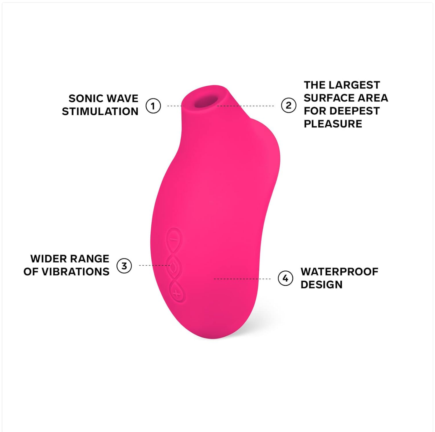
Image: Diagram illustrating the key features of the LELO SONA 2. These include sonic wave stimulation, a large surface area for enhanced pleasure, a wider range of vibration patterns, and a waterproof design.