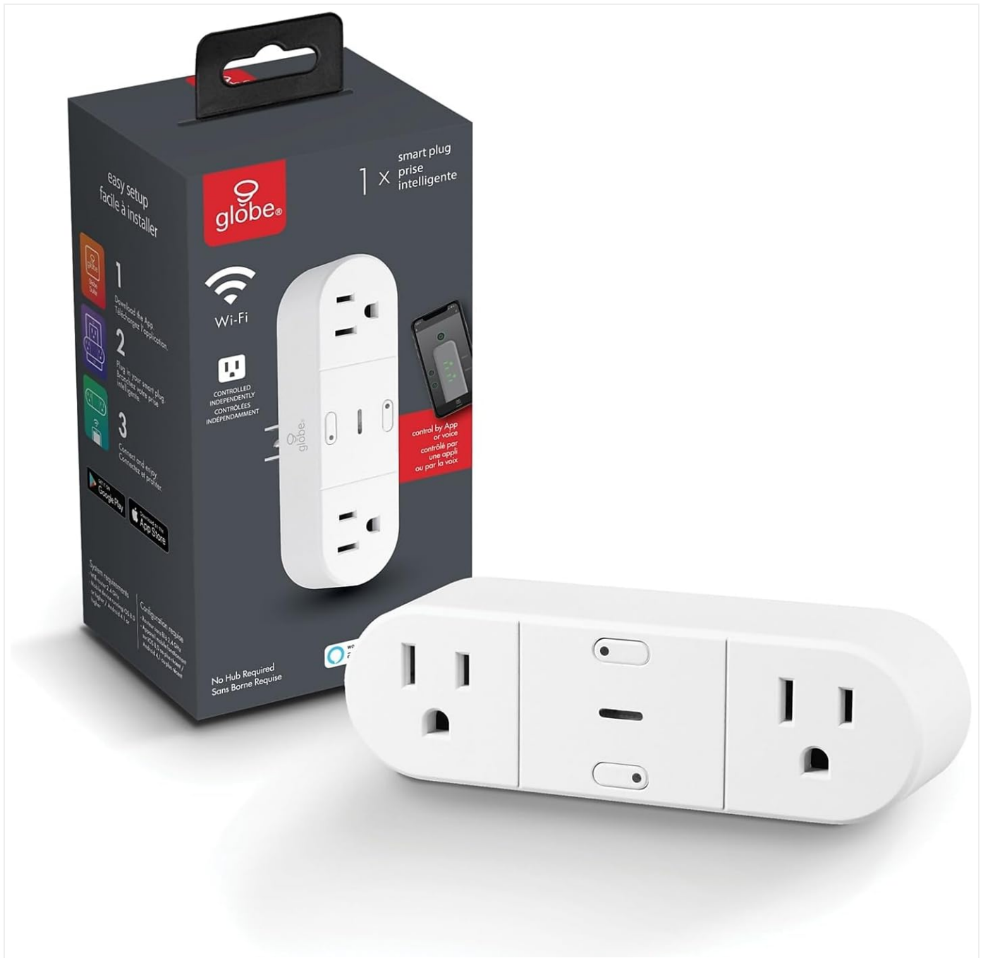
Image 2.1: The Globe Electric Smart Plug shown with its retail packaging.