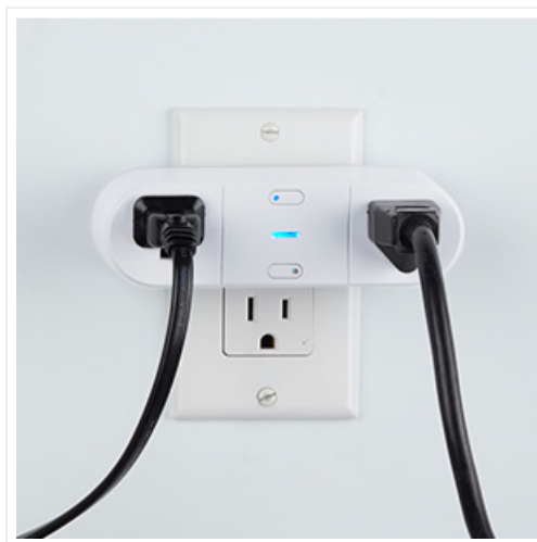
Image 3.1: The smart plug installed in a wall outlet with two devices connected, demonstrating its dual functionality.