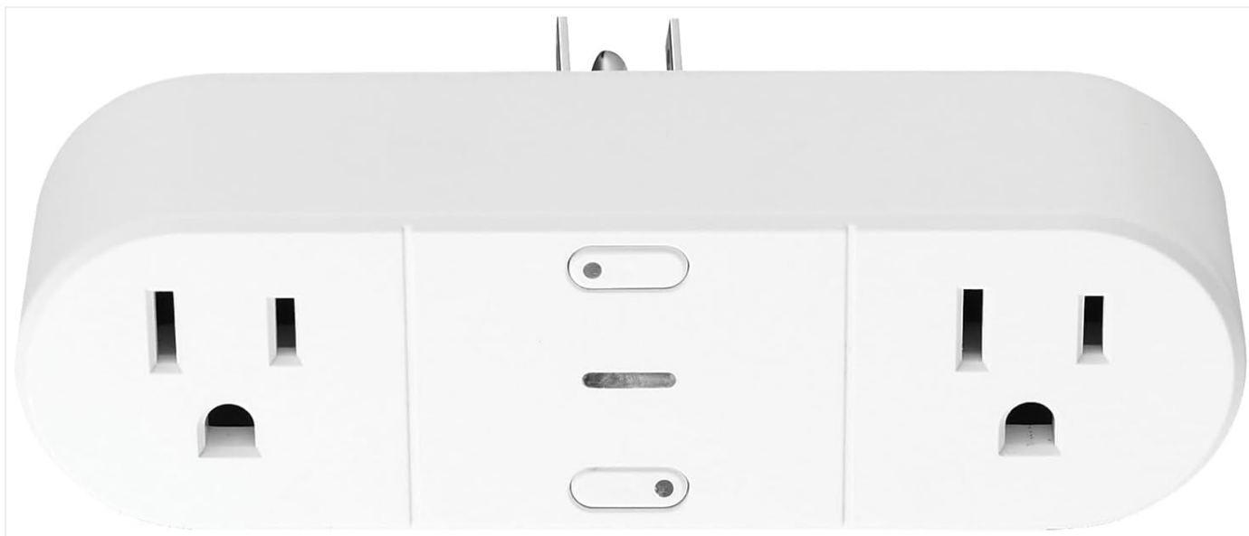
Image 1.1: The Globe Electric 50020 Collection Smart Plug, a white, compact device with two outlets.

The Globe Electric 50020 Collection Smart Plug allows you to automate your home devices using a smartphone app or voice commands. This compact smart plug features two independently controlled outlets, enabling flexible management of various household items. It connects directly to your home Wi-Fi network without requiring a separate hub.