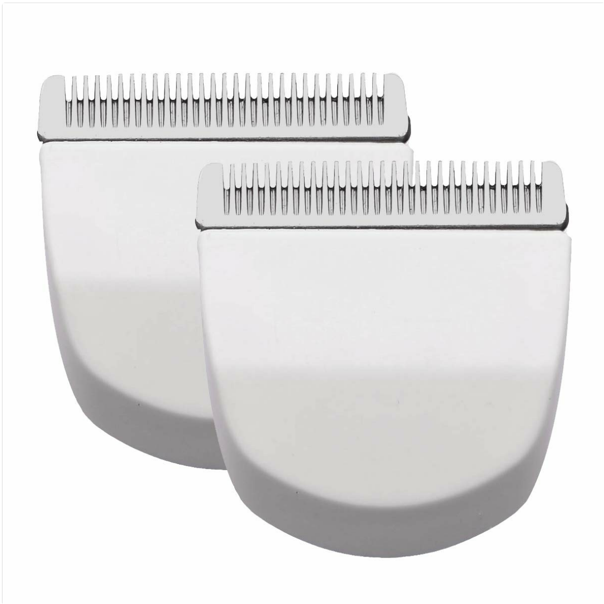
Image: Two white Audoc replacement blades, ready for installation.