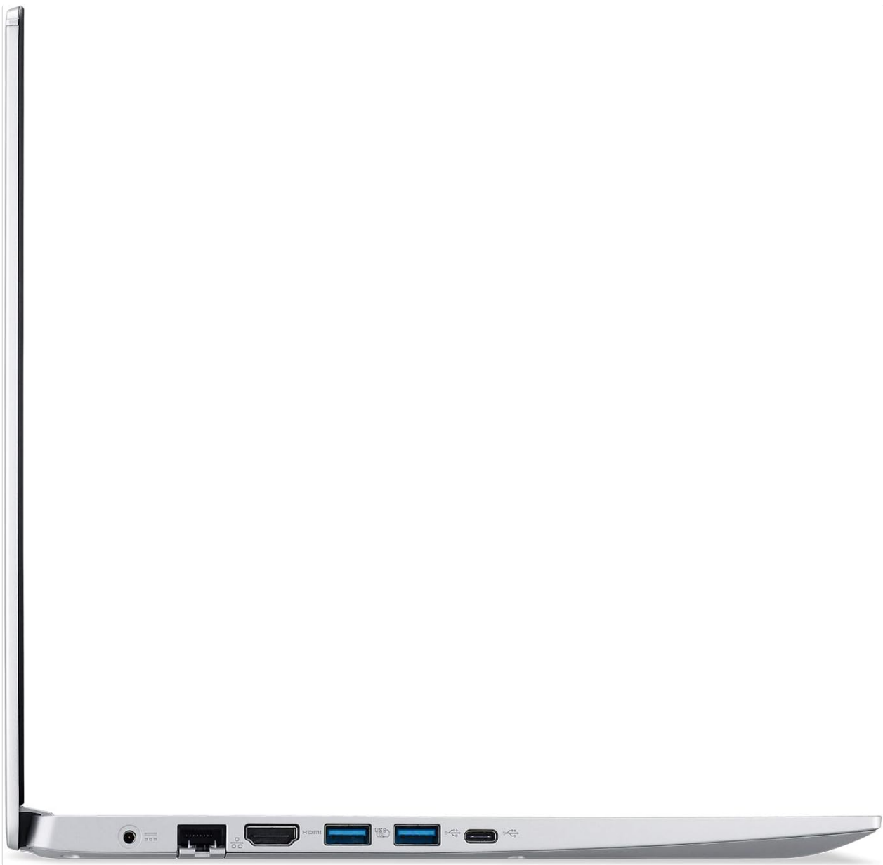
Figure 8: Right Side Ports