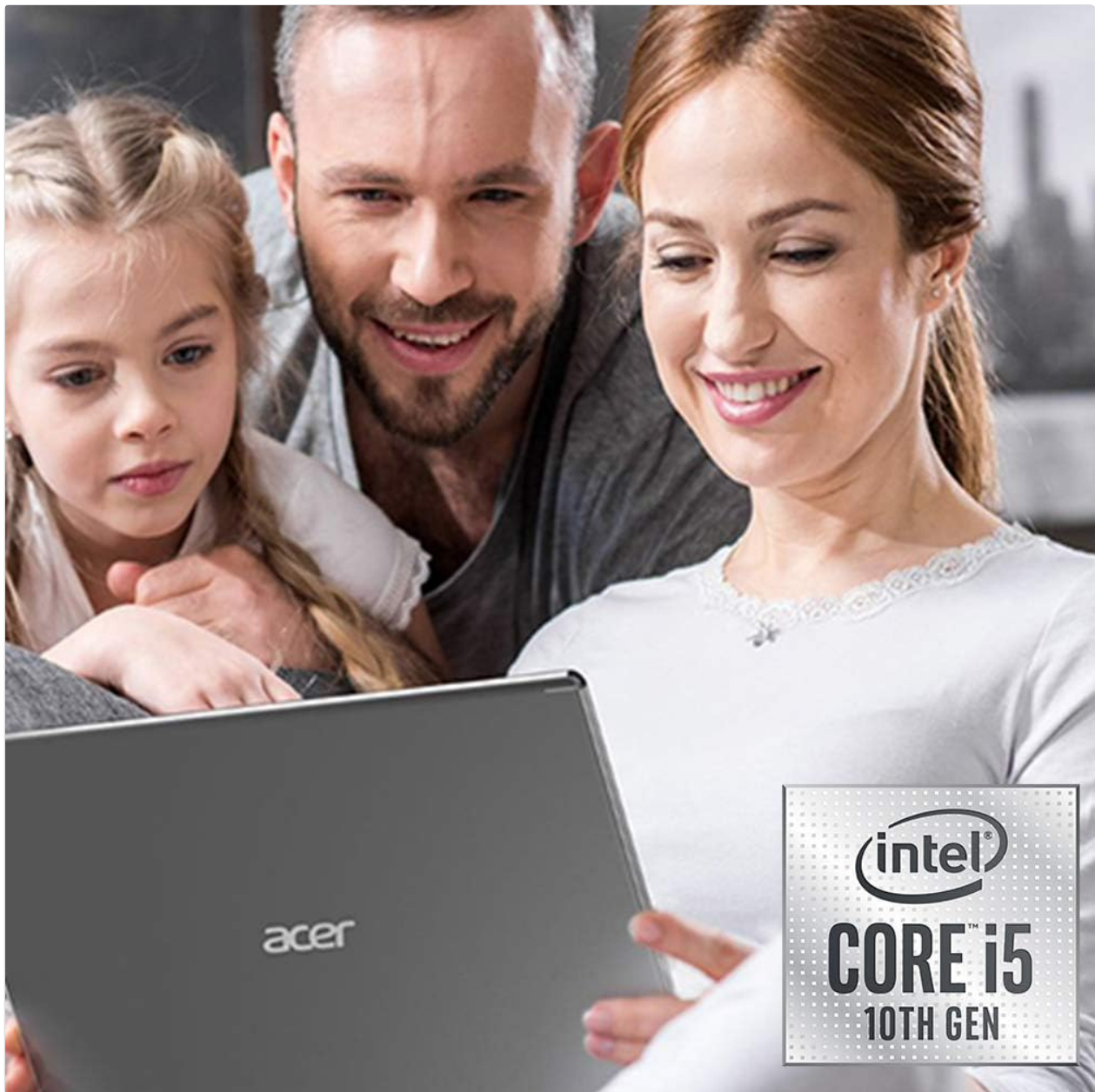
Figure 3: Intel Core i5 10th Generation Processor