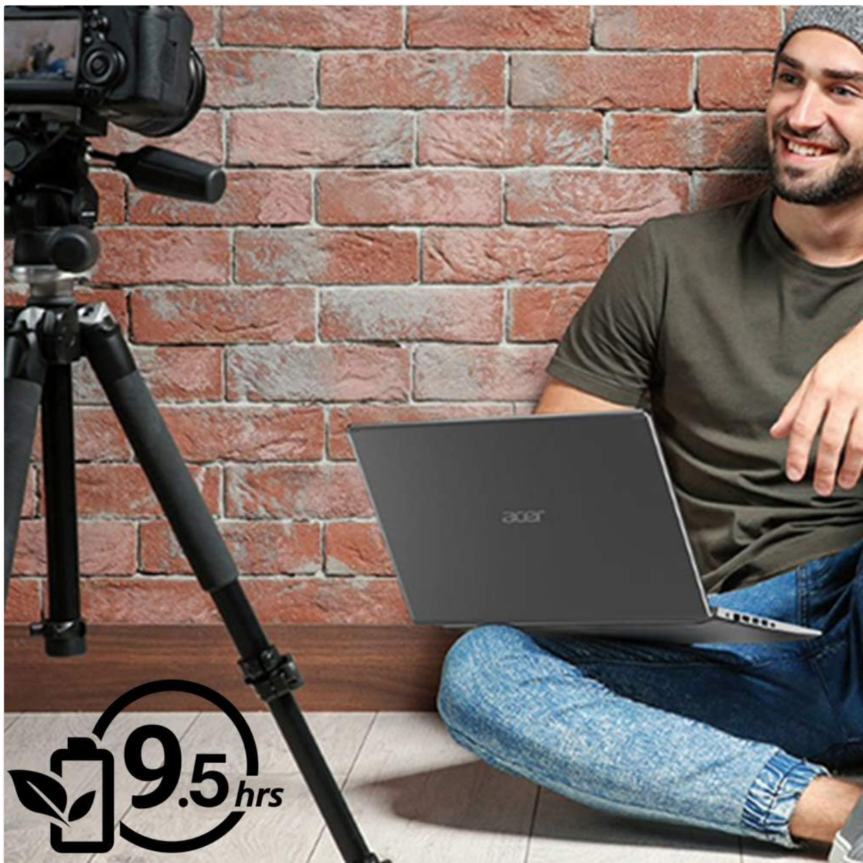
Figure 5: Up to 9.5 Hours Battery Life