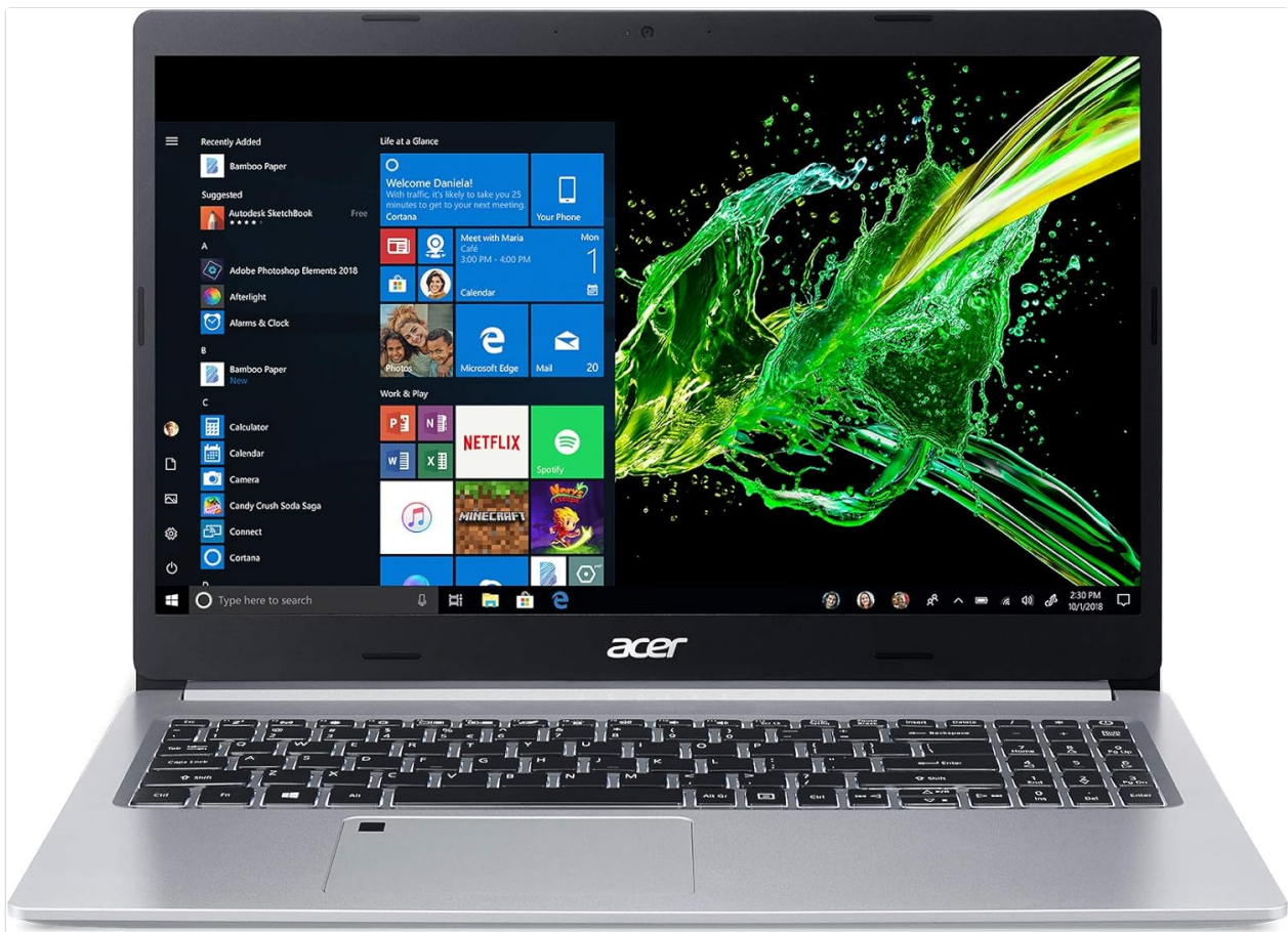
Figure 6: Backlit Keyboard and Fingerprint Reader