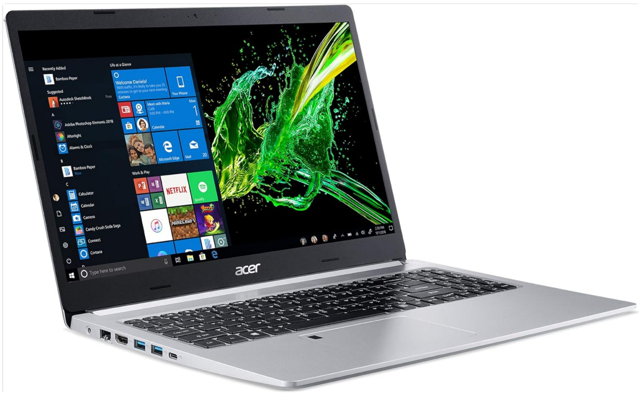
Figure 1: Acer Aspire 5 Slim Laptop