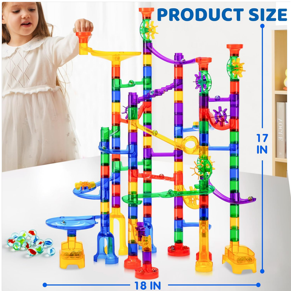
Figure 3.2: Assembled marble run with approximate dimensions.