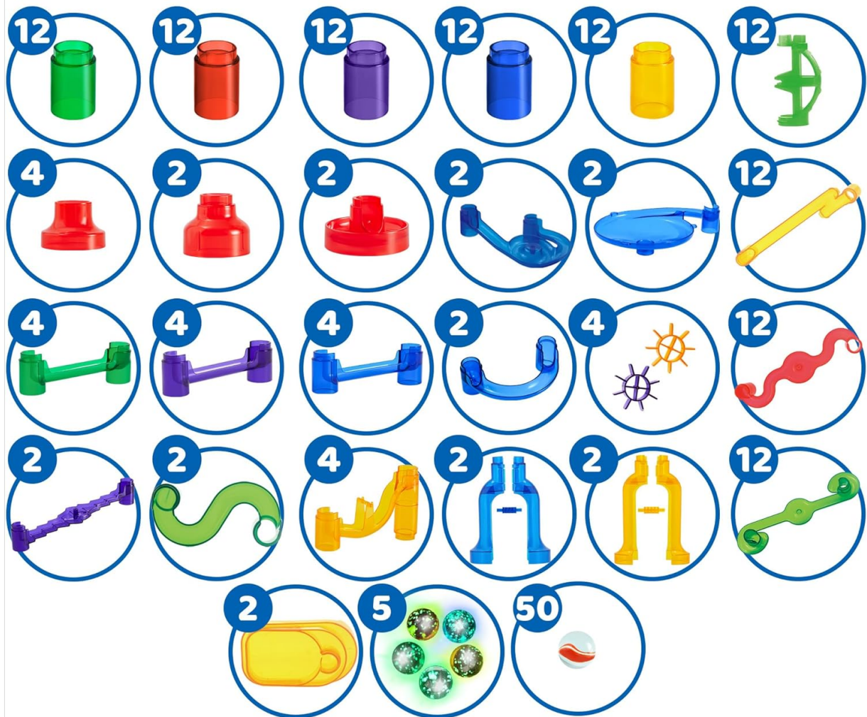
Figure 2.1: Overview of included parts and marbles.

Includes 100-piece multi-color action parts and 50 regular size glass marbles.