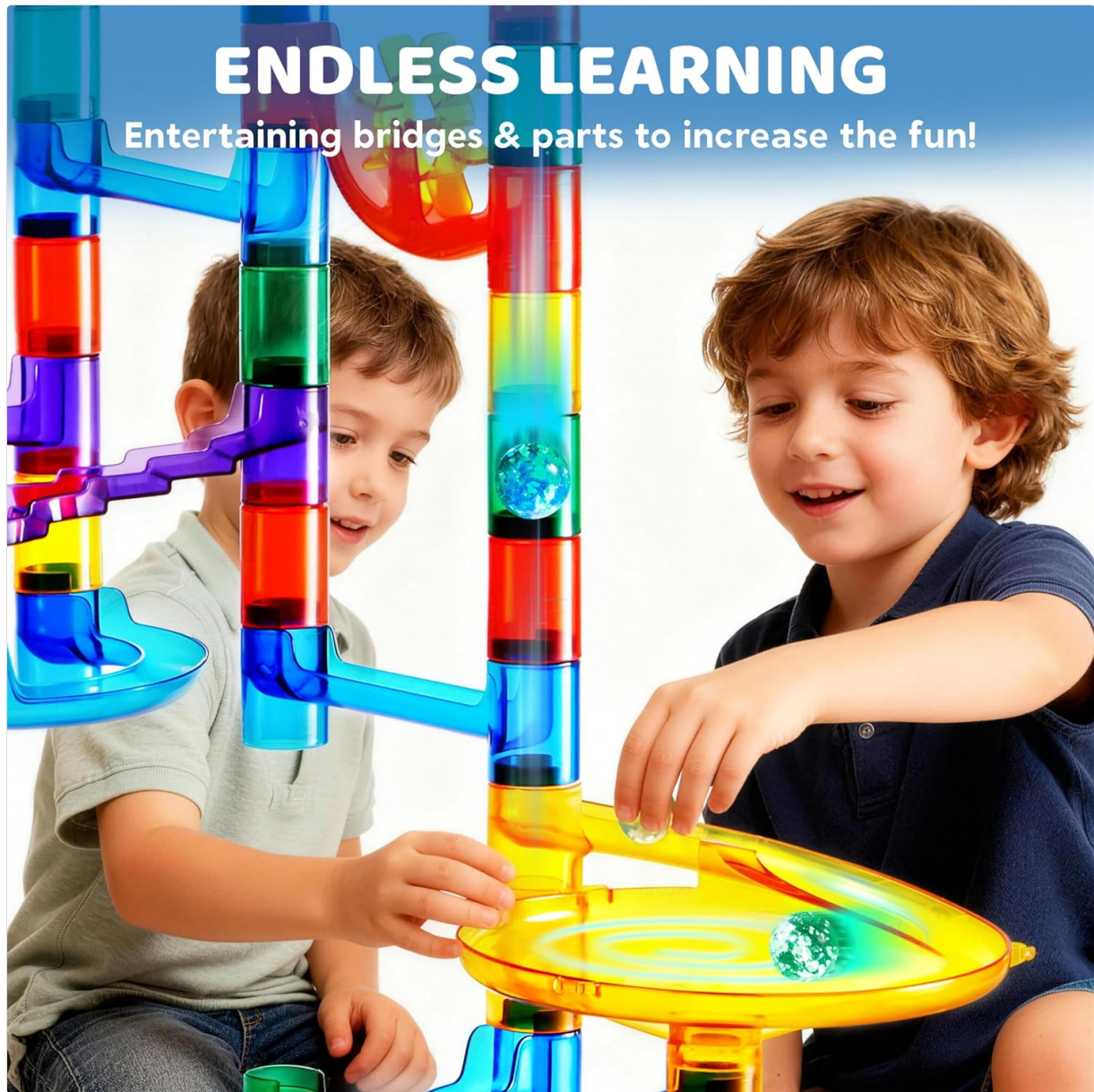
Figure 4.1: Children engaging with the marble run, demonstrating interactive play.