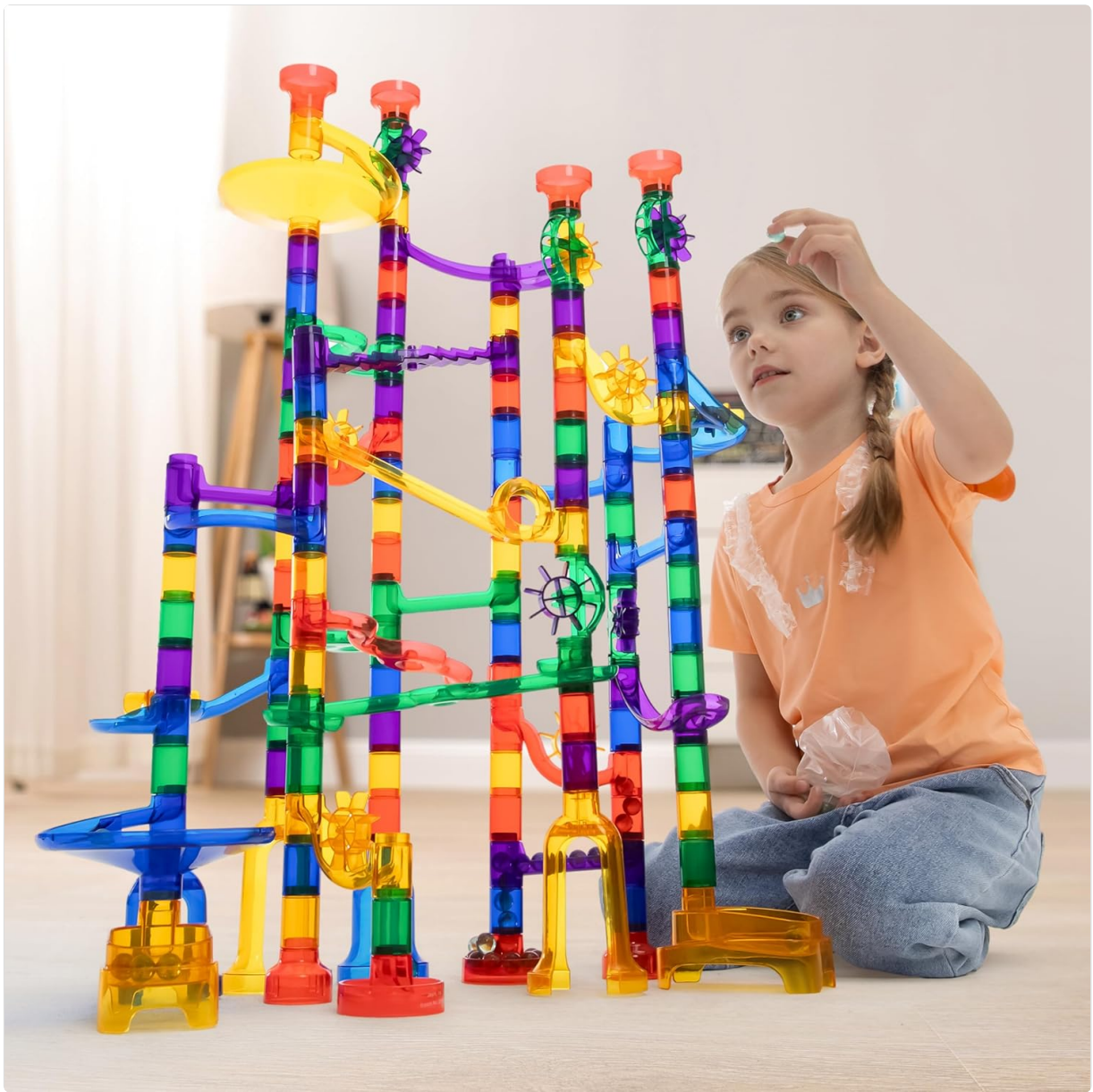
Figure 4.2: A child initiating marble play on the track.