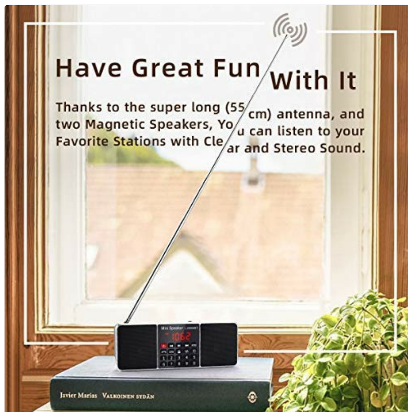
Figure 5.1: The PRUNUS J-288 with its ultra-long telescopic antenna extended, illustrating its role in enhancing radio signal reception.