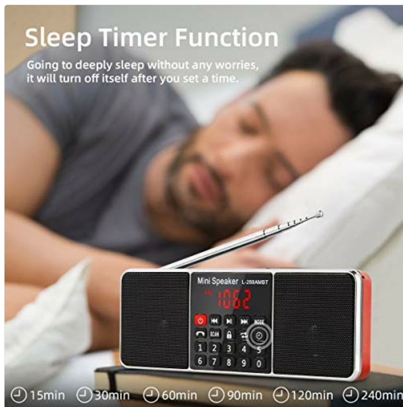
Figure 6.4: The PRUNUS J-288 displaying the sleep timer function, allowing users to set automatic shutdown times.