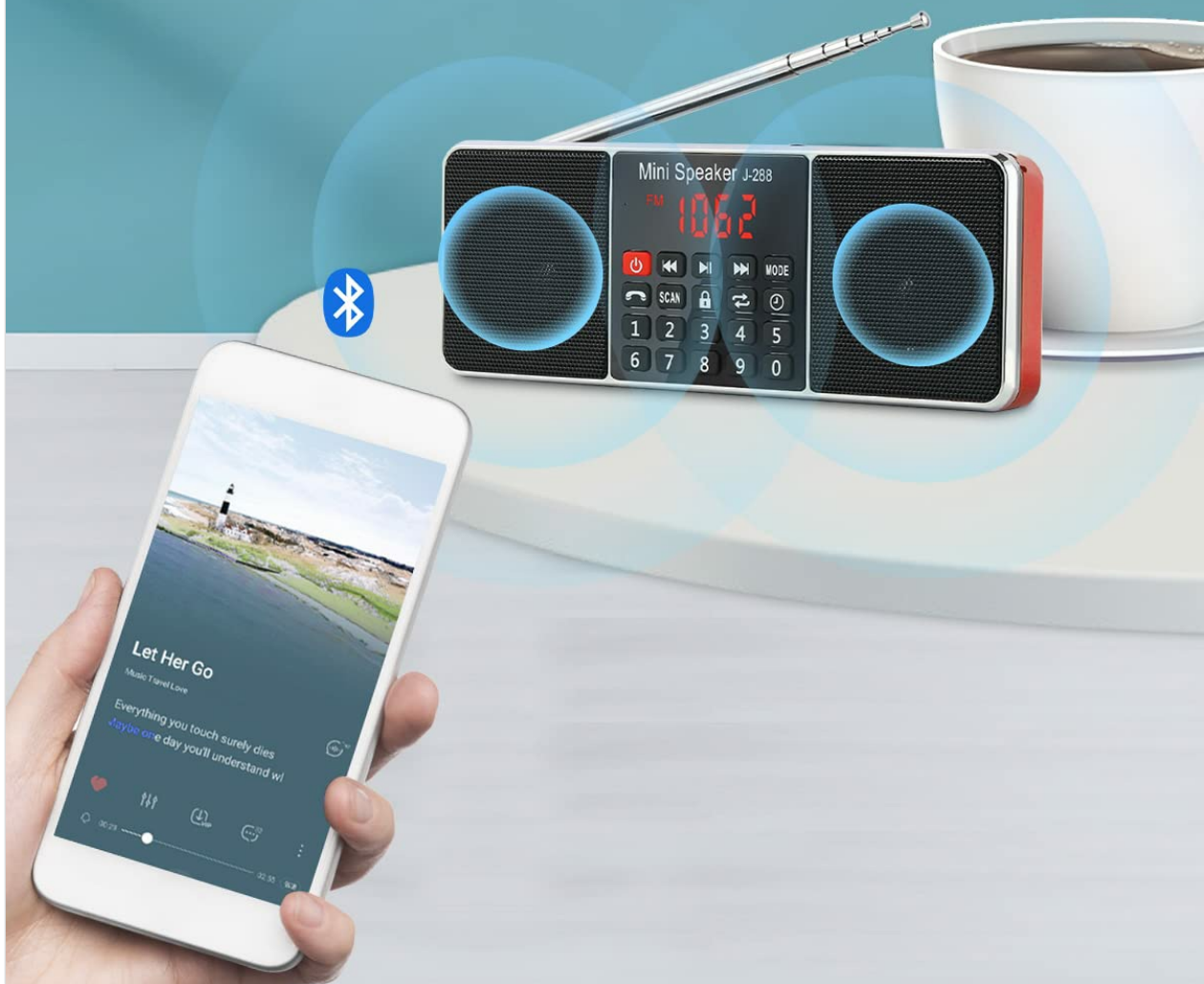
Figure 6.2: The PRUNUS J-288 functioning as a wireless Bluetooth speaker, connected to a smartphone playing music.