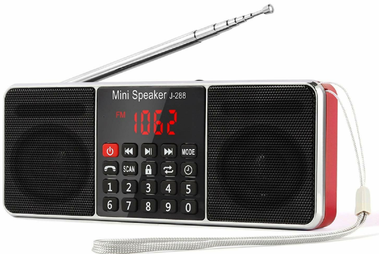
Figure 1.1: Front view of the PRUNUS J-288 Portable Radio, showcasing its compact design, speaker grilles, digital display, and control buttons.