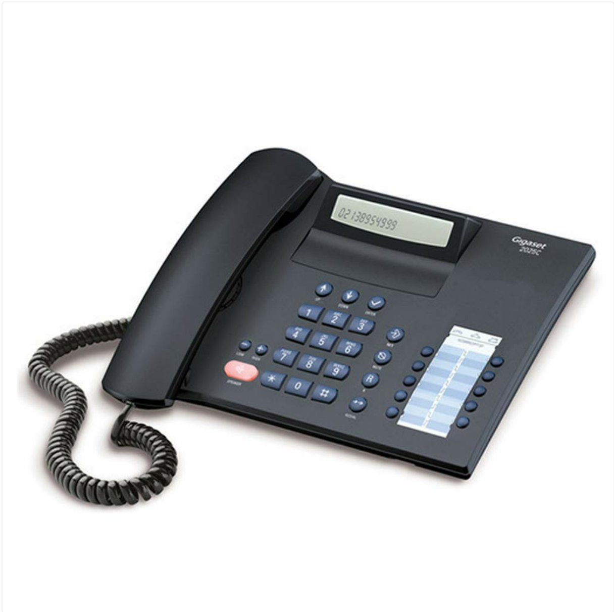
Figure 4.1: Euroset 2025C Corded Landline Phone (Overall View)

This image displays the complete Euroset 2025C phone unit, including the base, keypad, display, and handset. The phone is black with a coiled handset cord. The display shows a sample number, and the keypad features standard numeric keys, function keys, and a set of repertory keys on the right side.