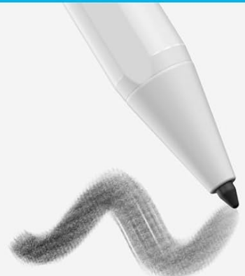
Image: A magnified view of the stylus tip, emphasizing its fine point for accurate writing and drawing.