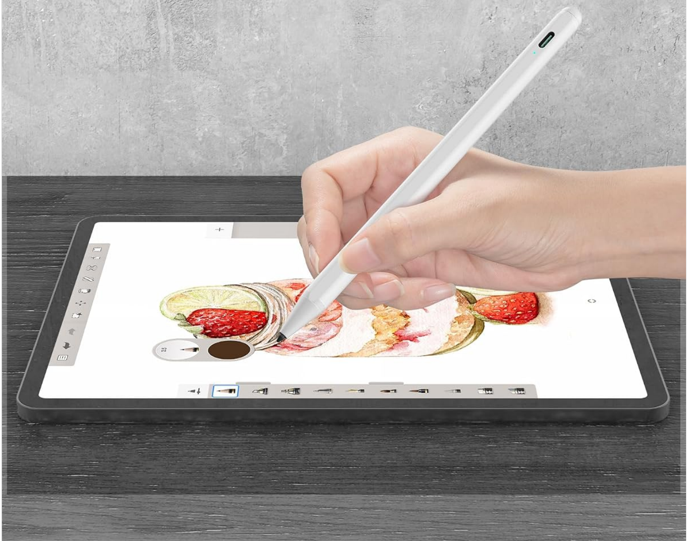
Image: A user's hand resting on the iPad screen while drawing with the stylus, showcasing the palm rejection feature.

Feel free to rest your hand on screen. The pen can be written like a pencil.