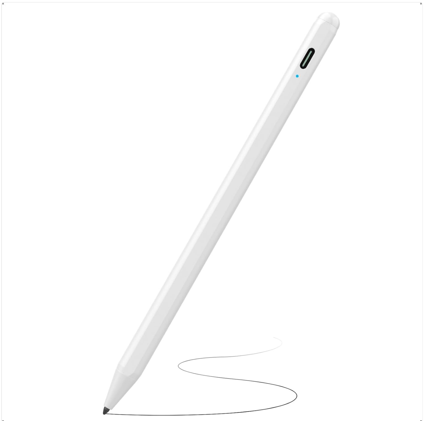
Image: The XIRON Stylus Pen, illustrating its sleek design and functionality.