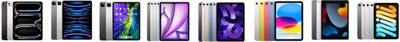
iPad Pro 2024

M4 13 Inch A2925/2926 A3007 M4 11 Inch A2836/A2837 A3006