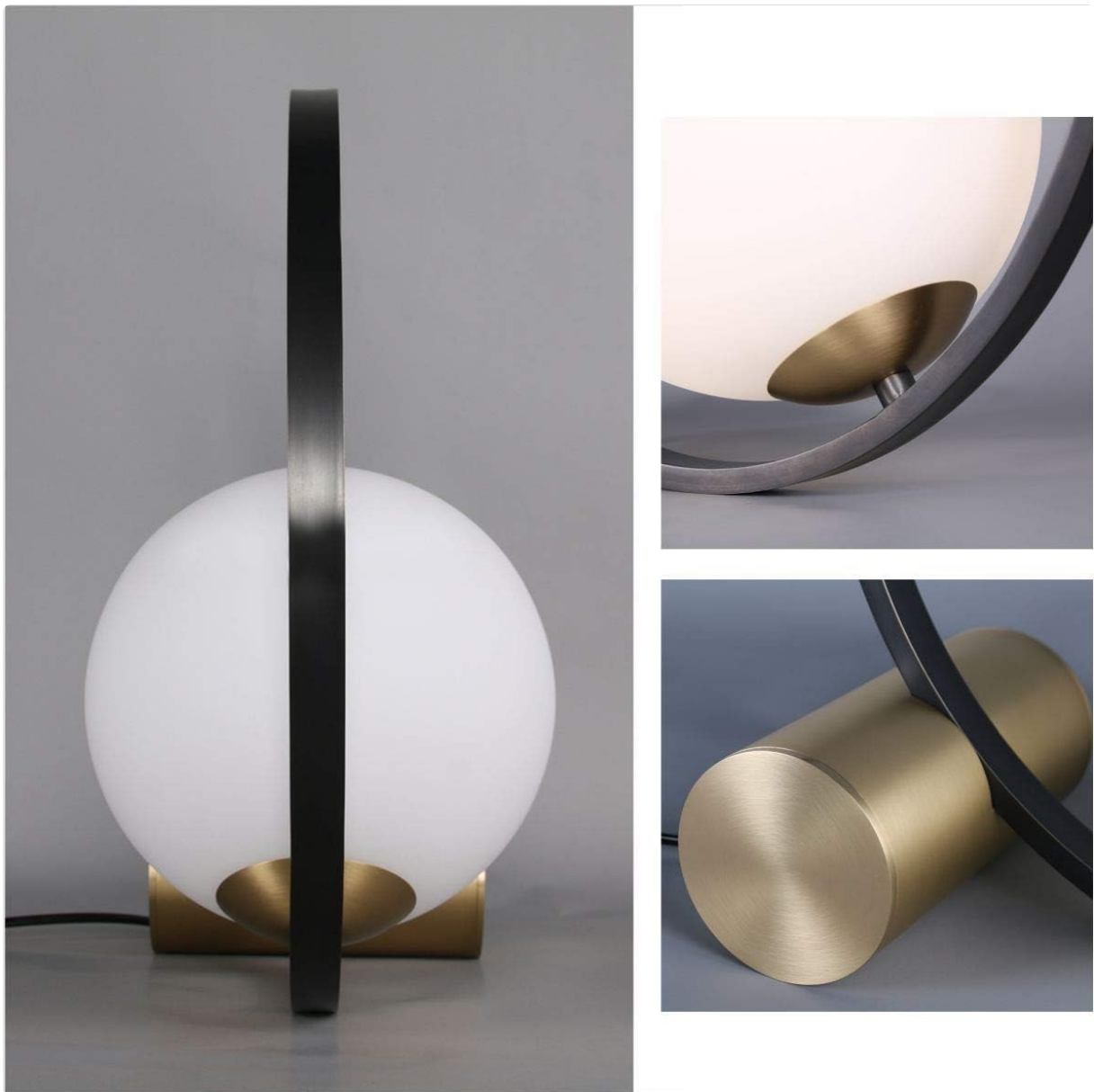
Figure 2: Detail of the lamp's base and the secure attachment of the glass globe. This image highlights the connection points and the sturdy metal construction.