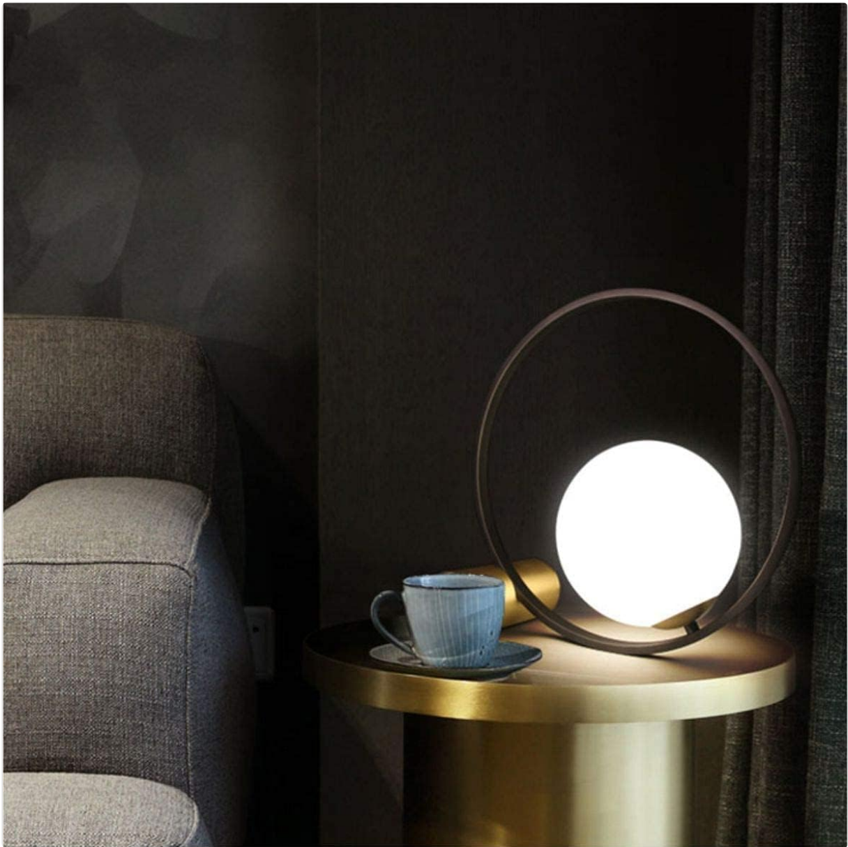
Figure 3: The KCO Lighting Table Lamp in operation, providing warm illumination. This image demonstrates the lamp's light output in a typical room setting.