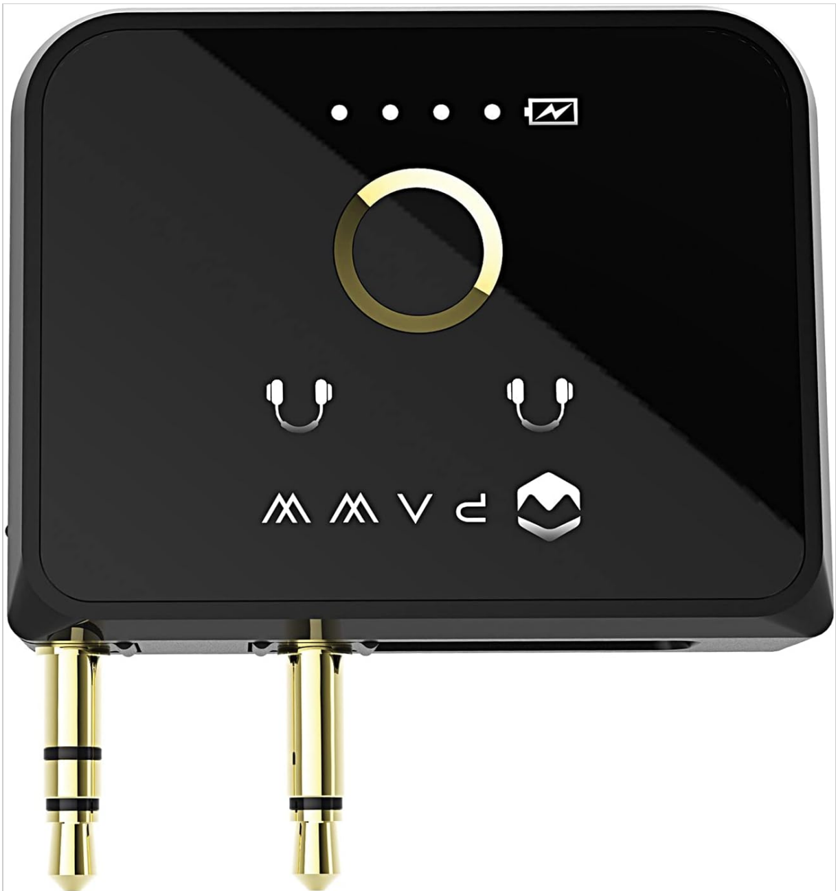
Image: The Paww WaveCast with both dual 3.5mm audio jacks extended, suitable for in-flight entertainment systems or other dual-jack audio sources.