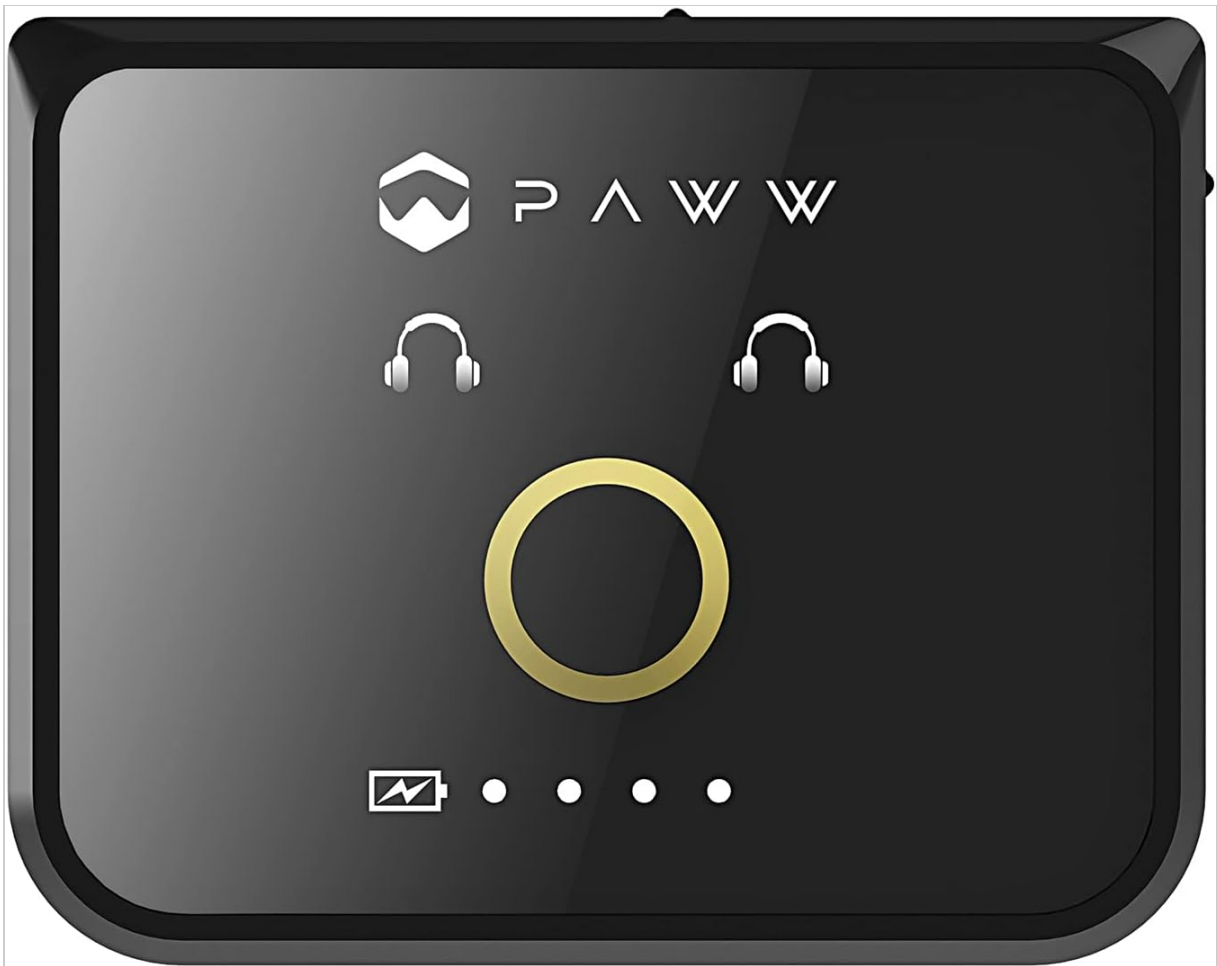
Image: Top view of the Paww WaveCast, highlighting the central power/pairing button, two headphone icons indicating dual connection capability, and four LED battery/status indicators.