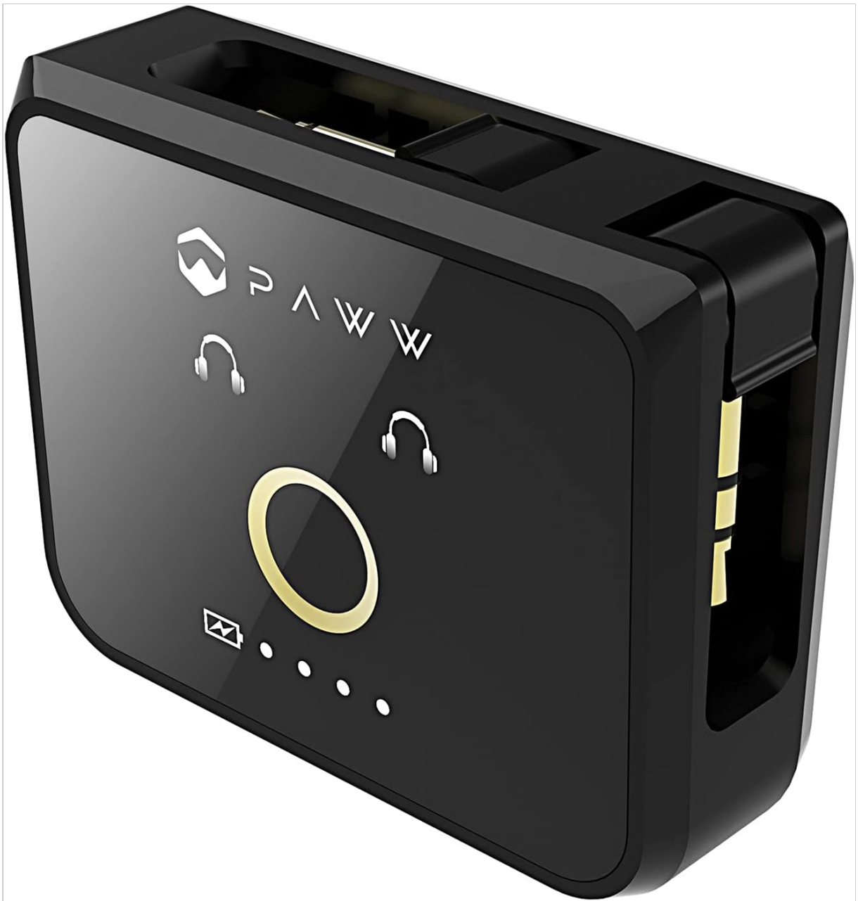
Image: The Paww WaveCast with its single 3.5mm audio jack extended, ready for connection to standard audio ports.