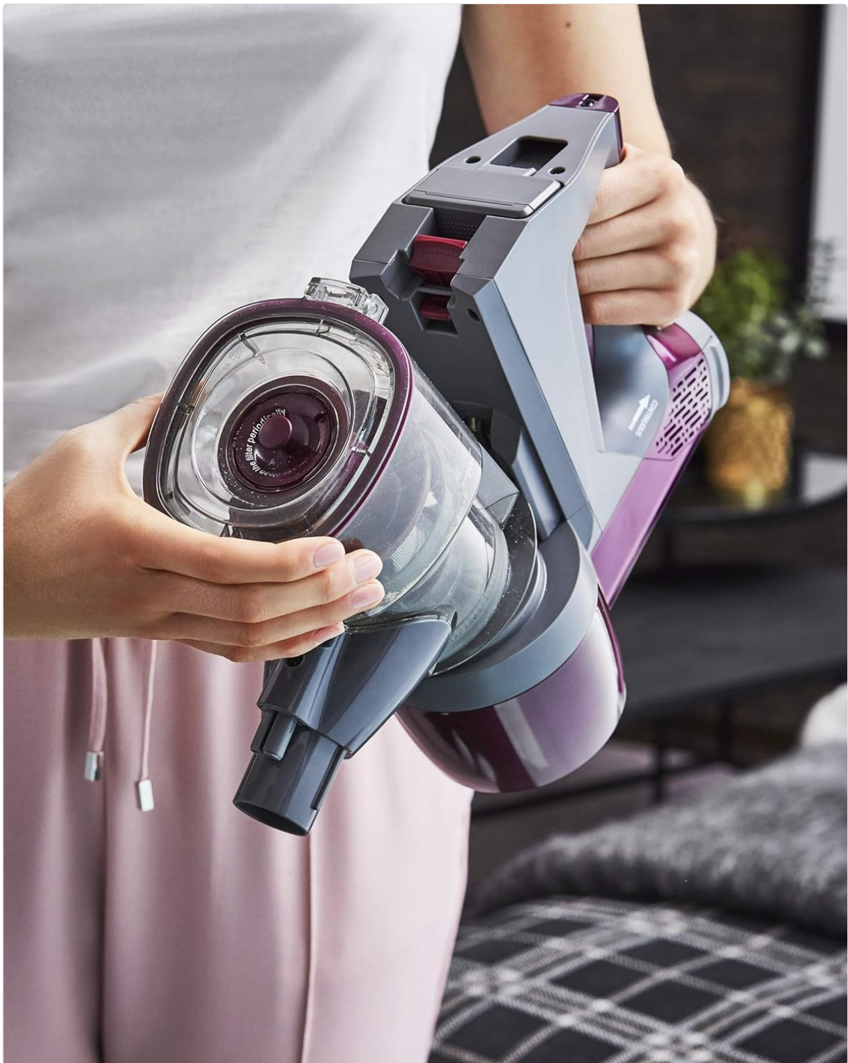
Figure 11: Detaching the dust container for emptying.