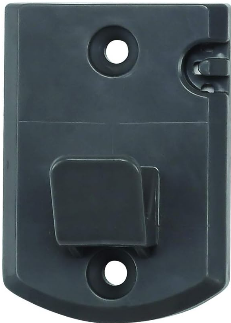
Figure 4: The wall mount for convenient storage.