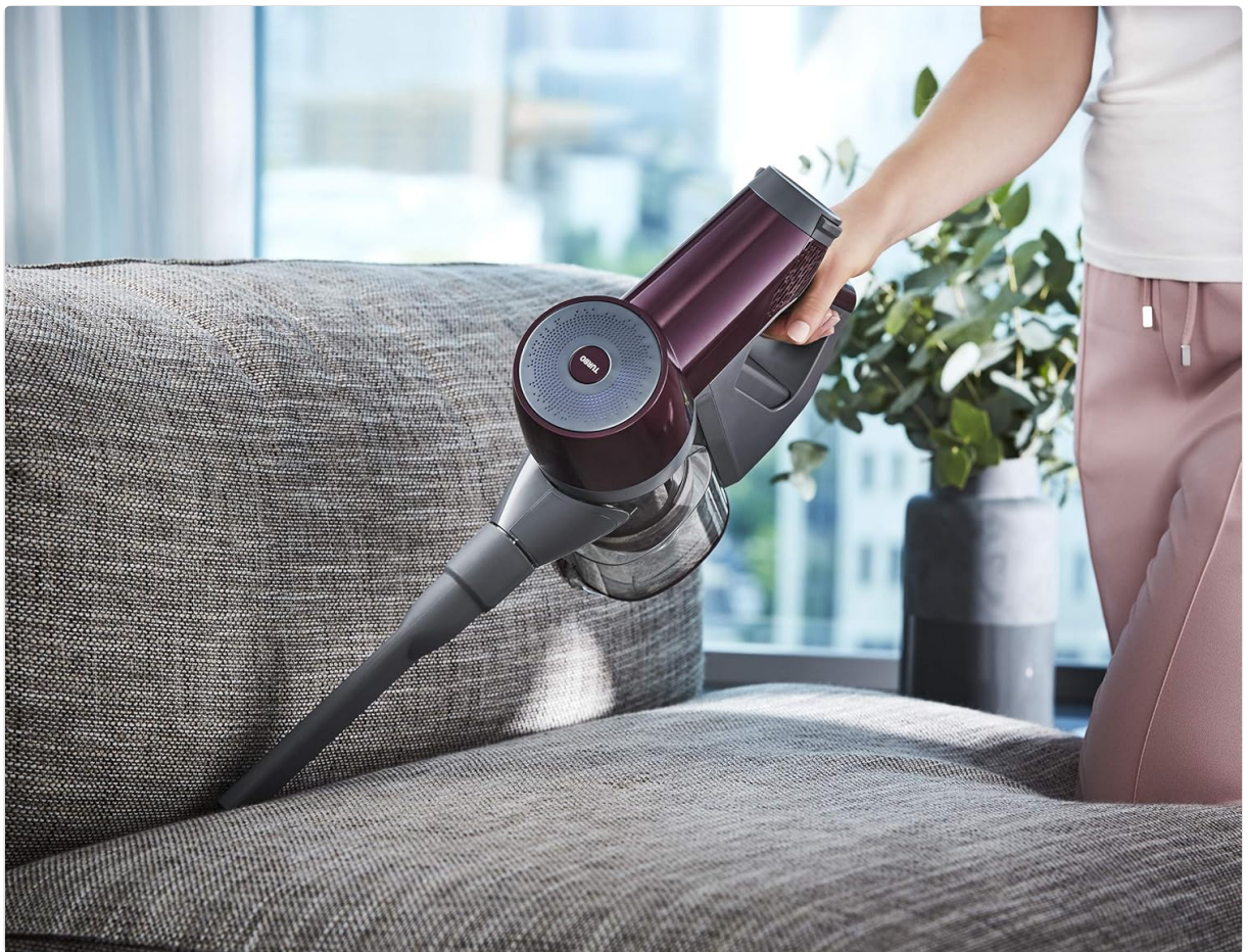
Figure 8: Cleaning upholstery with the handheld vacuum.