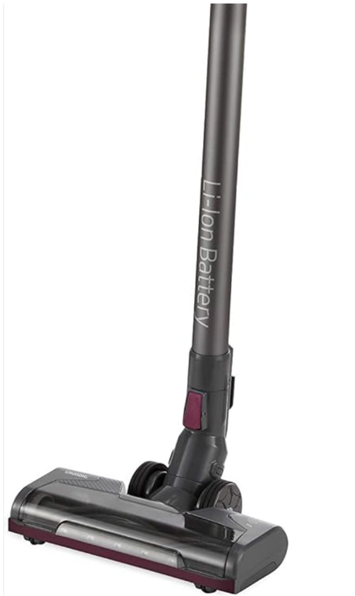
Figure 2: The GRUNDIG VCP 3830 assembled for floor cleaning.