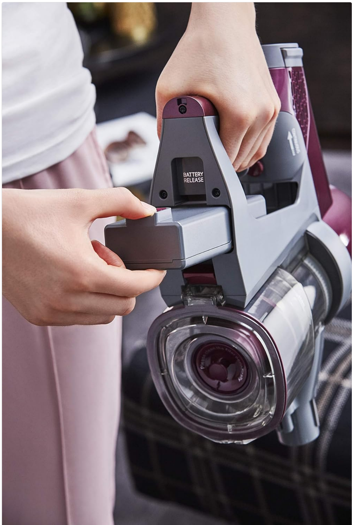
Figure 3: The removable battery feature of the vacuum cleaner.