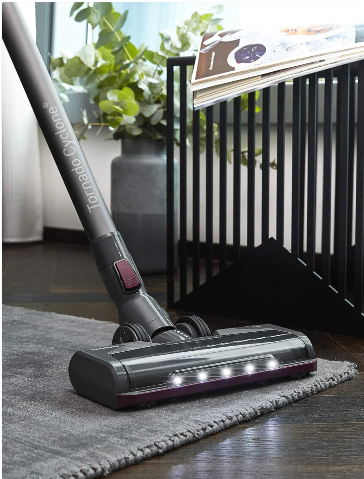
Figure 5: The vacuum cleaner's LED lights in action, highlighting dust on the floor.