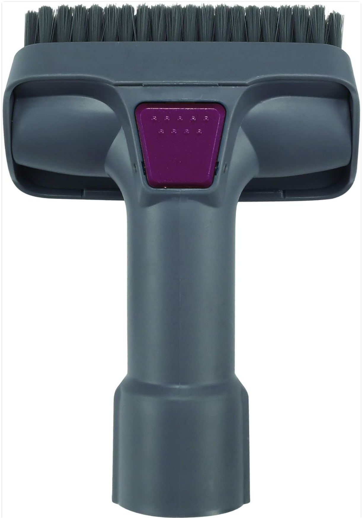
Figure 9: The versatile 2-in-1 attachment.