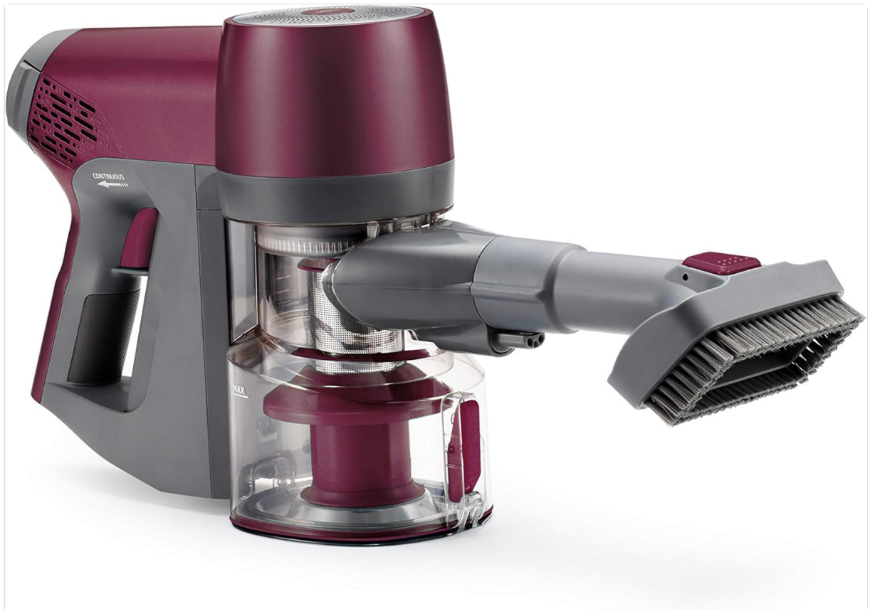
Figure 7: The vacuum cleaner configured for handheld use with the 2-in-1 attachment.