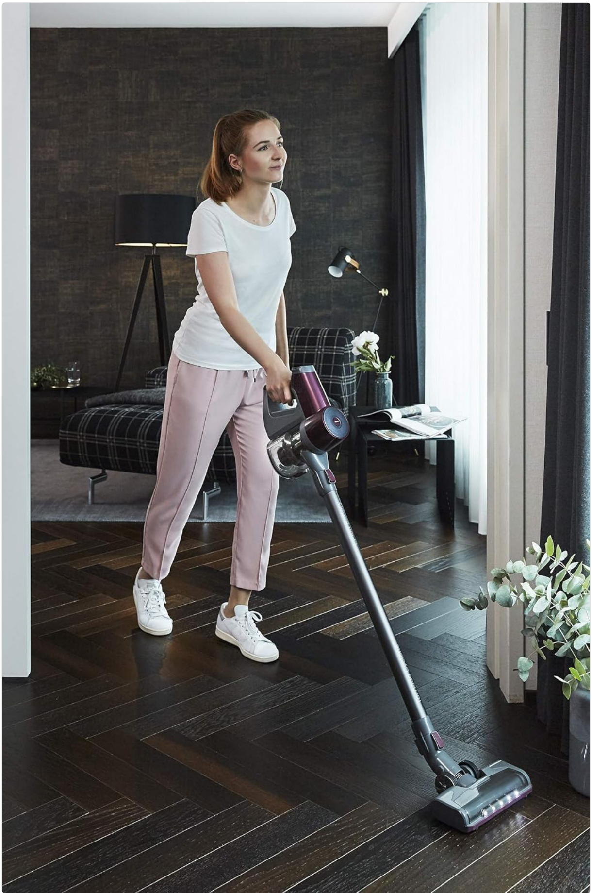
Figure 6: Demonstrating the GRUNDIG VCP 3830 in stick vacuum mode.