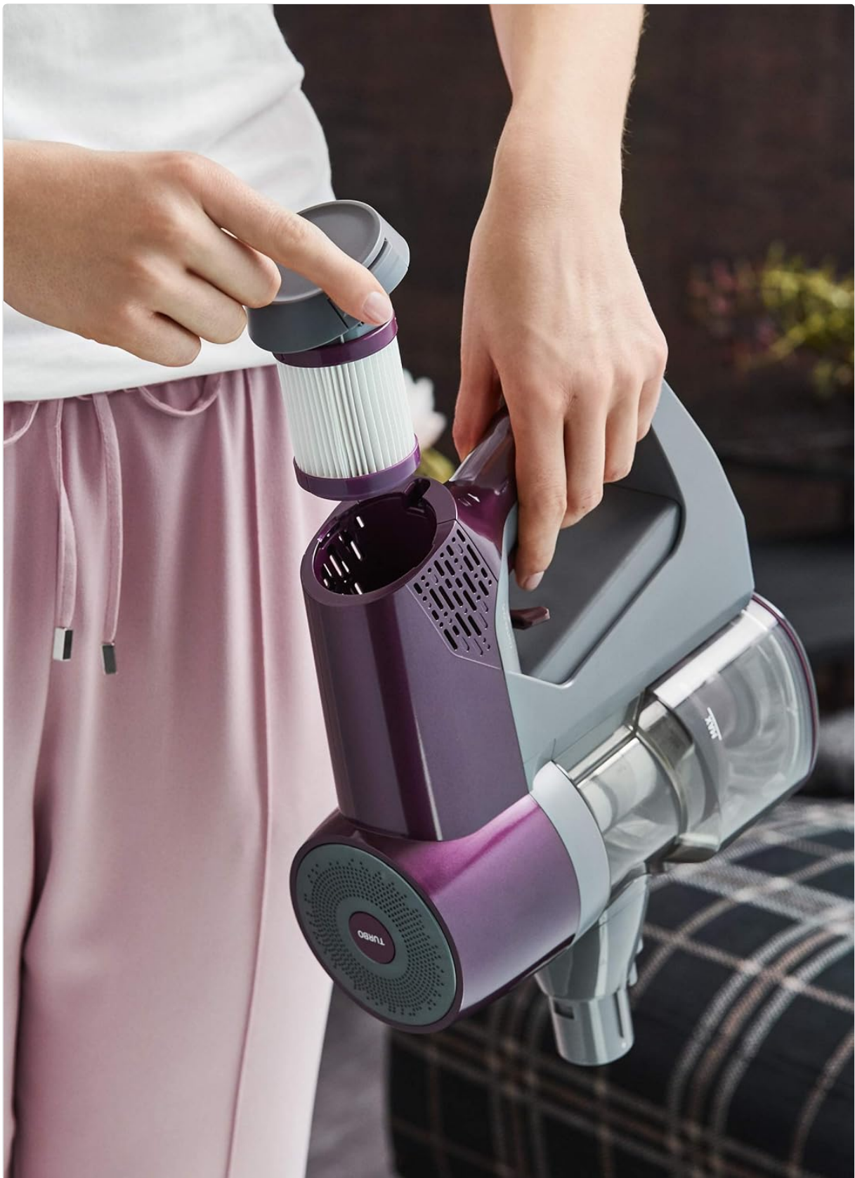
Figure 12: Removing the HEPA filter for cleaning.