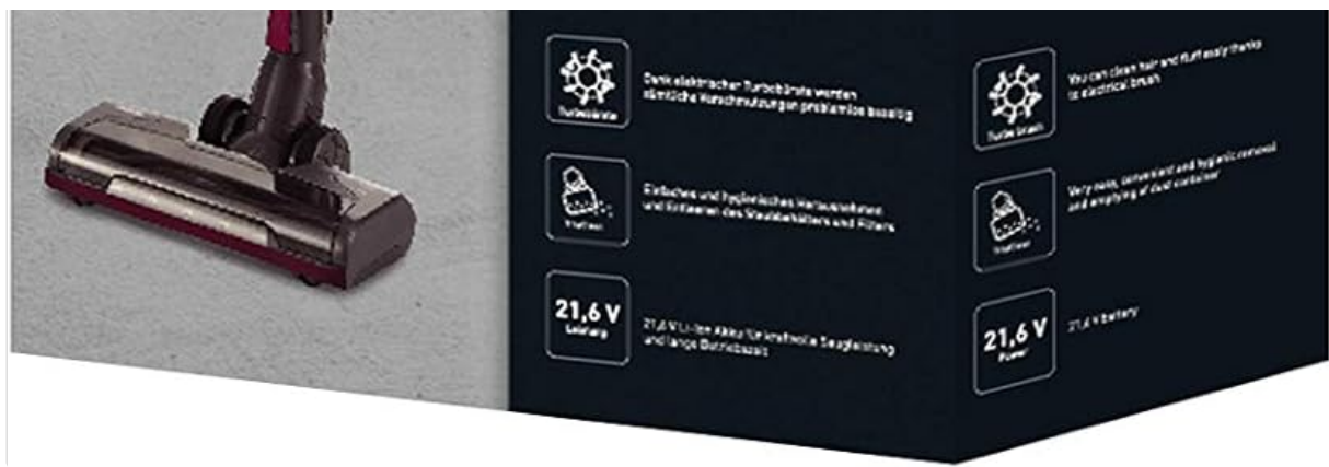
Figure 1: Overview of the GRUNDIG VCP 3830 Cordless Handheld Vacuum Cleaner and its included accessories.