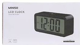
Figure 2: Front view of the MINISO Casual Style Electronic Clock. The image displays the rectangular black clock with a large, clear digital display.