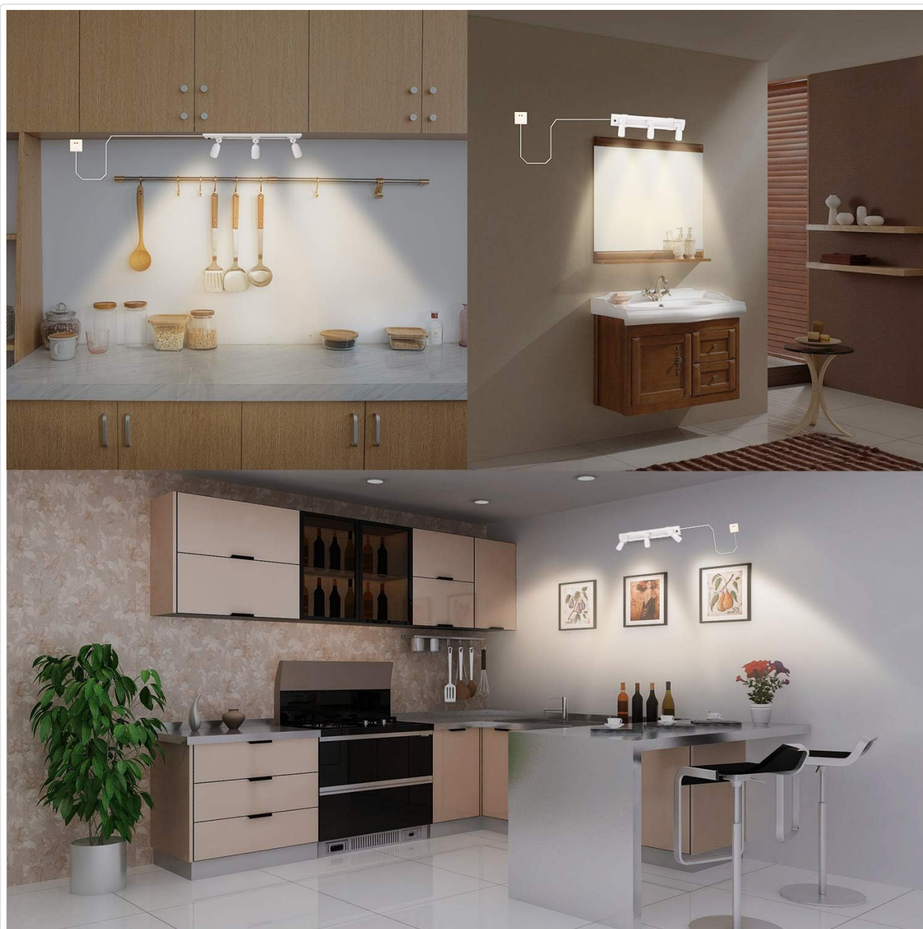
Figure 1.2: Examples of the HONWELL H1830 LED Track Lighting System in use, demonstrating its application for under-cabinet lighting in a kitchen, above a bathroom mirror, and as accent lighting for wall art.