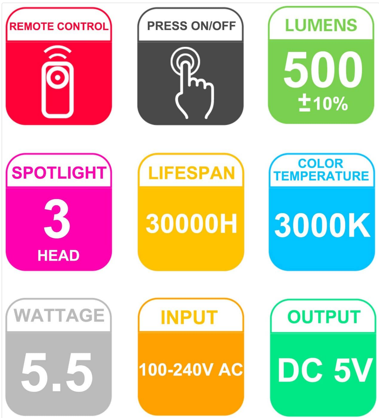
Figure 8.1: Summary of key product specifications for the HONWELL H1830 LED Track Lighting System.