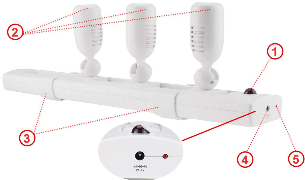
Figure 3.2: Illustration of the multi-directional light head adjustments. Each spotlight can slide along the track, pivot up/down by 180 degrees, and rotate left/right by 310 degrees to customize light direction.