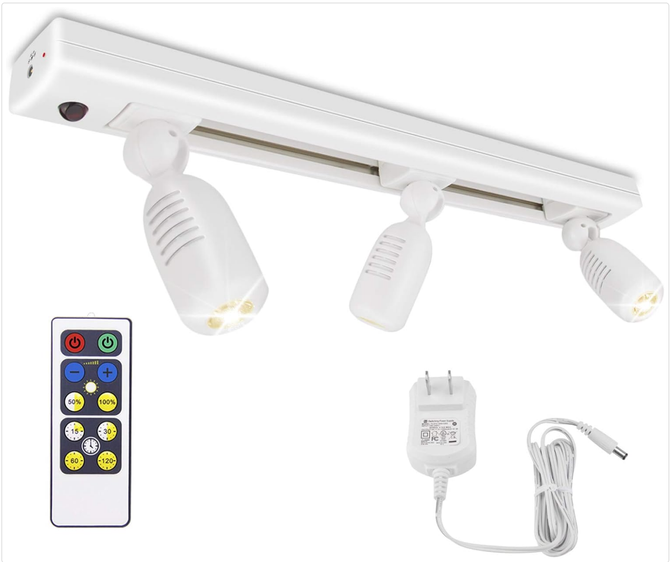
Figure 1.1: The HONWELL H1830 LED Track Lighting System, including the main track with three adjustable spotlights, the remote control, and the power adapter.