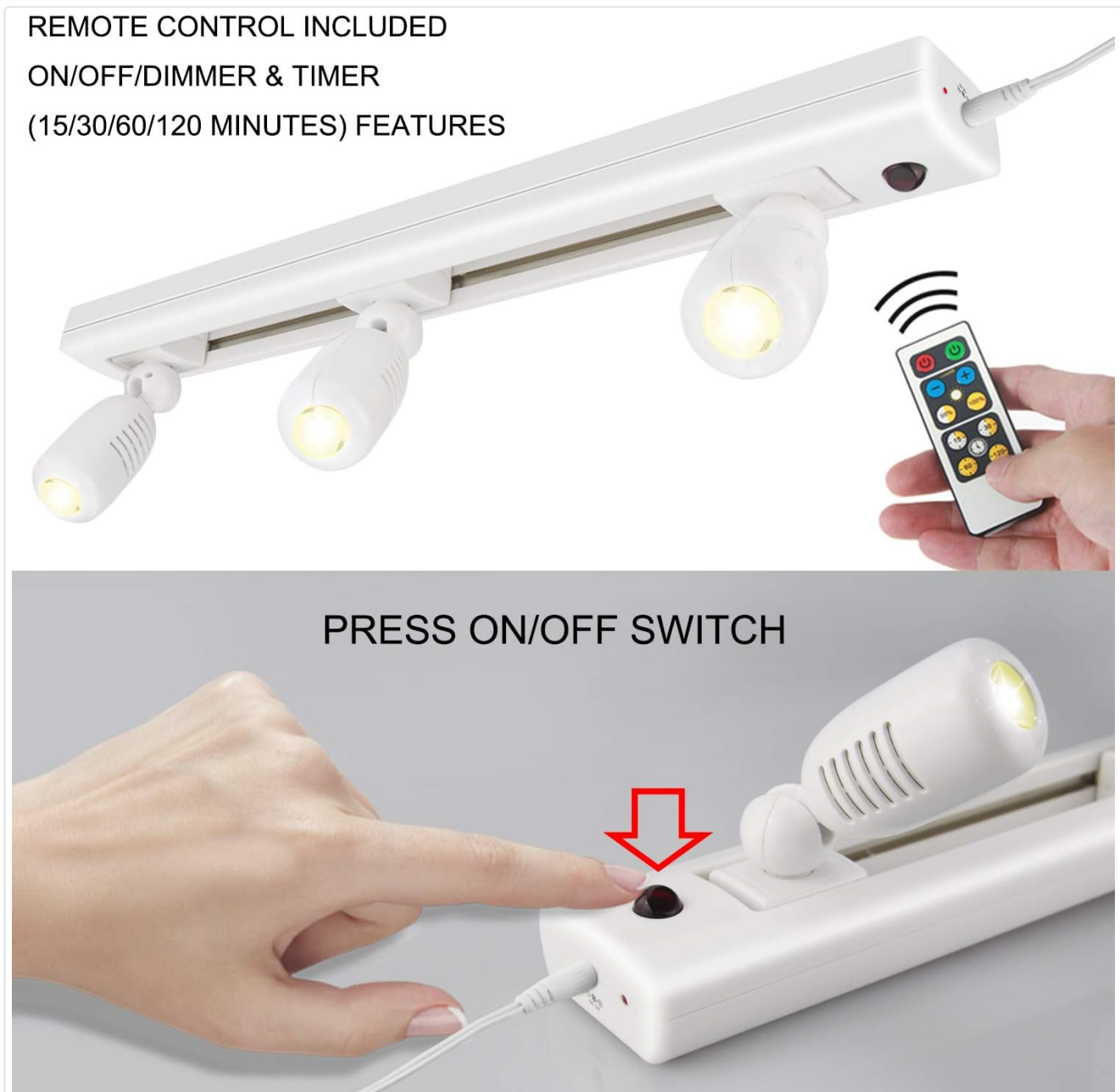
Figure 5.1: Operating the track light using the manual ON/OFF switch located on the unit. The remote control is also shown, highlighting its availability for convenient operation.