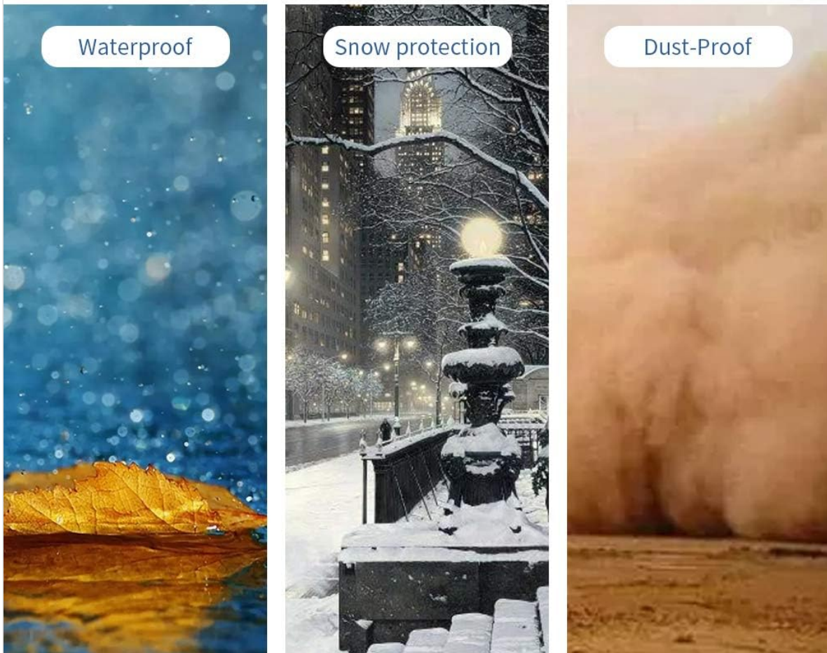
Figure 6: The INQMEGA PTZ WiFi Camera is IP66 weatherproof, providing protection against water, snow, and dust, making it suitable for various outdoor conditions.

The all-metal casing can be used indoors and outdoors, and can be effectively isolated regardless of heavy rain or dust.