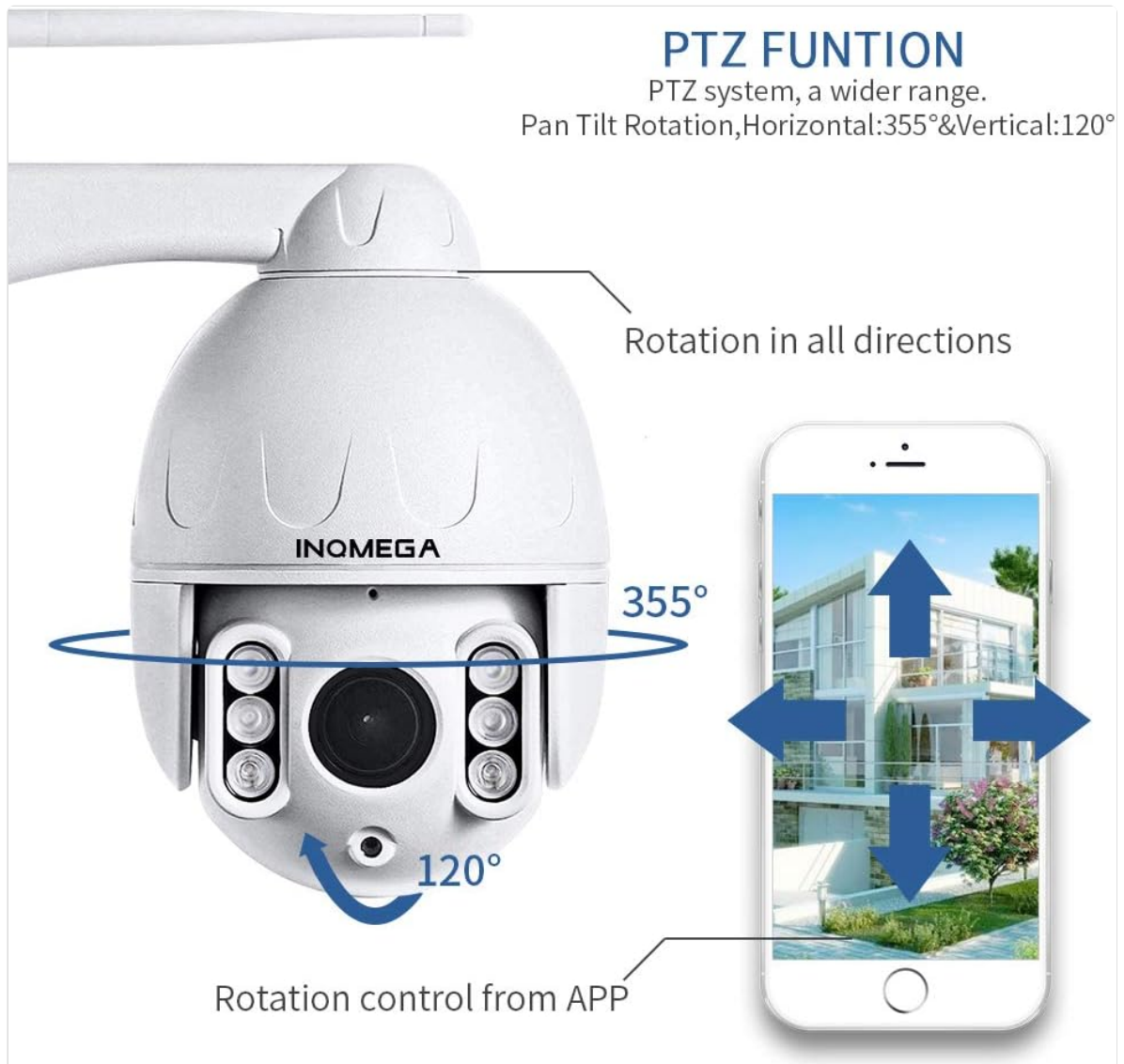
Figure 2: The INQMEGA PTZ WiFi Camera offers 355 degrees of horizontal pan and 120 degrees of vertical tilt, controllable directly from the mobile application.