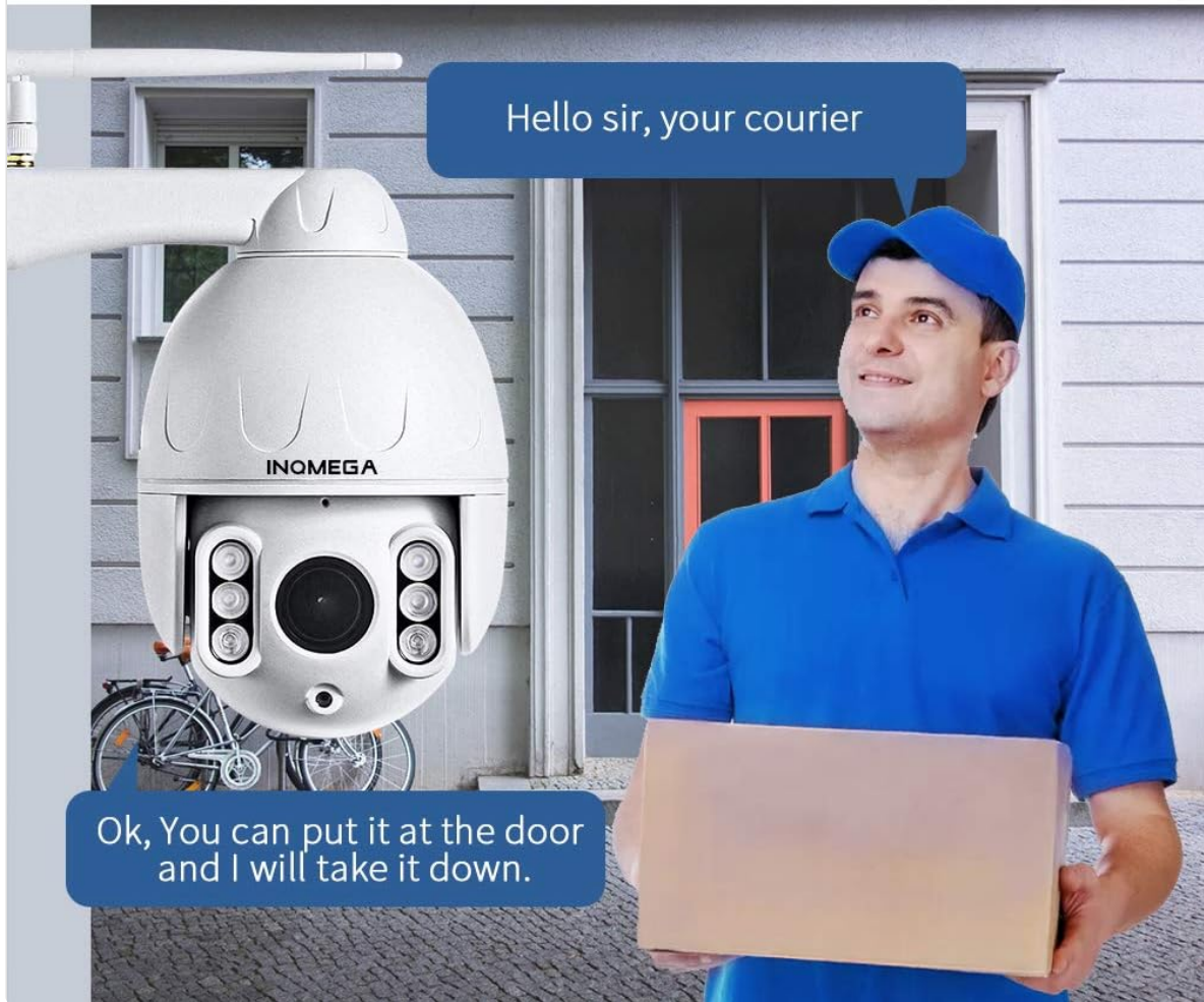
Figure 3: The camera supports two-way audio, allowing users to communicate with individuals near the camera, such as greeting guests or instructing a delivery person.

Equipped with built-in microphone and speaker, at any time. You can remotely view your pet dog, family, employee, etc. and talk to them.