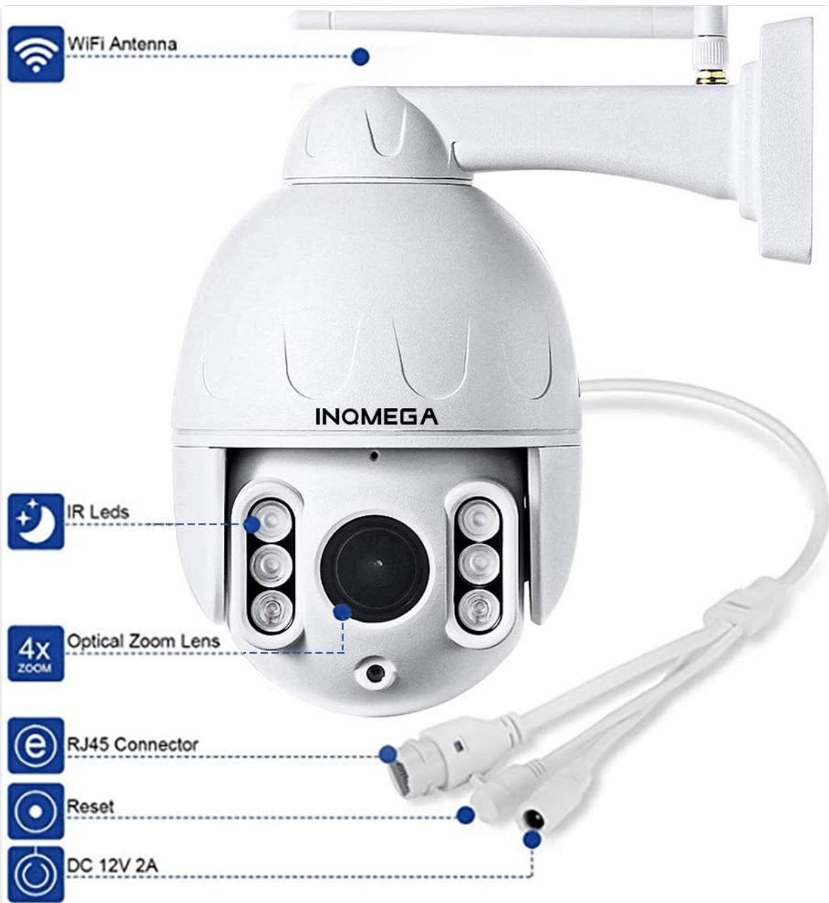
Figure 1: INQMEGA PTZ WiFi Camera with labeled components including WiFi Antenna, IR Leds, 4x Optical Zoom Lens, RJ45 Connector, Reset button, and DC 12V 2A power input.