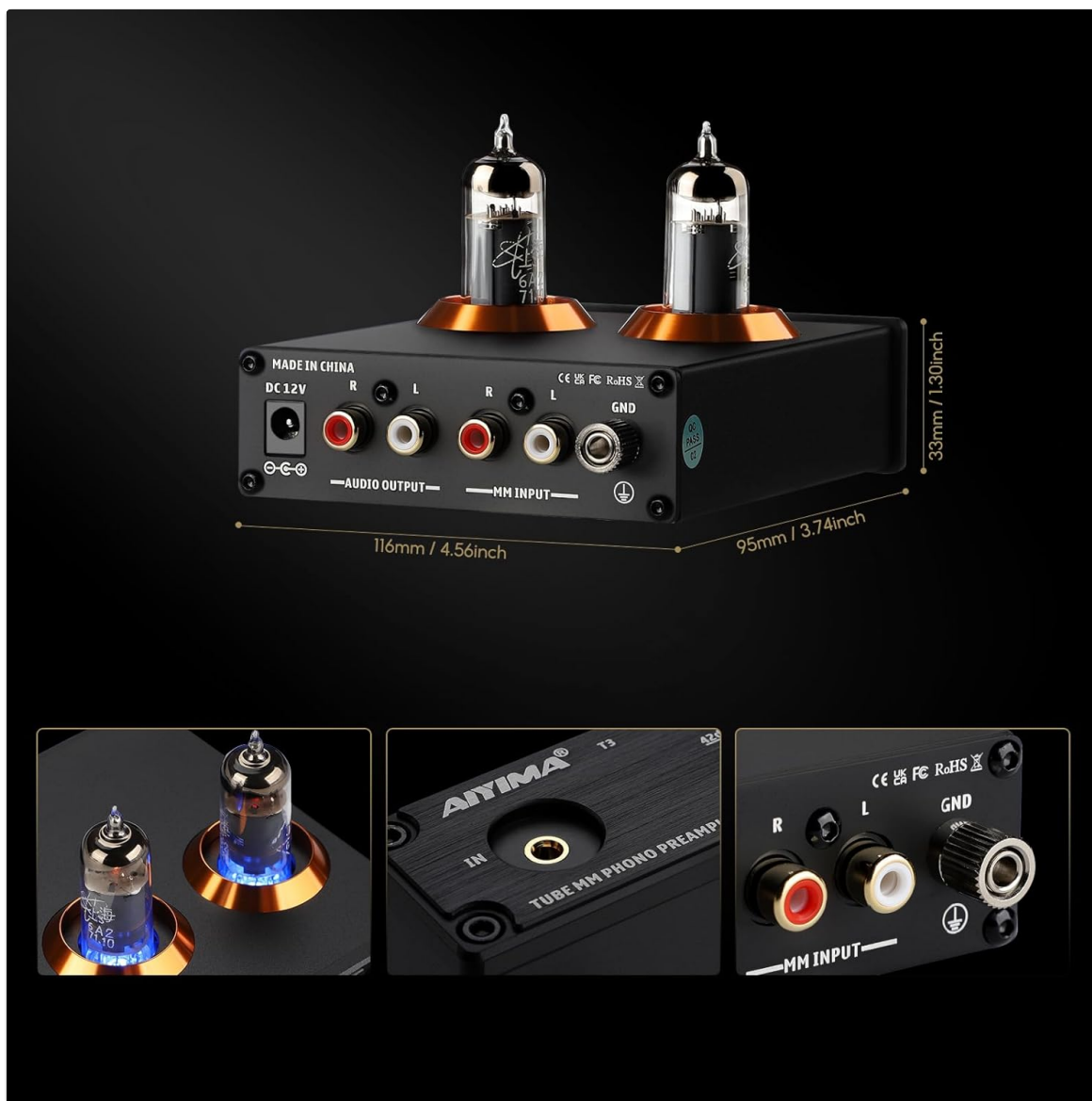
Figure 1: AIYIMA Tube T3 Preamplifier with dimensions (116mm D x 95mm W x 33mm H).