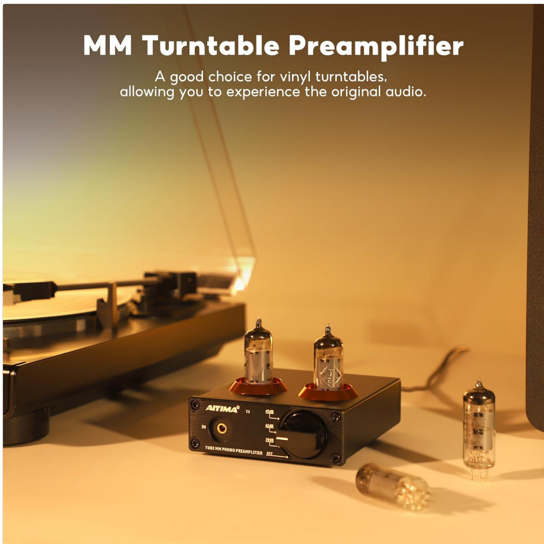
Figure 5: Front panel showing the gain adjustment switch with 39dB, 42dB, and 45dB options.

A good choice for vinyl turntables, allowing you to experience the original audio.