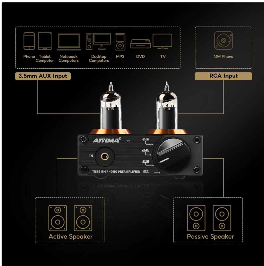
Figure 4: Diagram illustrating various input and output connections for the AIYIMA Tube T3.