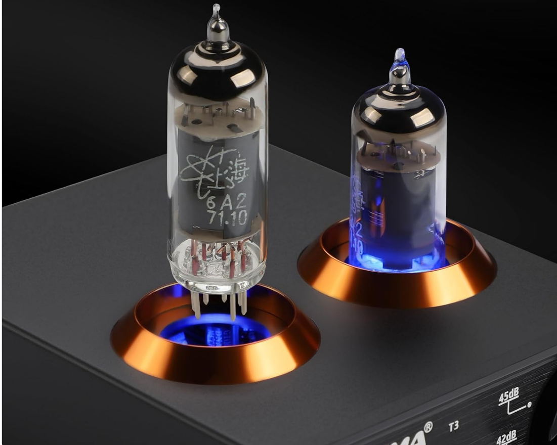
Figure 3: Gently inserting the vacuum tubes into their designated sockets on the preamplifier.

You can change the tubes to explore and enjoy the unique sound quality of different tubes.