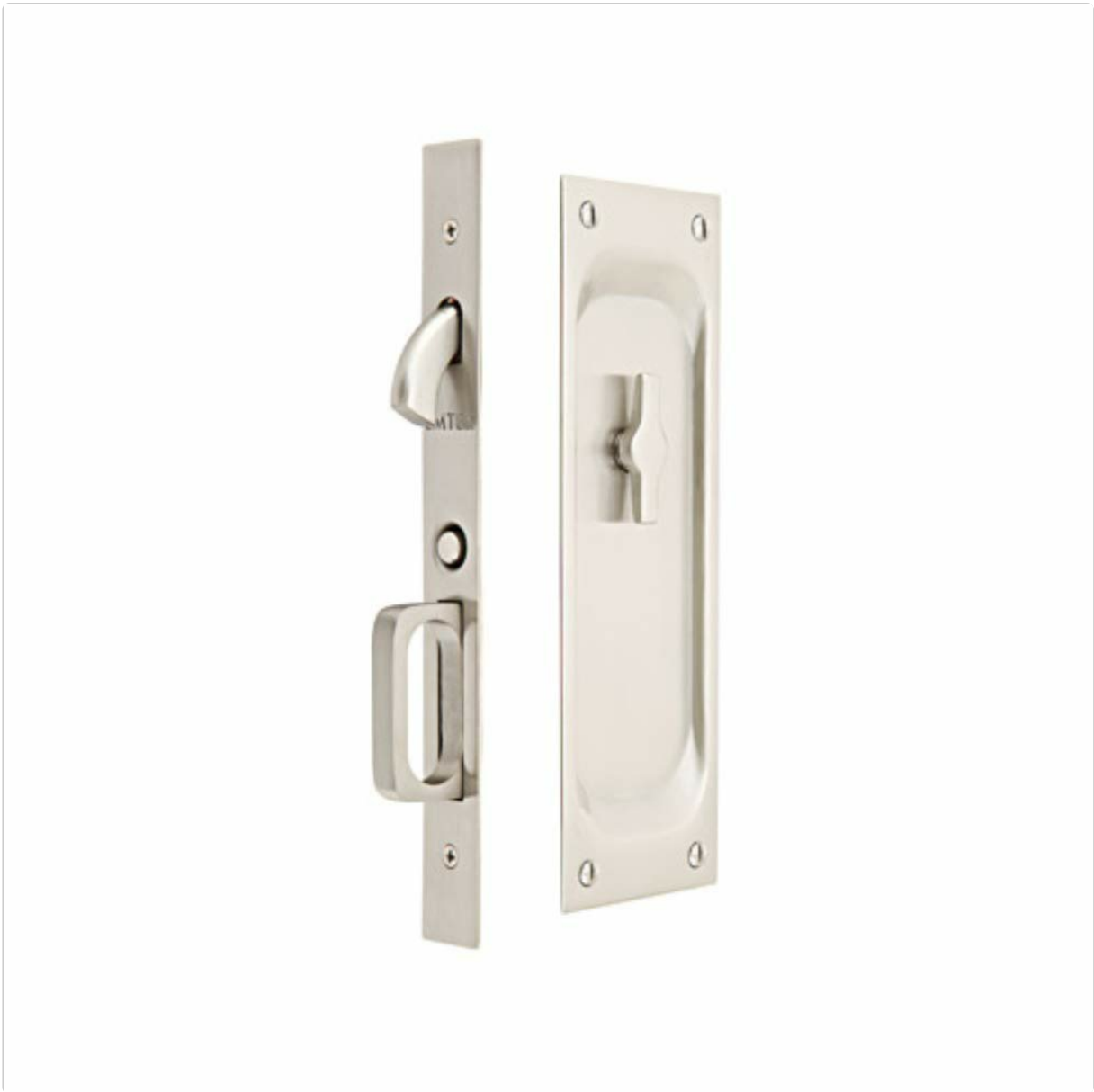
Figure 1: Emtex 2105 Solid Brass Privacy Pocket Door Mortise Lock in Satin Nickel finish.