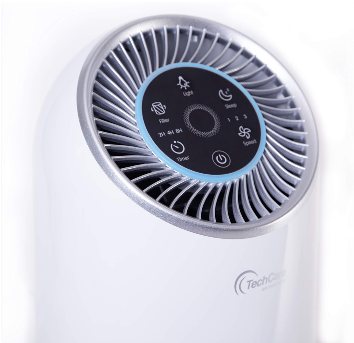
Image 3: Detailed view of the air purifier's top control panel, showing buttons for Light, Sleep Mode, Fan Speed (1, 2, 3), Timer (2H, 4H, 8H), Filter Reset, and Power.

The control panel is located on the top of the unit and features touch-sensitive buttons for various functions: