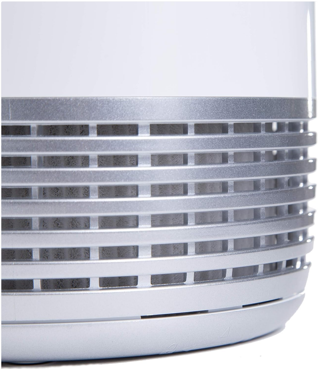
Image 5: Close-up view of the air purifier's lower section, highlighting the air intake vents and the filter compartment.