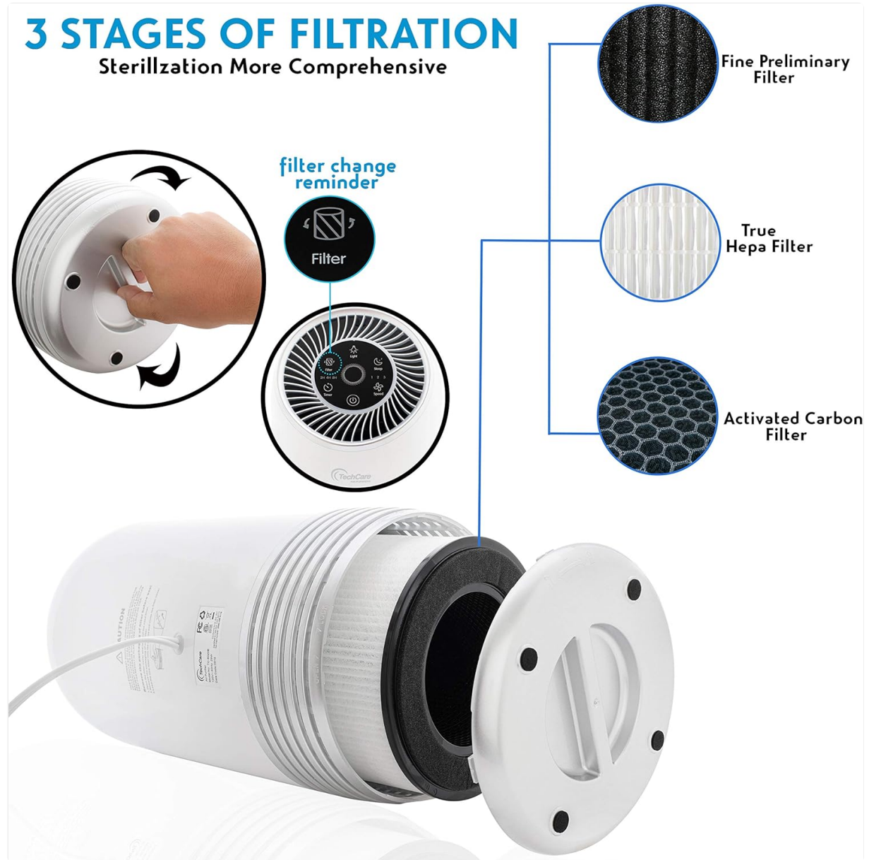
Image 4: Step-by-step diagram illustrating the process of accessing and replacing the air filter from the bottom of the TechCare Air Purifiers VT-H4. It also shows the three stages of filtration: Fine Preliminary Filter, True HEPA Filter, and Activated Carbon Filter.