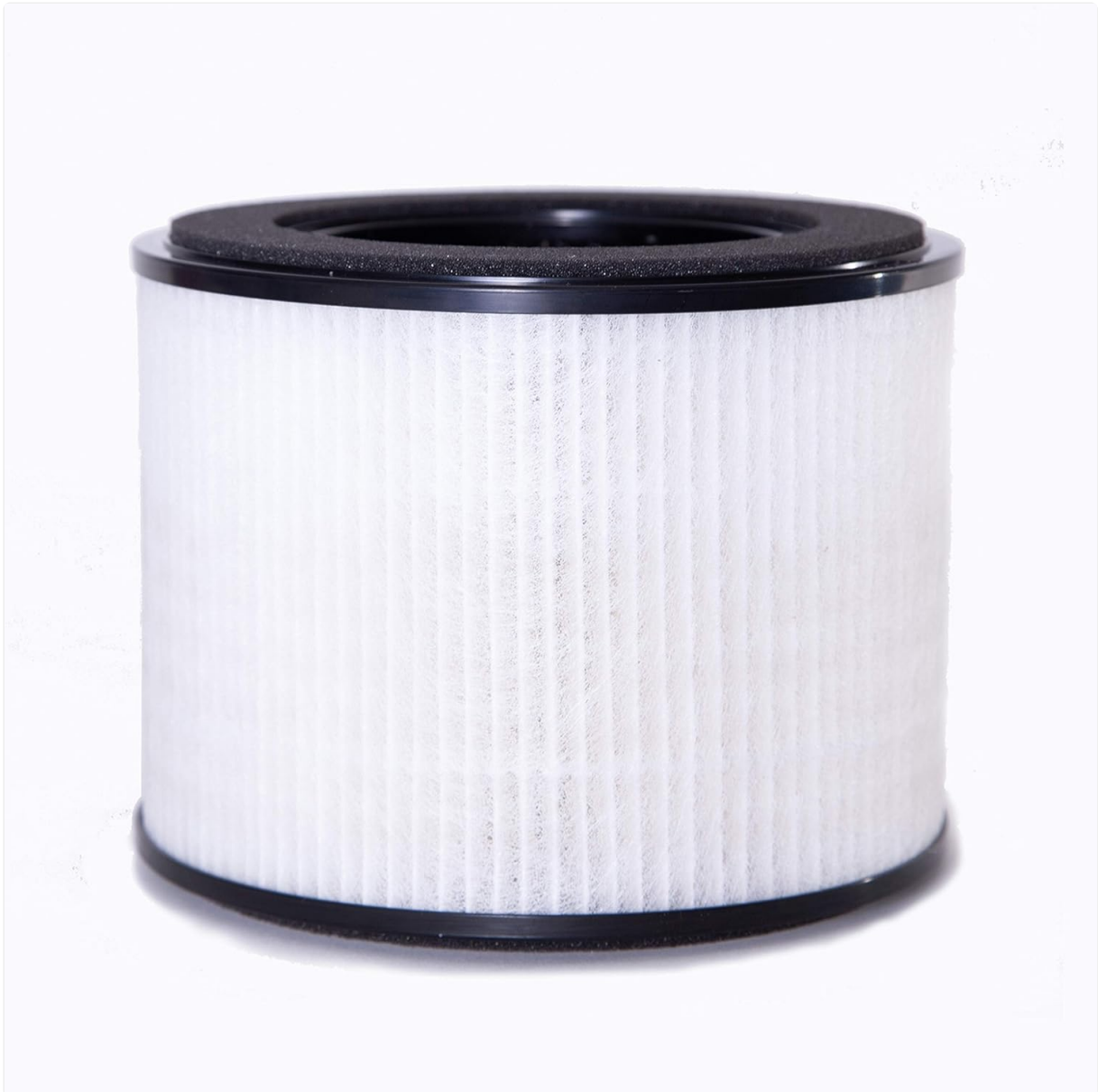
Image 7: A close-up photograph of the cylindrical composite air filter, showing its multi-layered structure.

The filter life indicator light will illuminate when it's time to replace the filter (approximately every 6-8 months, depending on usage and air quality).