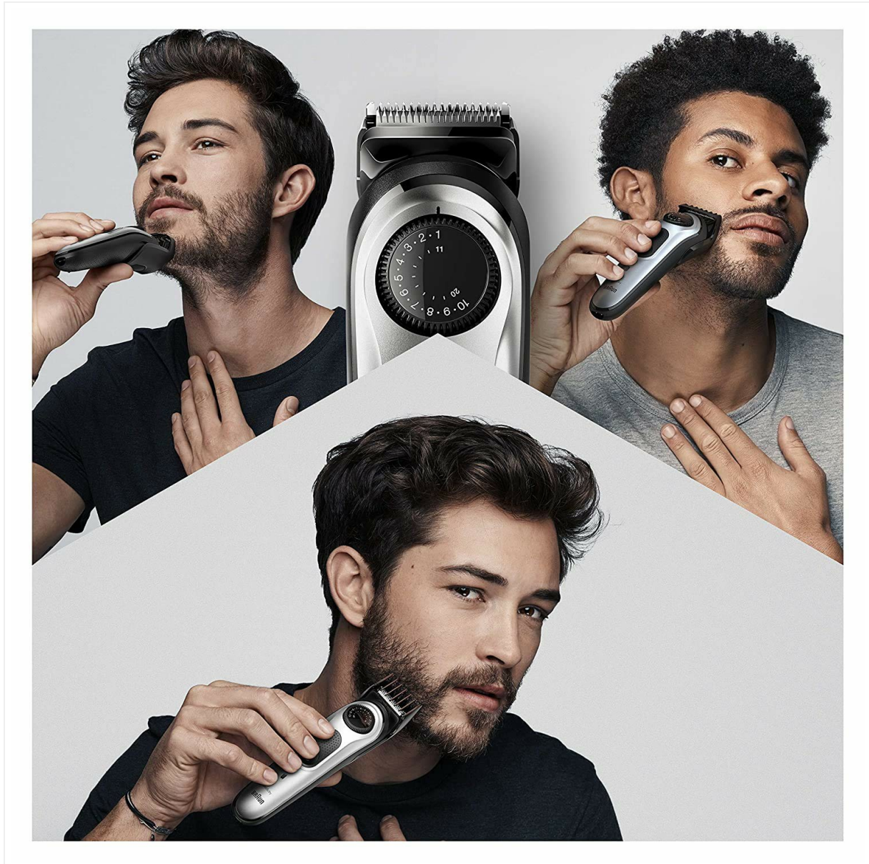
Figure 5: Individuals demonstrating the use of the Braun BT5265 trimmer for various beard styles and hair lengths.

Always ensure your skin and hair are clean and dry before trimming.