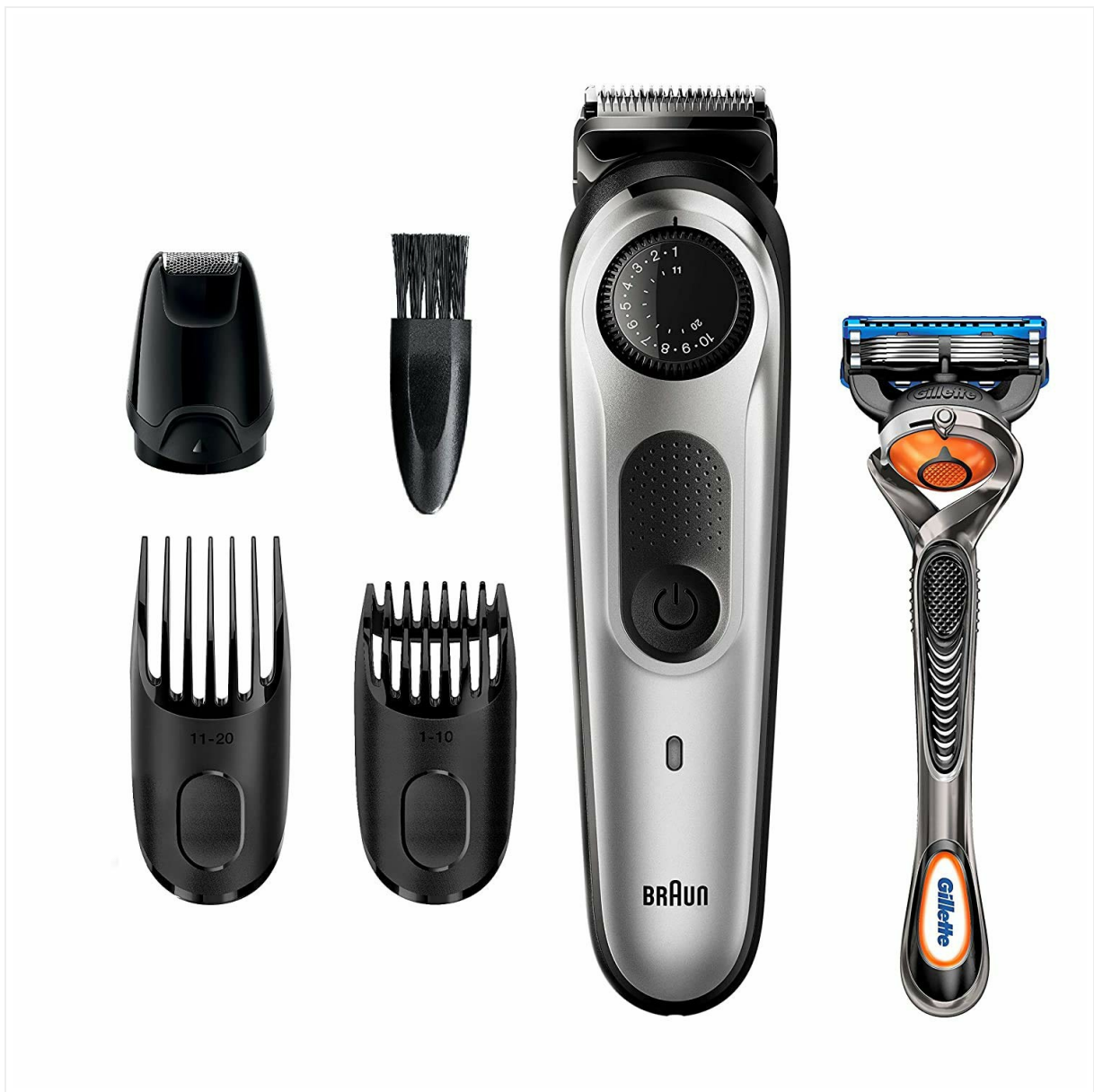
Figure 1: Braun BT5265 Beard Trimmer and included accessories: main trimmer unit, two precision combs, mini foil shaver, cleaning brush, and Gillette Fusion5 ProGlide razor.