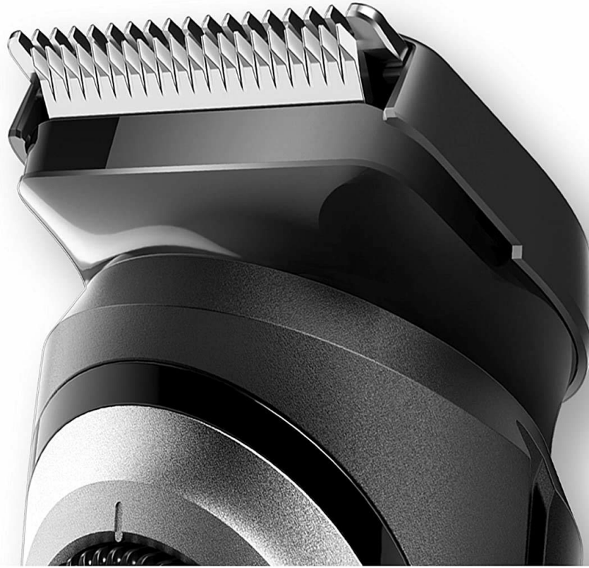
Figure 2: Close-up of the Braun BT5265 trimmer's blades, highlighting the 'Lifetime Sharp Blades' feature.