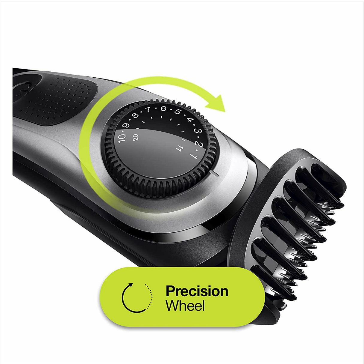
Figure 3: Close-up of the Braun BT5265 precision dial, indicating its function for adjusting trimming length.