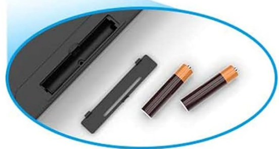
Figure 6: Smart Power Saving Mode

To install 2*AAA batteries 2*単4電池を取り付けるには