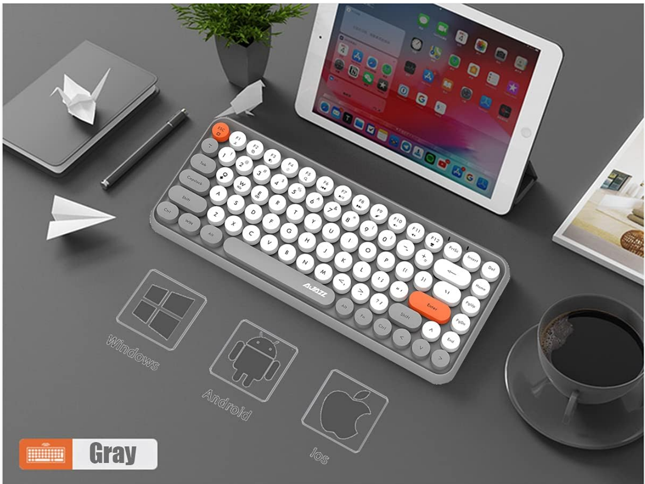
Figure 4: Multi-System Compatibility