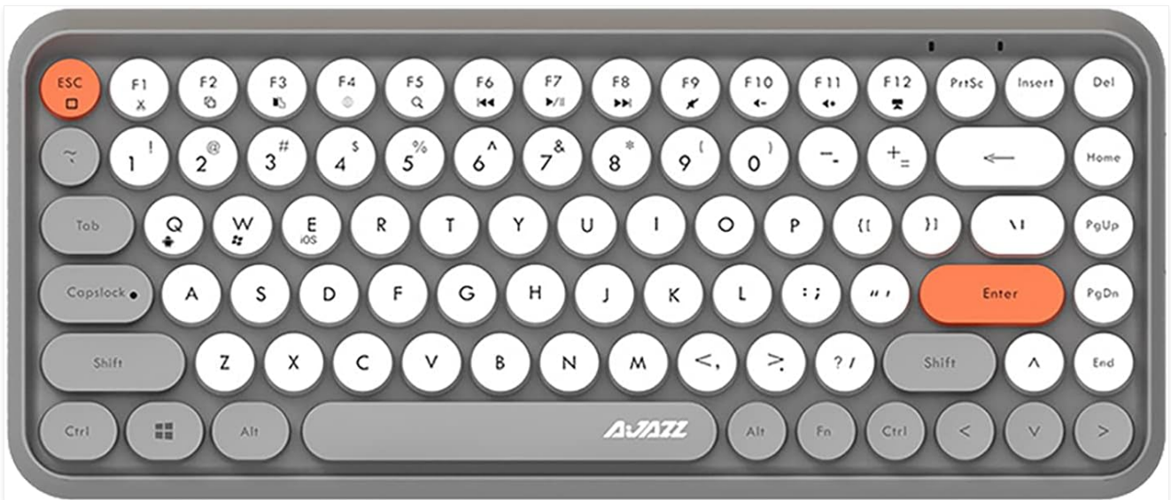
Figure 1: Ajazz 308i Bluetooth Keyboard Overview

Thank you for choosing the Ajazz 308i Bluetooth Keyboard. This manual provides detailed instructions on how to set up, operate, and maintain your keyboard. Please read this manual carefully before use to ensure optimal performance and longevity of your device.