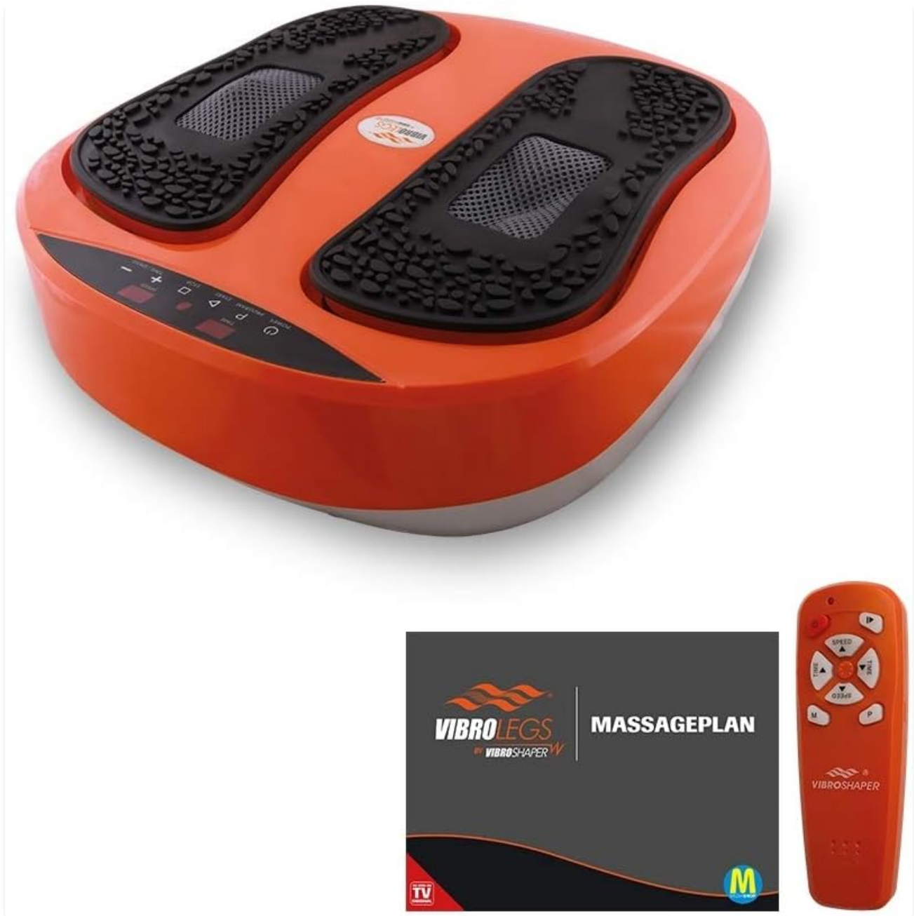
All components included in the VibroLegs package: the device, remote, and training plan.

Upon opening the packaging, you will find the main unit, the power cable, the silicone foot pads, and a remote control. Additionally, a user manual and a training plan are included. The training plan provides 10 relevant training exercises with corresponding instructions.