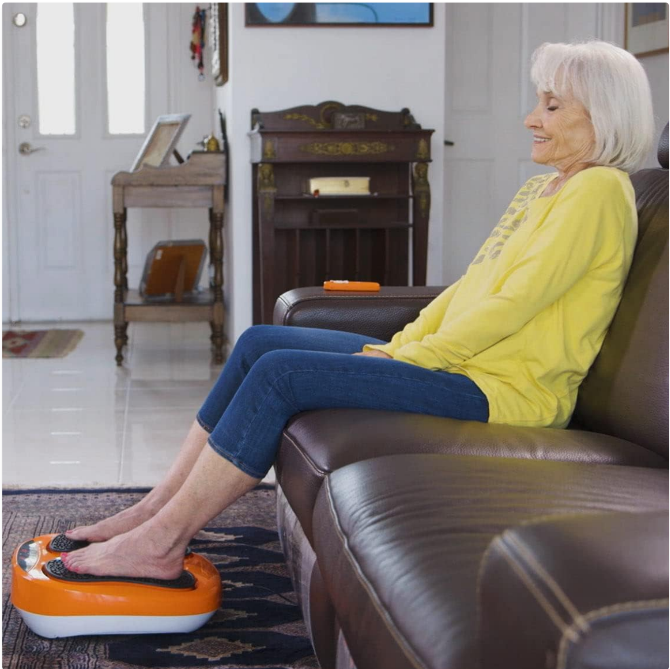
A woman relaxing on a couch, using the VibroLegs device.