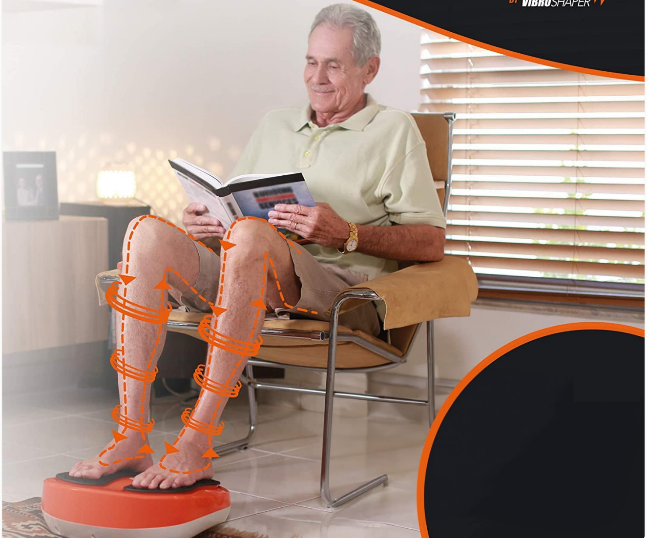
Proper positioning for leg massage, illustrating improved circulation.