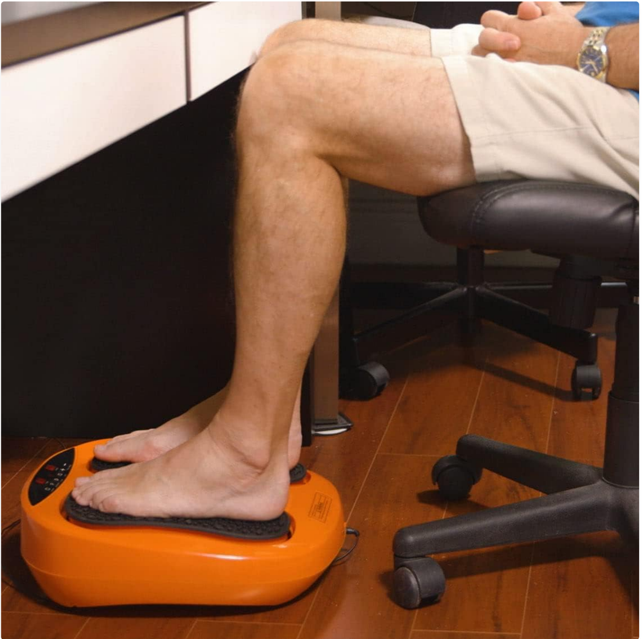
Convenient use of the VibroLegs device even while working at a desk.