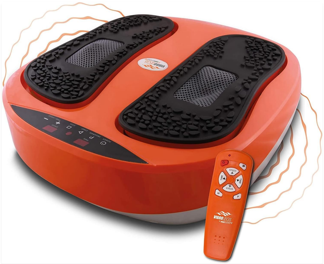
The VibroLegs device with its remote control, ready for use.