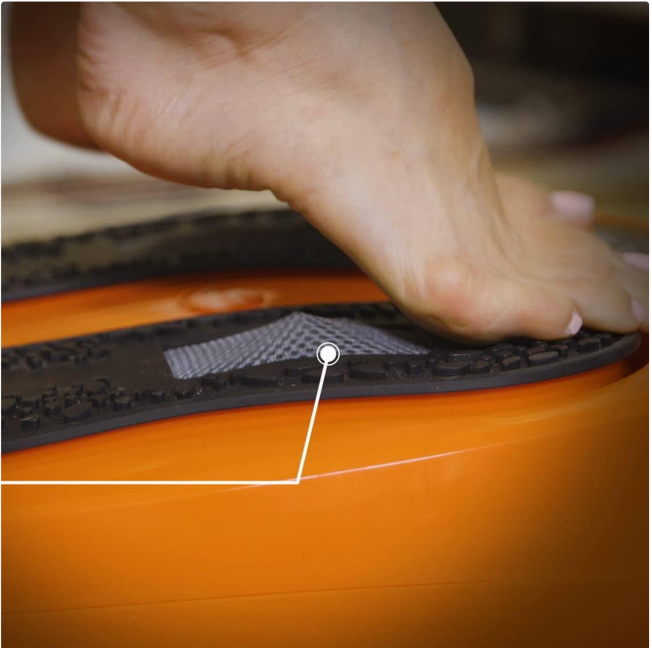
A close-up view of a foot positioned on the textured pad of the VibroLegs device.