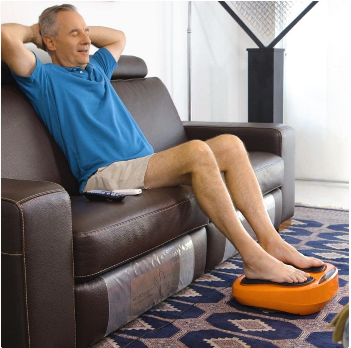
A man relaxing on a couch, enjoying the VibroLegs massager.