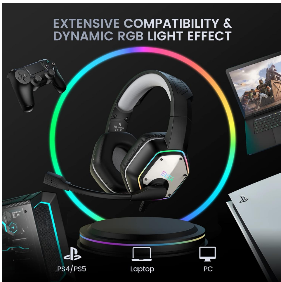
Figure 2: Powerful 50mm drivers for clear audio performance.