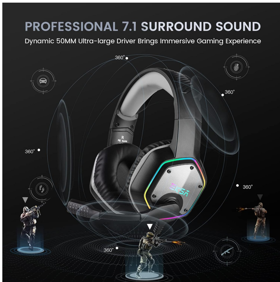
Figure 5: Dynamic RGB lighting and broad compatibility.