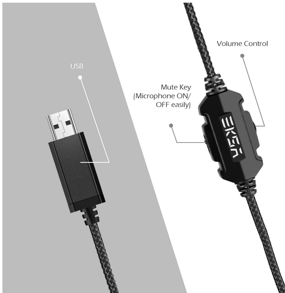
Figure 6: USB connector and inline controls for easy access.

If you experience issues with sound or microphone functionality, please check your system settings: