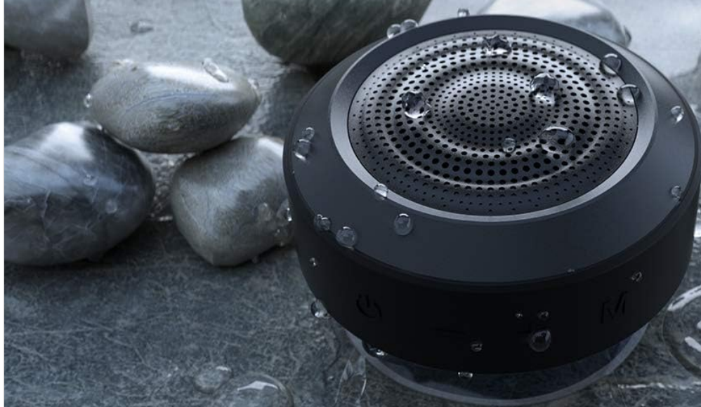
Figure 8: The MIFA A4 speaker demonstrating its IPX7 waterproof rating in an outdoor setting.