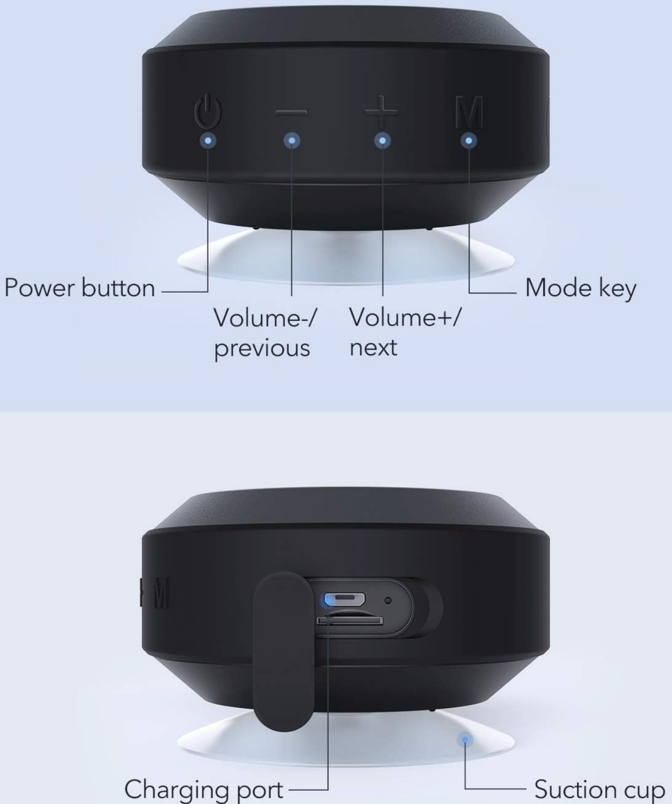
Figure 3: Top and side view of the MIFA A4 speaker, indicating the Power button, Volume-/Previous, Volume+/Next, Mode key, Charging