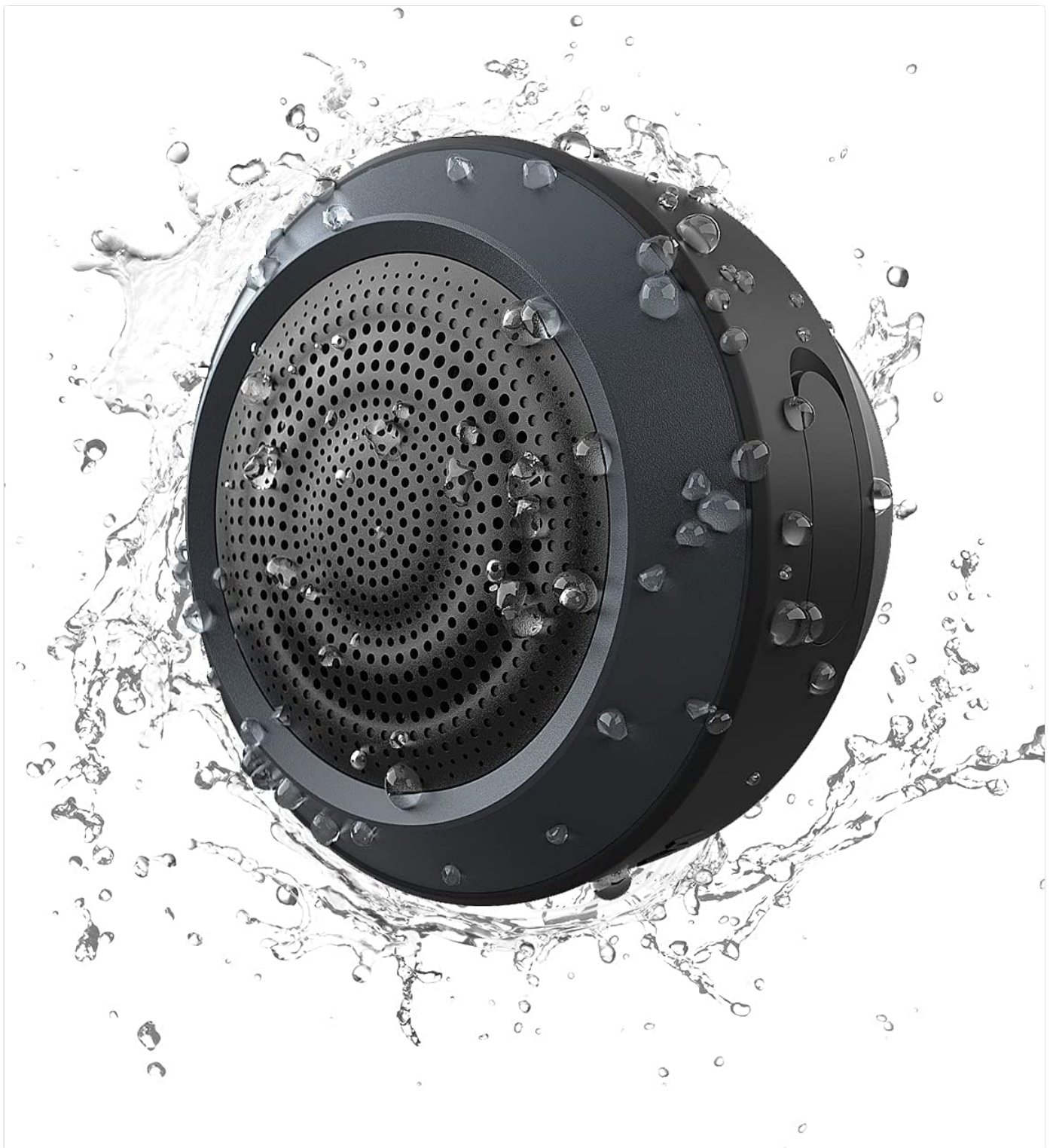
Figure 1: MIFA A4 Bluetooth Shower Speaker, showcasing its waterproof design with water splashing around it.