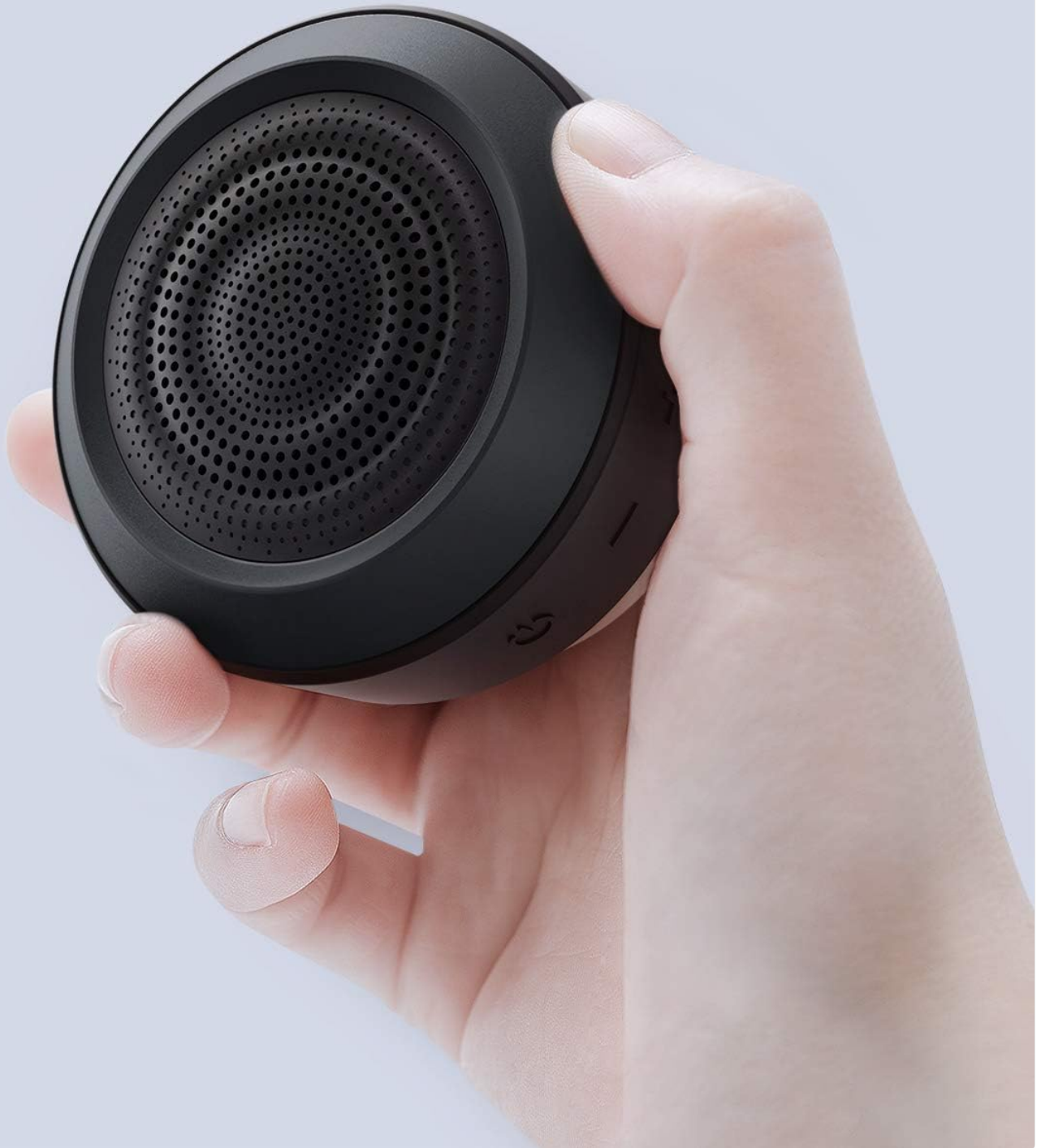
Figure 9: The MIFA A4 speaker held in a hand, illustrating its compact dimensions (87mm x 87mm x 53.8mm).

87mm (3.4 in) * 87mm (3.4 in) * 53.8mm (2.1in)