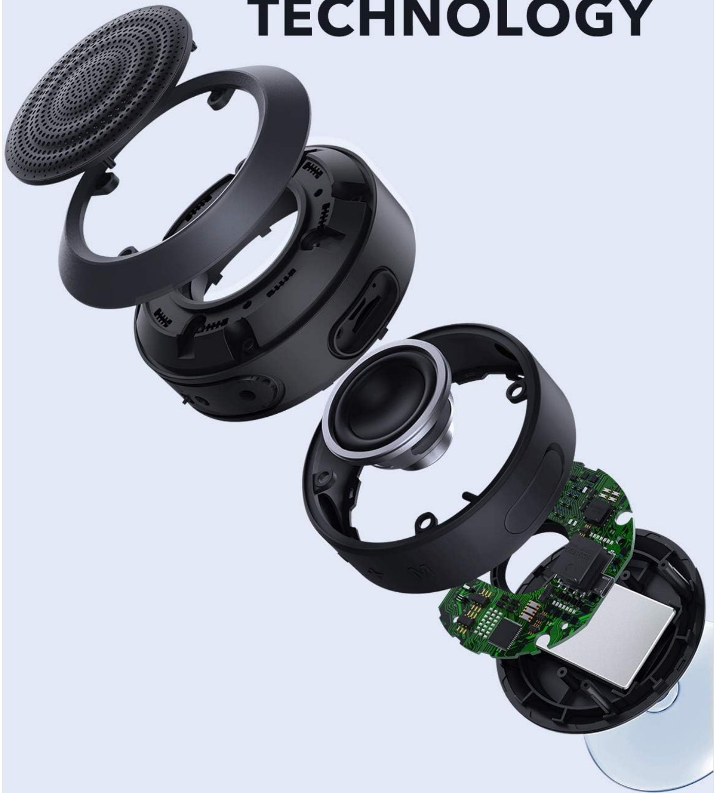
Figure 2: Internal components of the MIFA A4 speaker, highlighting its built-in BassUp technology for enhanced bass.