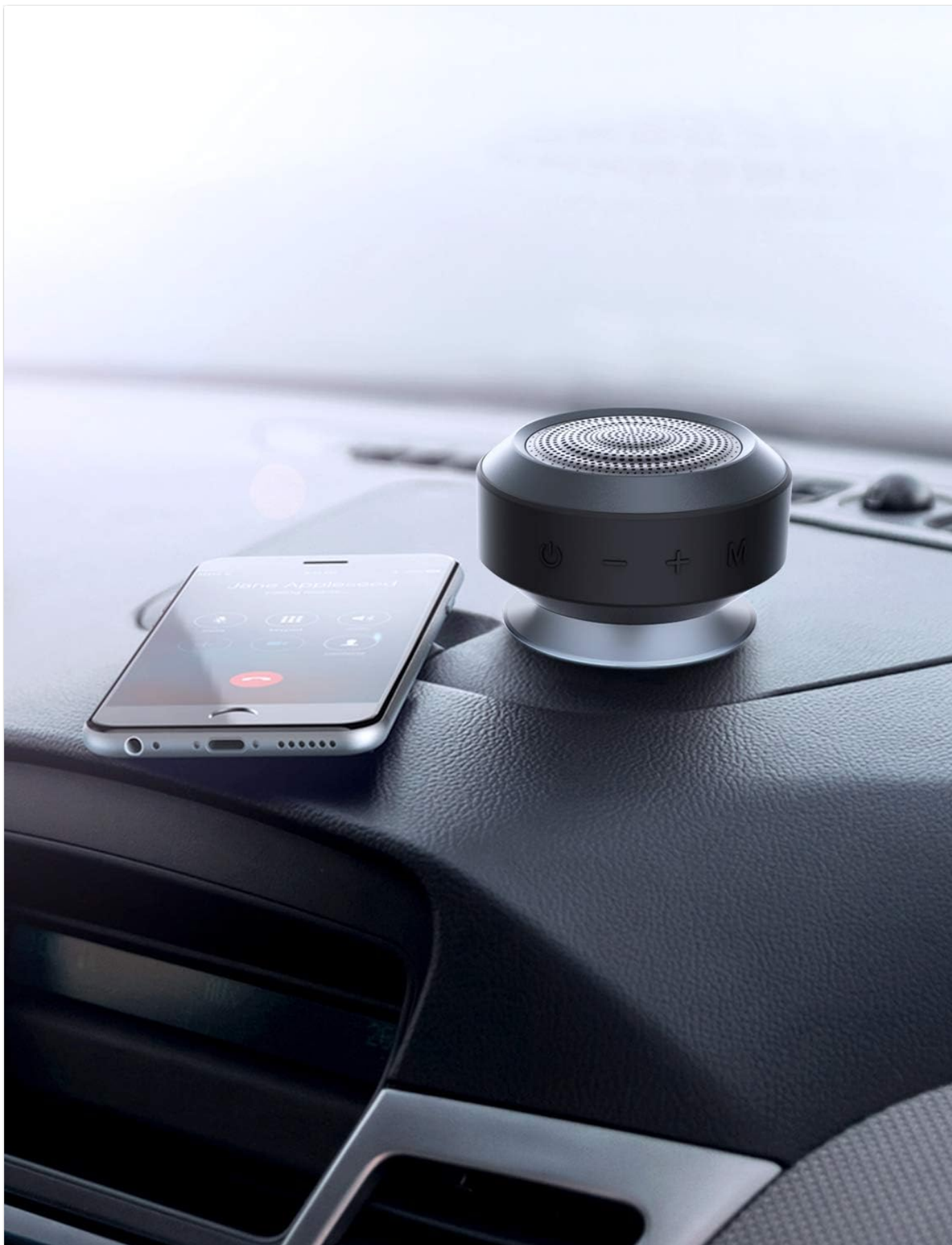
Figure 7: The MIFA A4 speaker in use for hands-free calling, placed on a car dashboard.