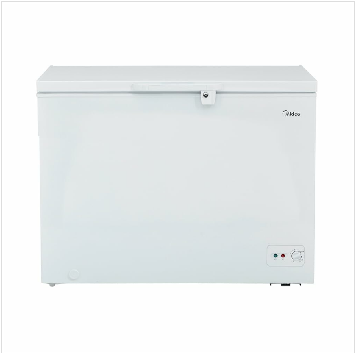
Image 1.1: Front view of the Midea MFC11P2NBBW 11 Cu. Ft. Chest Freezer.