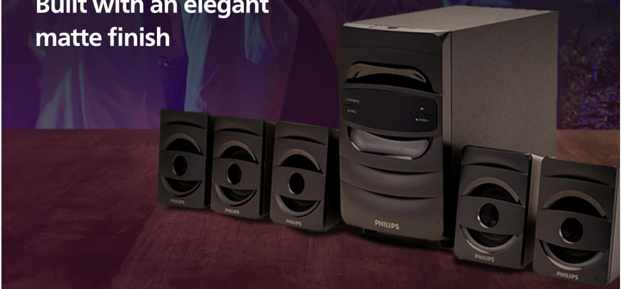
Image 8.1: The PHILIPS SPA5128B system, showcasing its robust design and elegant matte finish.