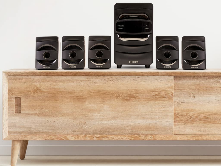
Image 3.1: Overview of the PHILIPS SPA5128B system highlighting key technical specifications such as 5.1 CH, 40W output, Bluetooth, USB, Audio In, and FM tuner.