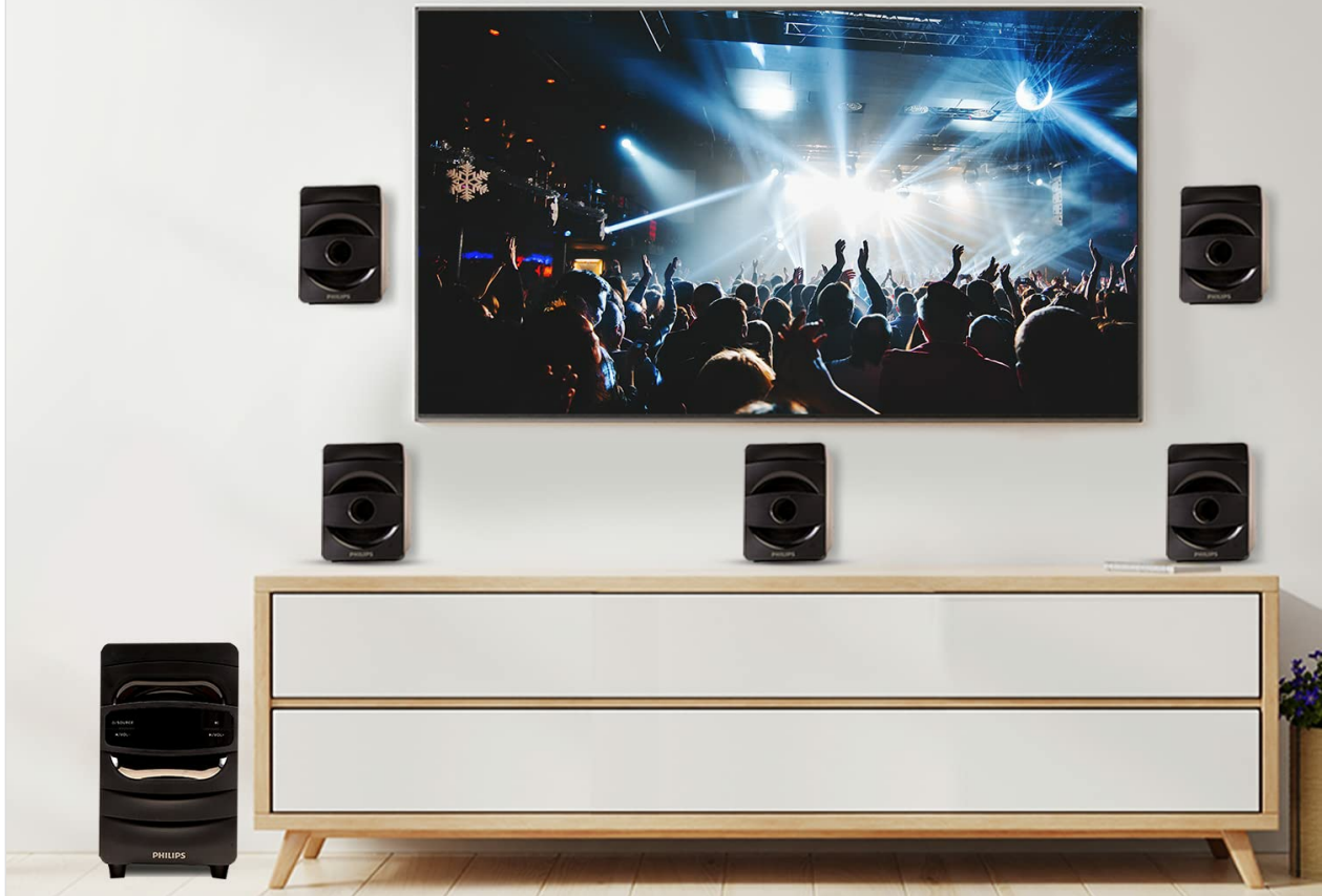
Image 4.1: An example setup showing the PHILIPS SPA5128B 5.1 CH Multimedia Speaker System arranged around a television for an immersive audio experience.

With Philips SPA5128B 5.1 CH Multimedia Speaker