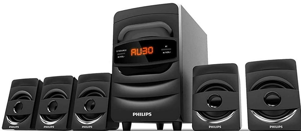
Image 1.1: The PHILIPS SPA5128B 5.1 CH Multimedia Speaker System, featuring the central subwoofer and five satellite speakers.