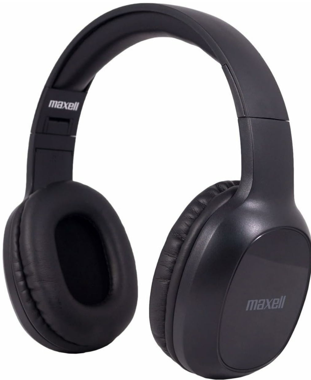
Figure 1: Maxell Bass 13 Wireless Headphones