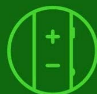
Image: A close-up view of the right earcup, highlighting the game/chat balance wheel and the retractable microphone.