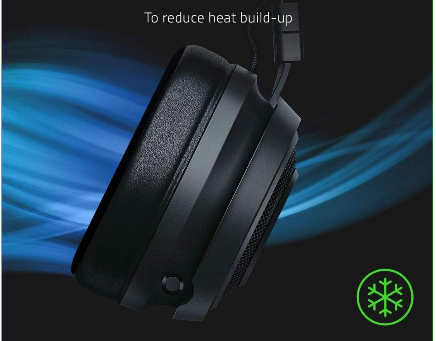
Image: A close-up of the Razer Nari Ultimate's earcup, highlighting the cooling gel-infused oval ear cushions.