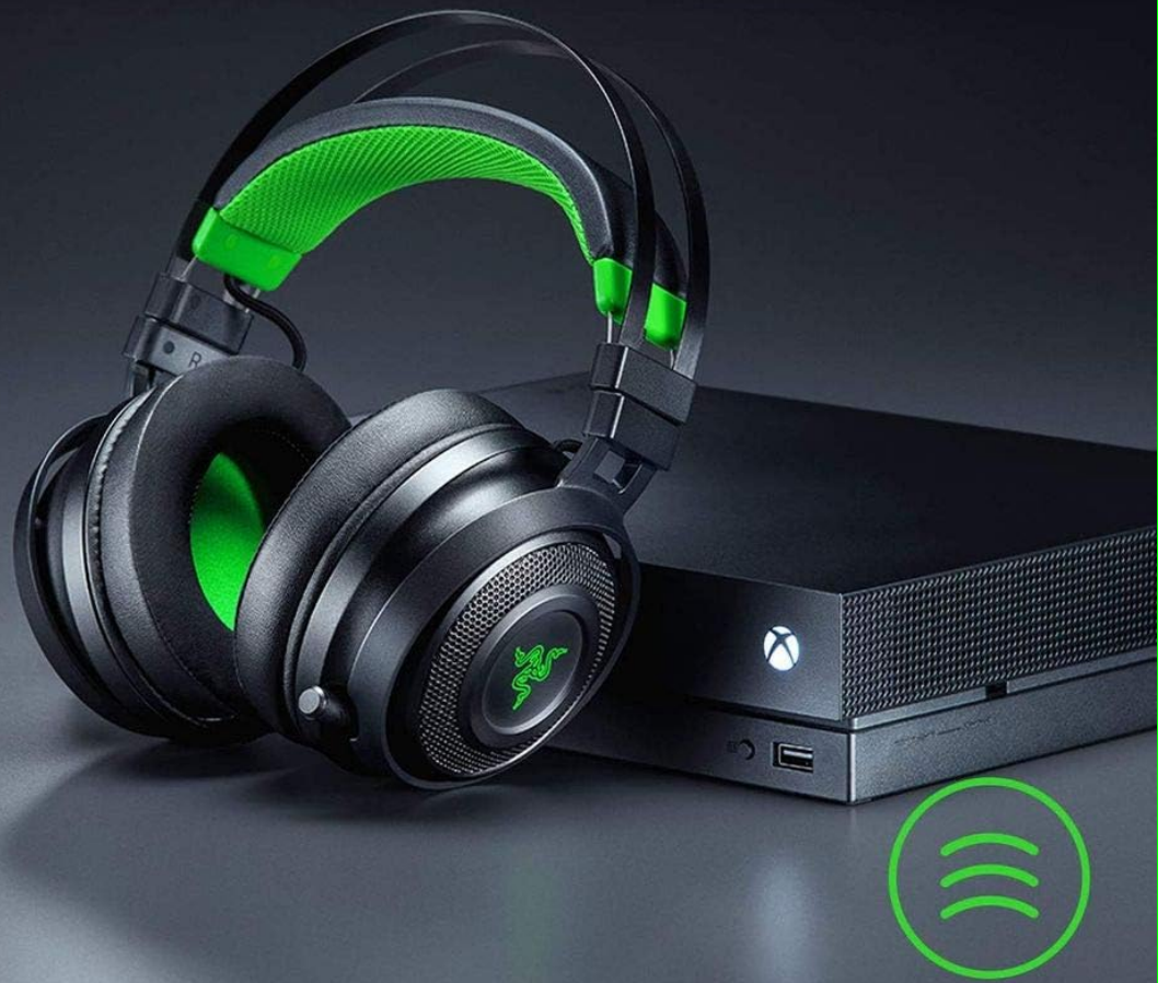
Image: The Razer Nari Ultimate headset positioned next to an Xbox One console, illustrating direct wireless connectivity.

DIRECT XBOX ONE WIRELESS CONNECTIVITY For a dongle-free high-speed connection