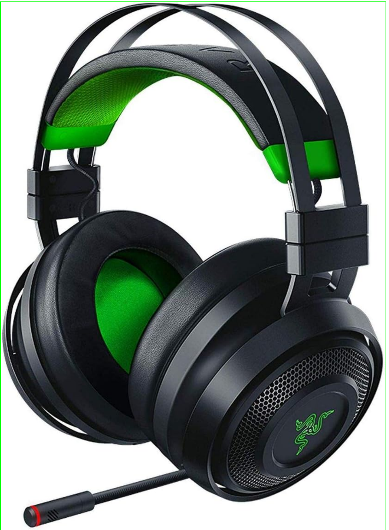
Image: The Razer Nari Ultimate Wireless Gaming Headset, showcasing its black and green design with a retractable microphone.