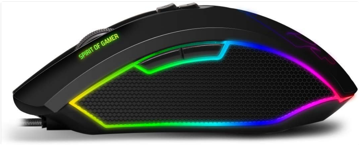
Image: Side view of the SPIRIT OF GAMER ELITE-M40 gaming mouse, showing the contoured shape, textured grip, and additional side buttons.