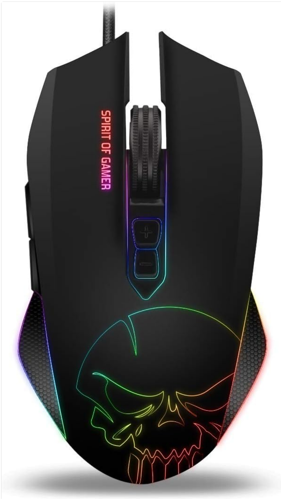
Image: Front view of the SPIRIT OF GAMER ELITE-M40 gaming mouse, highlighting the main left and right click buttons, scroll wheel, and DPI adjustment buttons.