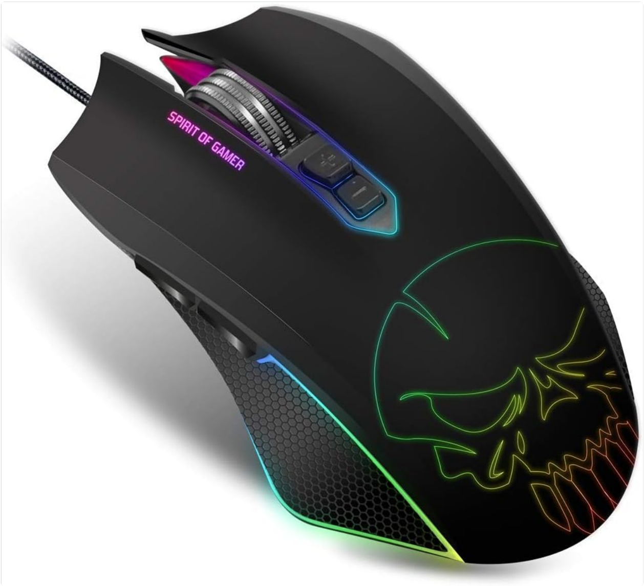
Image: Top-down view of the SPIRIT OF GAMER ELITE-M40 gaming mouse, showcasing its ergonomic design, scroll wheel, DPI buttons, and vibrant RGB lighting effects.