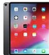
iPad Pro 2018