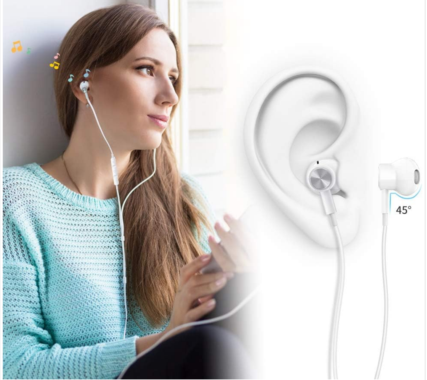
Figure 4: Proper earbud placement for a comfortable and secure fit.

Ultra-soft In-Ear Headphones bring you clearer sound