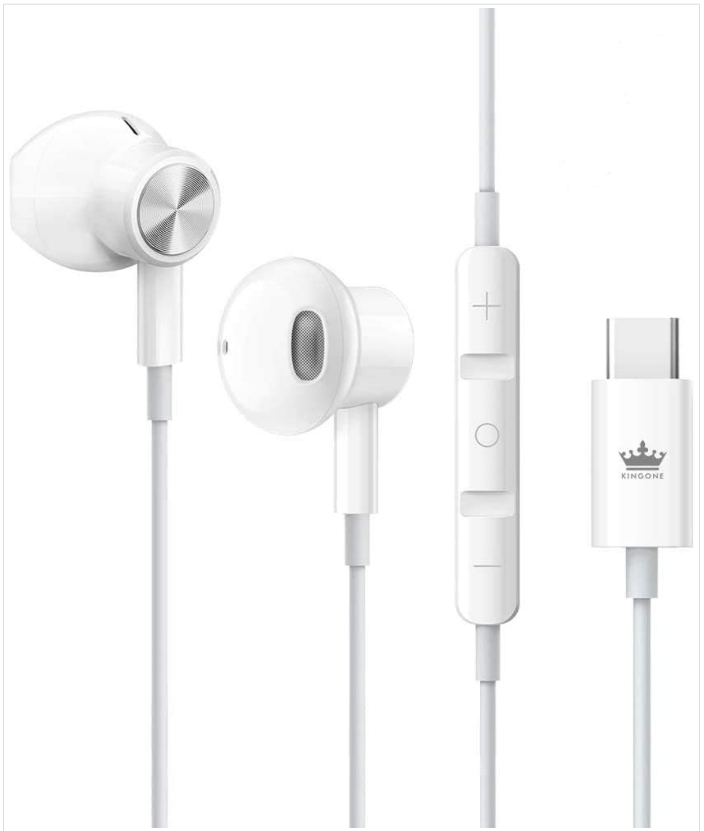
Figure 1: Overview of KINGONE USB C Headphones.