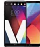
LG V20 LG G6