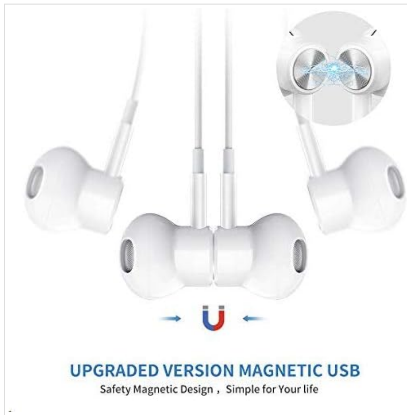
Figure 3: Magnetic design of the earbuds for easy and tangle-free storage.