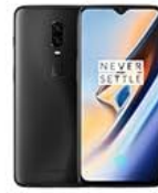
One Plus 6T