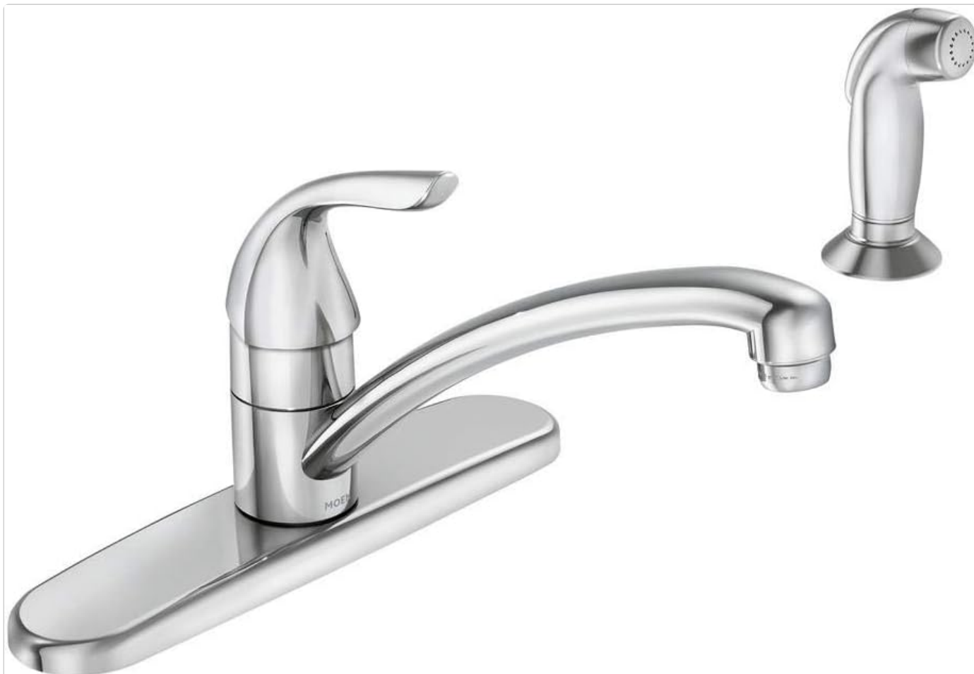
Figure 1: MOEN Adler Single-Handle Low Arc Standard Kitchen Faucet with Side Sprayer. This image displays the main faucet unit with a

This manual provides detailed instructions for the installation, operation, maintenance, and troubleshooting of your MOEN Adler Single-Handle Low Arc Standard Kitchen Faucet with Side Sprayer. Please read this manual thoroughly before installation and use to ensure proper function and longevity of the product.