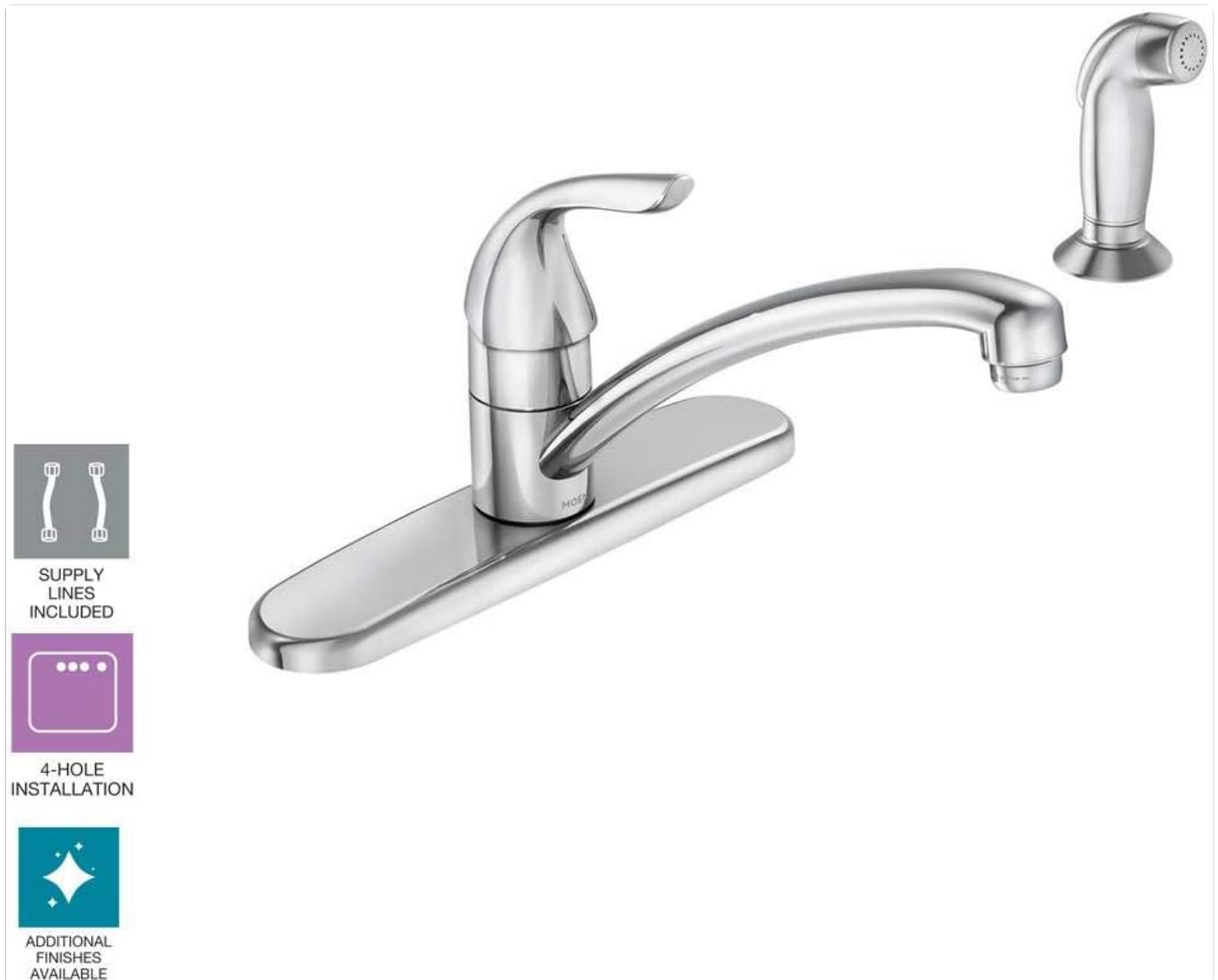
Figure 3: This image highlights key installation features of the MOEN Adler faucet, including the pre-installed supply lines and the requirement for a 4-hole installation.