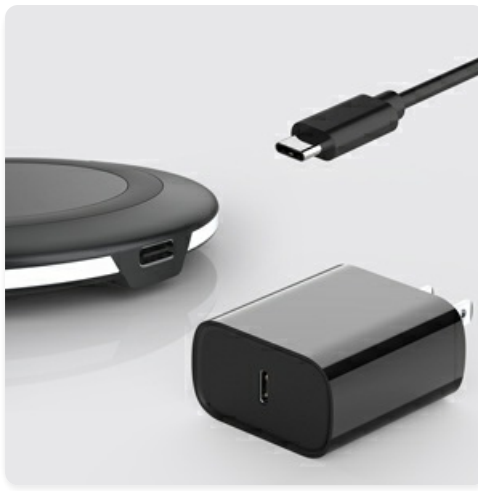
Image: Close-up of the yotech wireless charging pad, USB-C cable, and 20W USB-C adapter, illustrating the connection points.