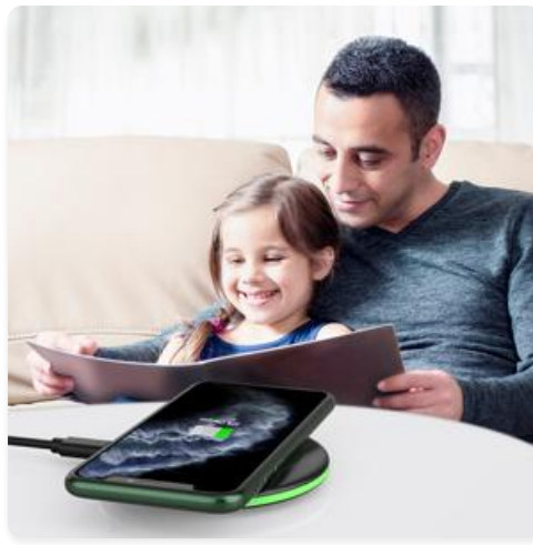
Image: A close-up of the yootech wireless charging pad with a green LED ring illuminated, indicating active charging.