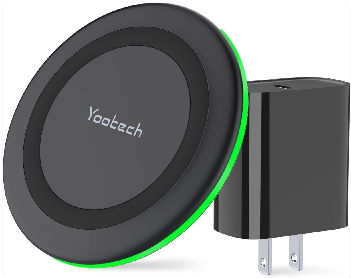
Image: The yootech wireless charging pad, a circular black device with a green LED ring, shown next to a black 20W USB-C wall adapter.