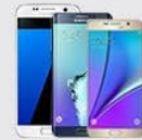
S7/S7 edge/ S6 edge plus/Note5