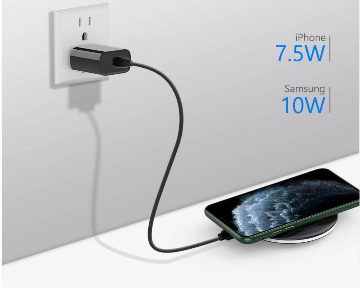
Image: An iPhone placed on the yotech wireless charging pad, showing the phone's screen indicating charging status and the pad's green LED ring illuminated.

For best results, Use the YOOTECH original charging adapter