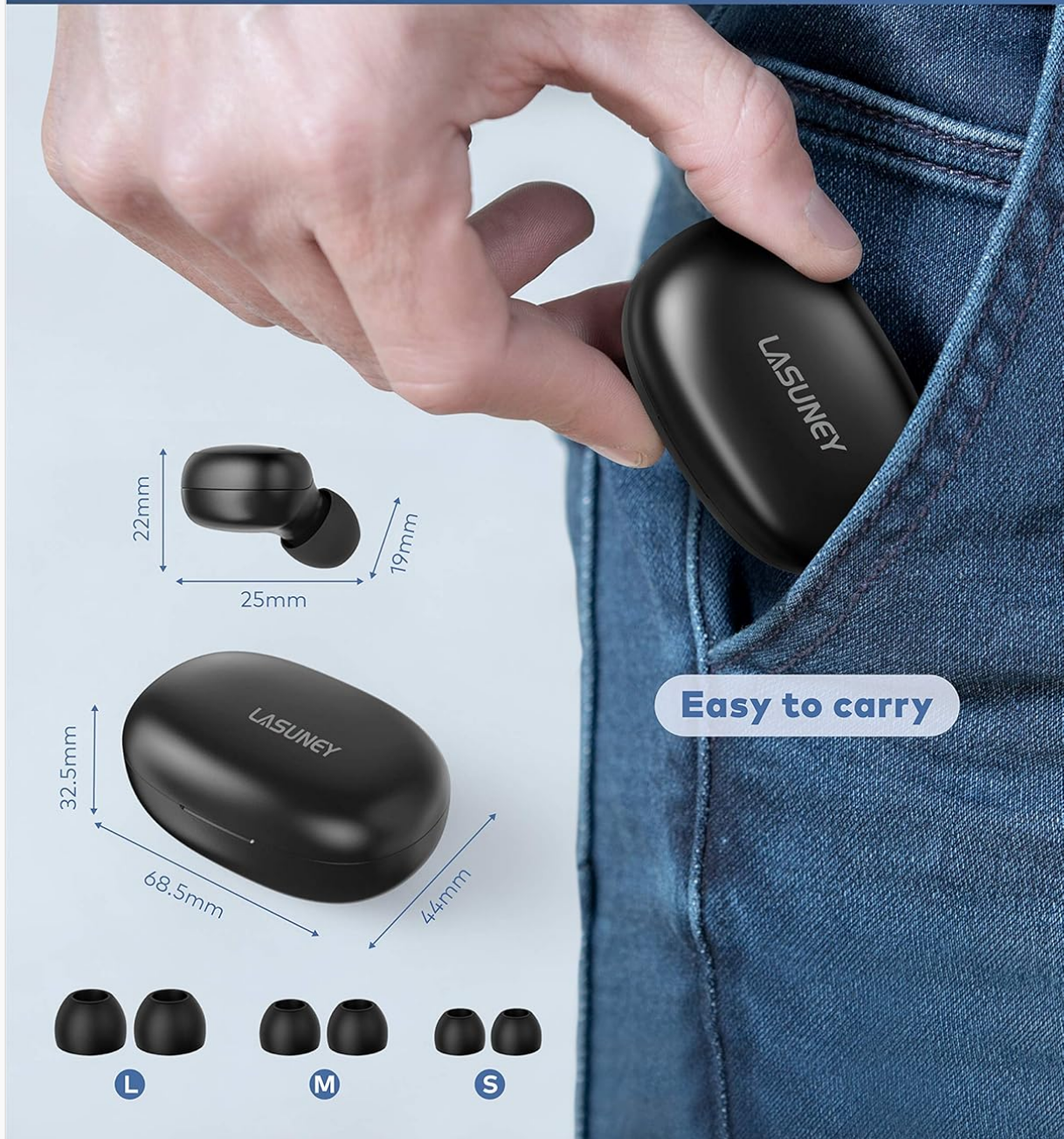
Figure 5: Compact and Portable Design. This image highlights the small size of the earbuds and charging case, making them convenient for carrying in a pocket, along with interchangeable ear tip sizes.