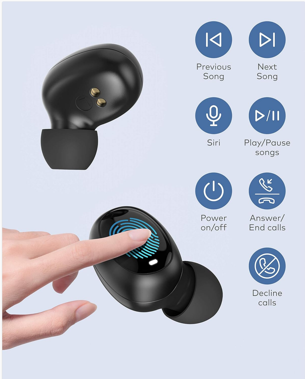
Figure 2: Earbud Touch Control Overview. This image visually represents the various touch-sensitive controls available on the earbuds for managing music playback and calls.