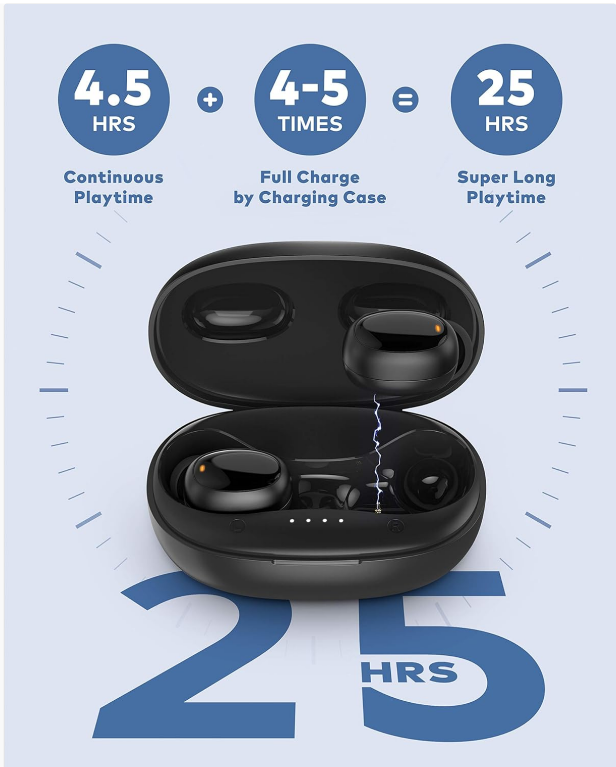
Figure 6: Extended Battery Life. This infographic details the impressive battery performance of the earbuds and their charging case, offering up to 25 hours of total listening time.

Important Note: If the charging case battery is depleted, the earbuds will not automatically turn off when placed inside. In this situation, long-press the Touch Control Area on each earbud for 10 seconds to manually power them off.