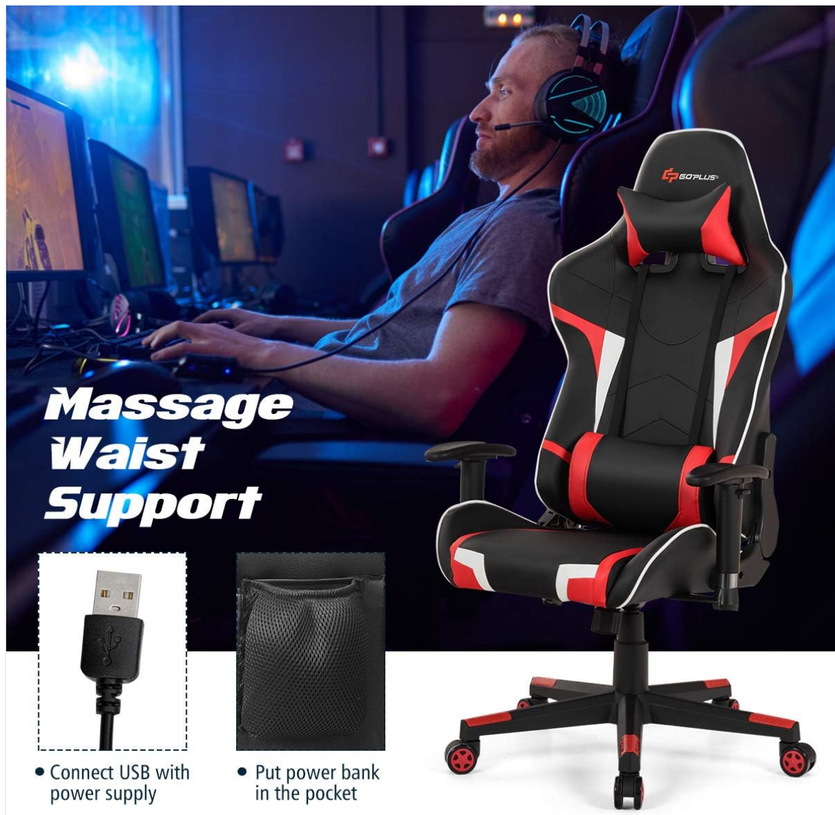
Figure 1: Goplus Gaming Massage Office Chair (Red)