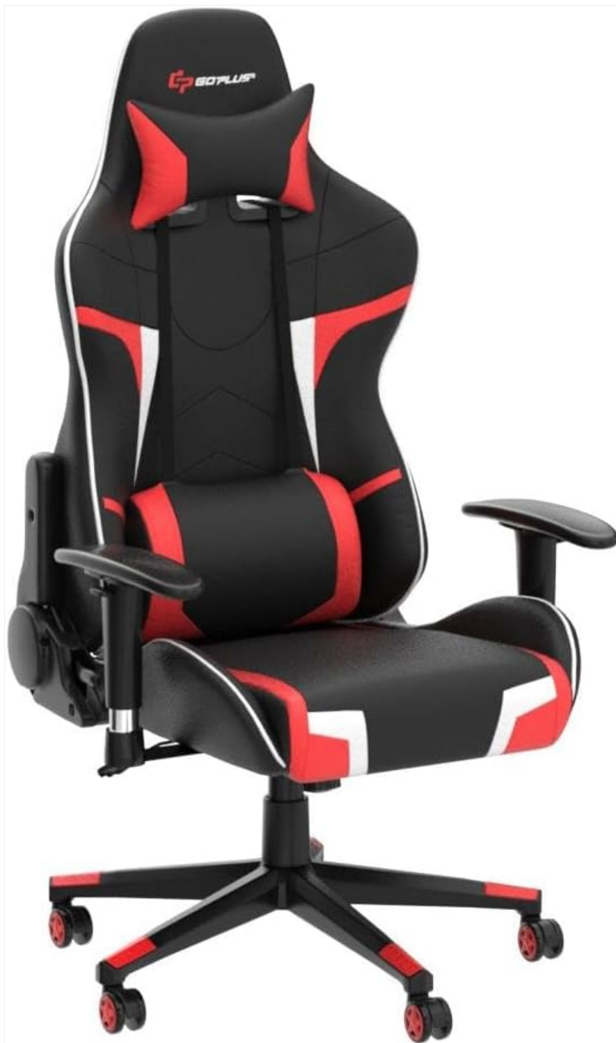
Figure 3: Lumbar Massage Cushion with USB Power Bank Pocket