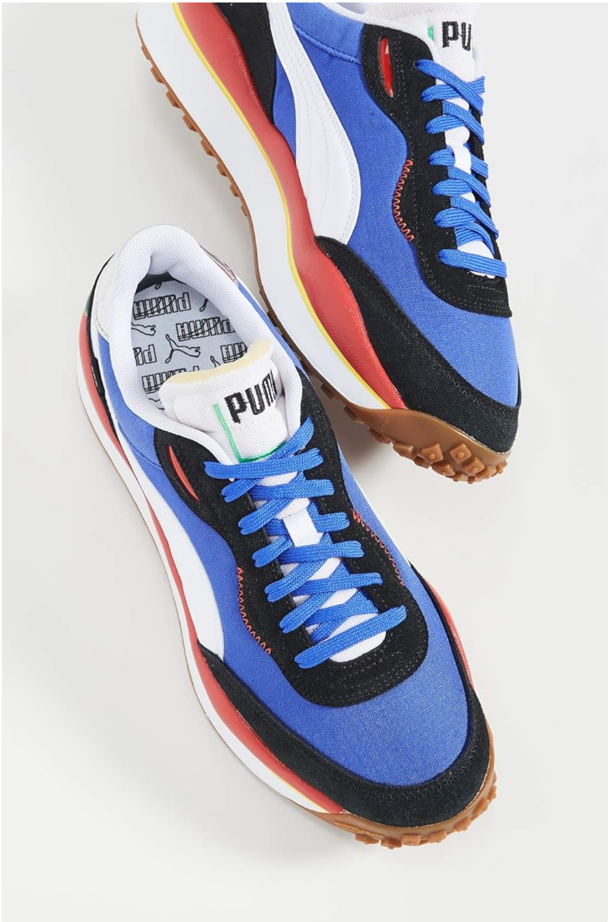
Figure 2.1: Top-down view of the sneakers, illustrating the lacing system and overall aesthetic.