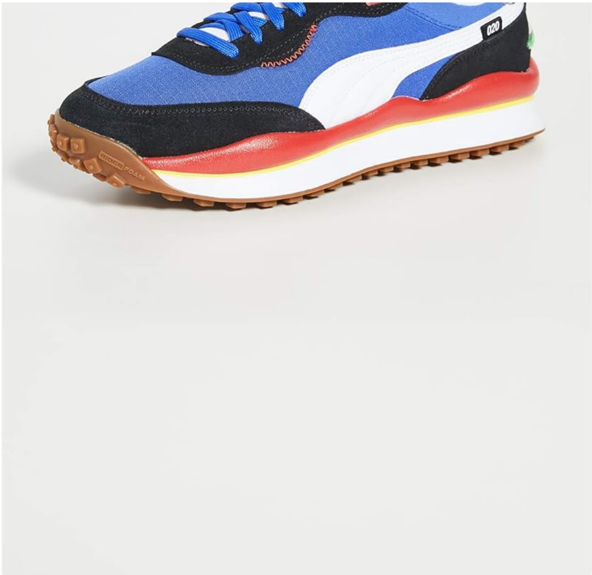
Figure 1.1: Side view of the PUMA Rider 020 Play On sneaker, showcasing its multi-colored design and distinct formstrip.