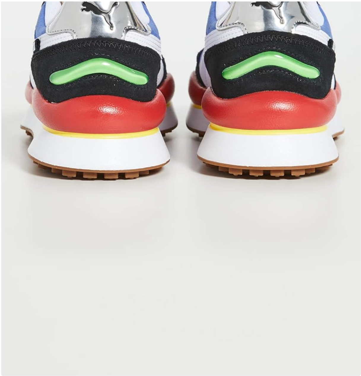
Figure 6.1: Rear view of the sneakers, highlighting the heel counter and sole layering.