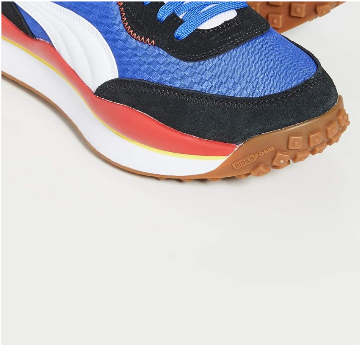
Figure 4.1: Detail of the rubber outsole and ripstop upper, highlighting areas for cleaning.