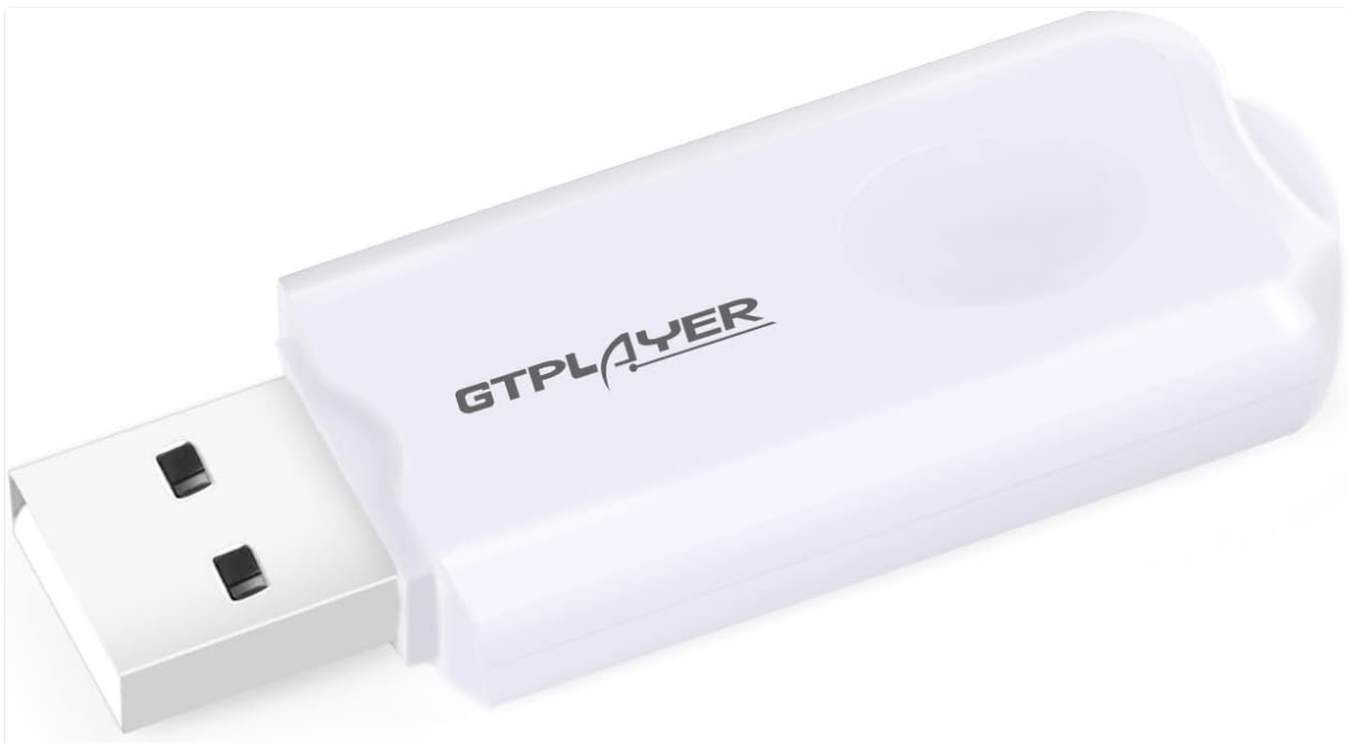
Figure 1: GTPLAYER GT Lynck1 Bluetooth USB 5.0 Wireless Dongle. This image shows the compact, white USB dongle with the GTPLAYER logo.