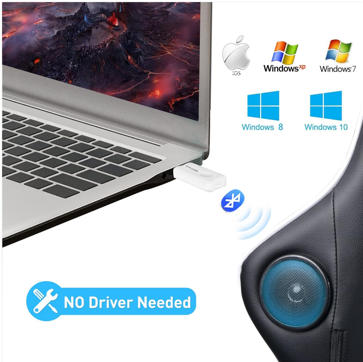
Figure 2: Plug & Play installation. This image illustrates the dongle plugged into a laptop, showing compatibility with various Windows versions and indicating "NO Driver Needed".