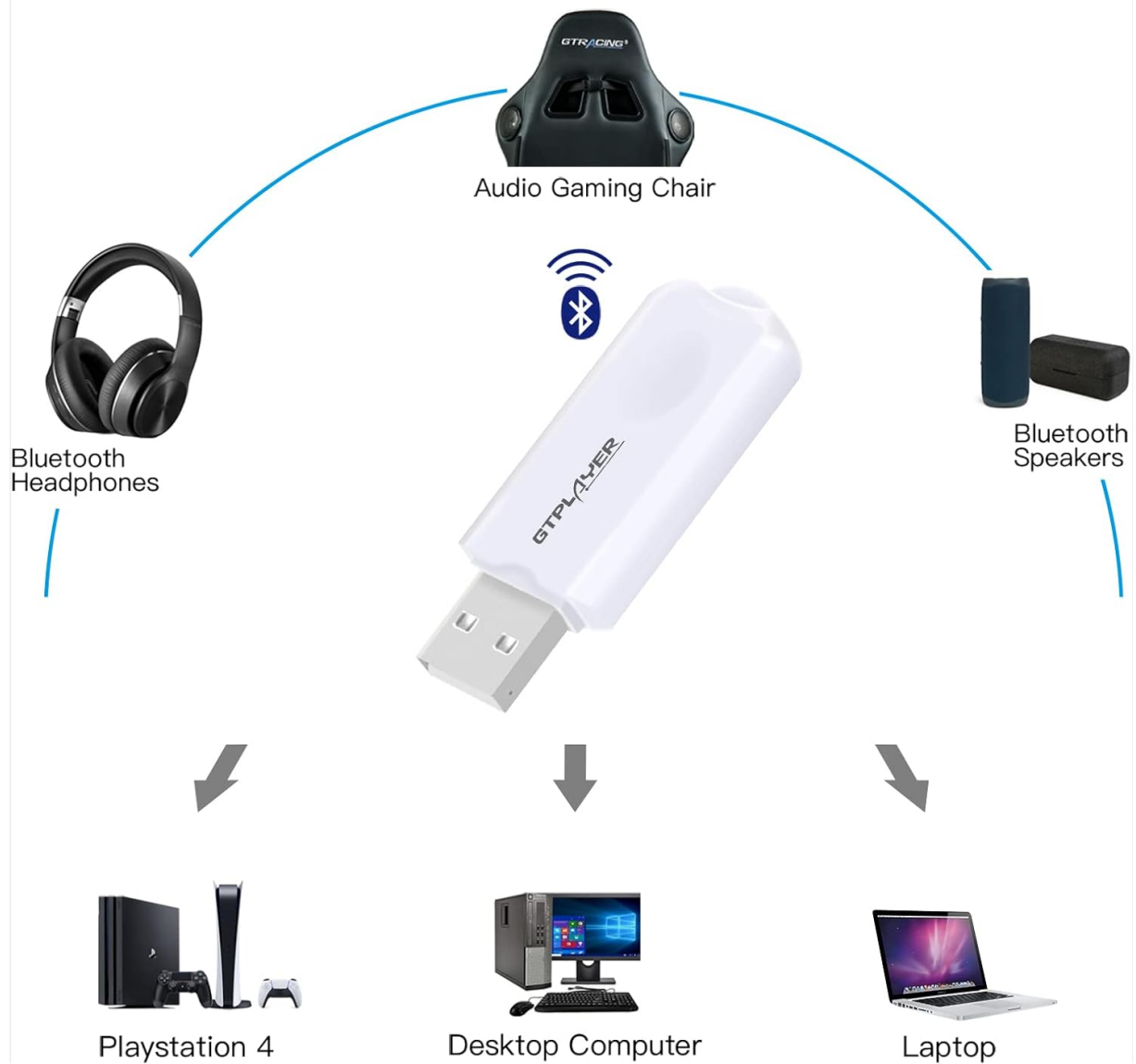
Figure 3: Compatibility with various devices. This image shows the dongle connecting to Bluetooth headphones, Bluetooth speakers, an audio gaming chair, PlayStation 4, desktop computers, and laptops.

The dongle supports a reliable connection with a range of up to 10 meters (32.8 feet), allowing you to enjoy audio freely and wirelessly.