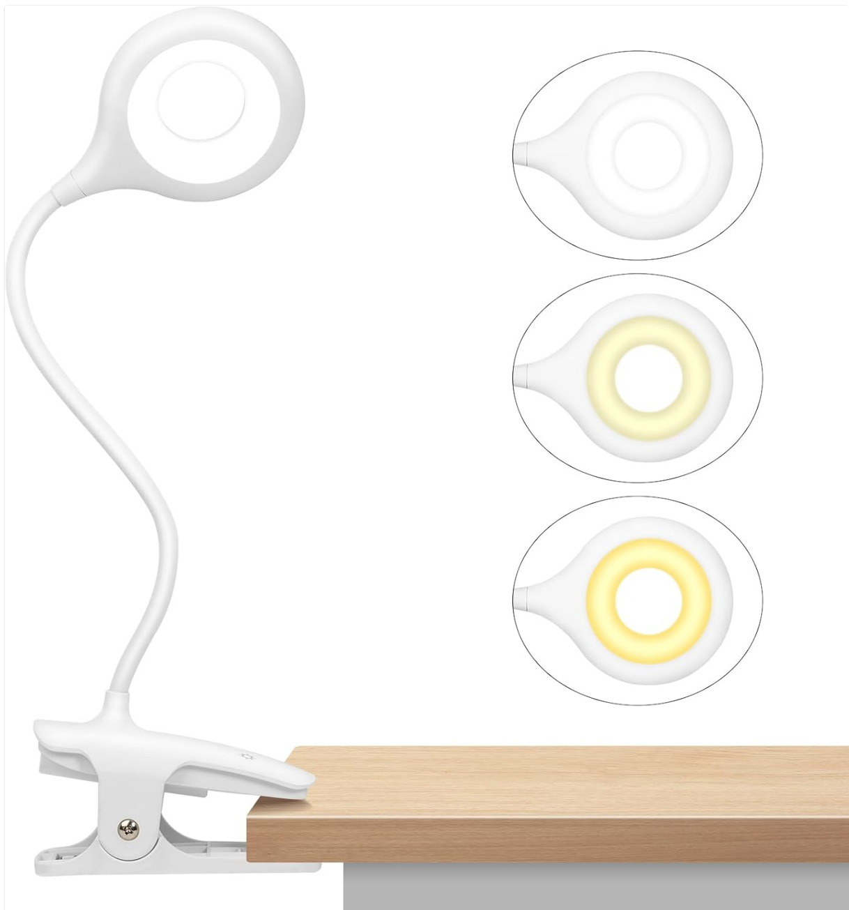
Image: The LACOKI CL-01 reading light showcasing its flexible gooseneck and clip base, demonstrating its adjustable nature.