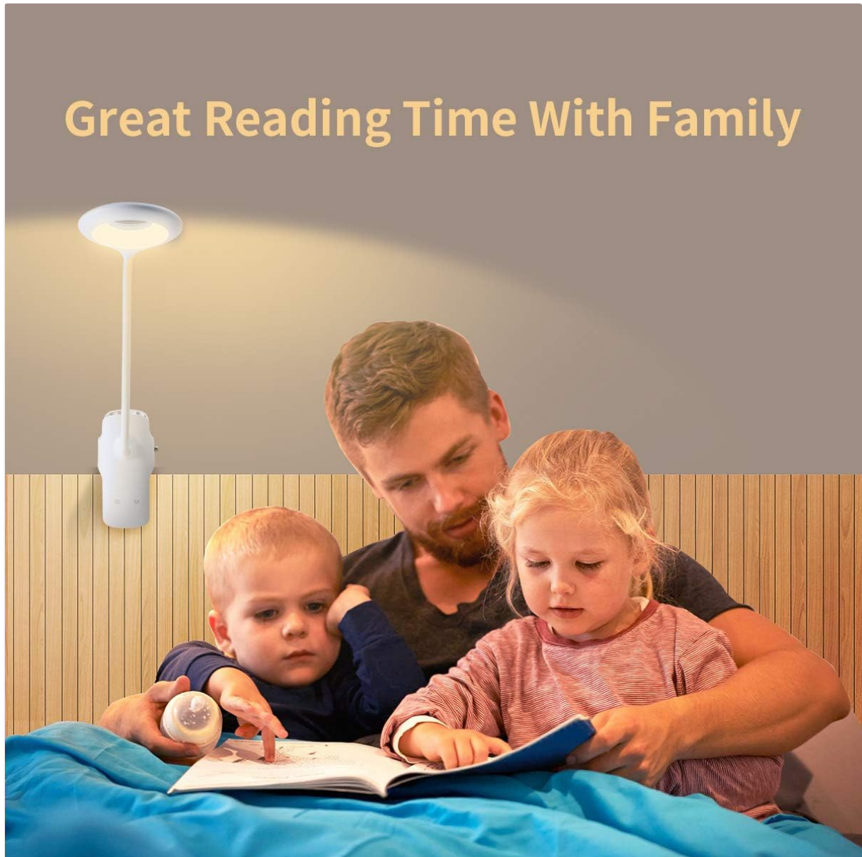
Image: The clip mechanism and flexible neck of the LACOKI CL-01 reading light.

The LACOKI CL-01 features a heavy-duty clip with padded surfaces. To attach, simply press the clip open and secure it onto a stable surface such as a headboard, desk, or shelf. The padding prevents scratches and ensures a firm grip.