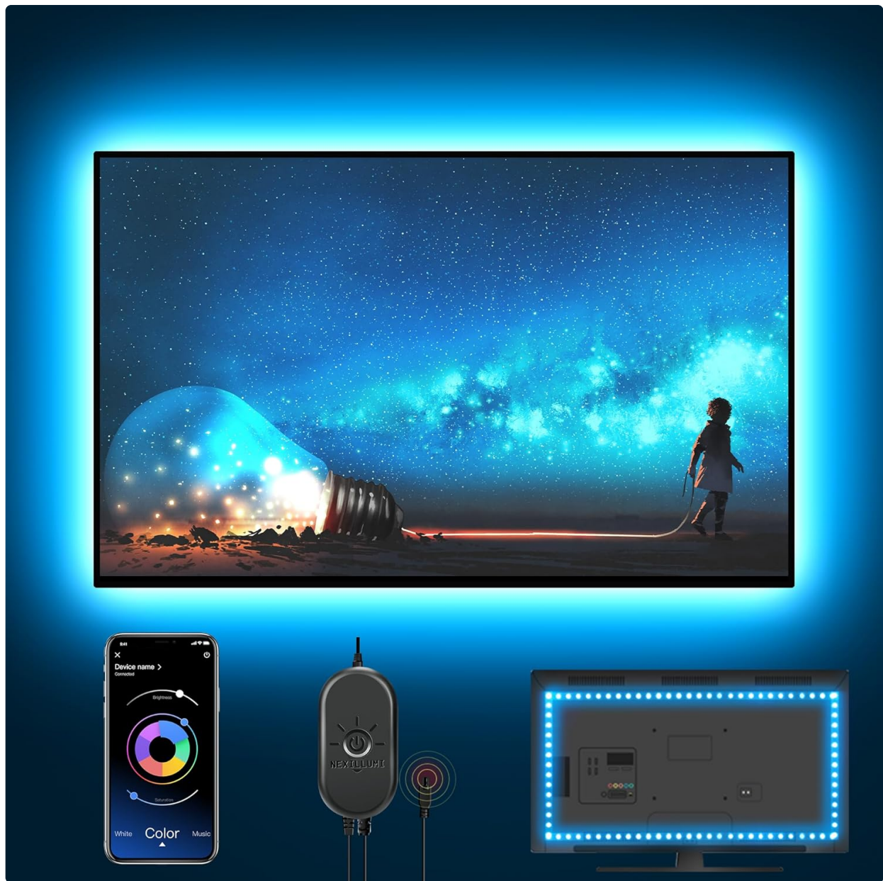
Figure 1: Nexillum LED Lights for TV with app and remote control options.