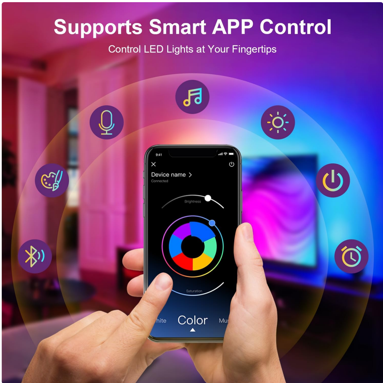
Figure 5: "illumiHome" App interface for advanced control.