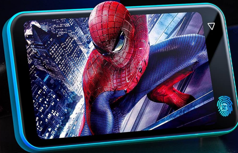
Figure 5.2: The device displaying a high-definition video, showcasing its full touch screen and 1080P video support.

Play high-definition video smoothly, Easy-to-operate interface