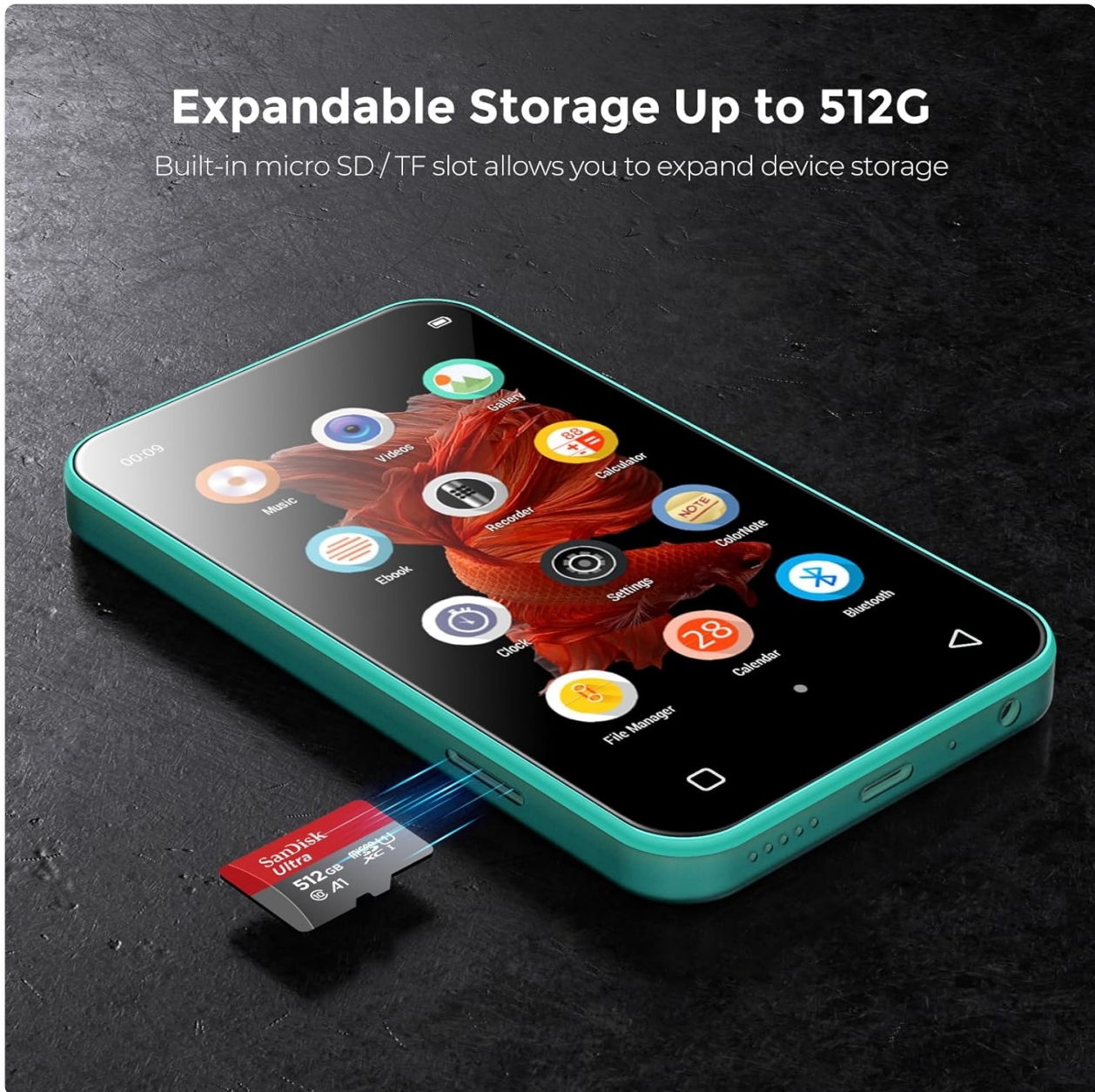
Figure 5.3: Illustration of the expandable storage feature, showing a Micro SD card being inserted into the device.