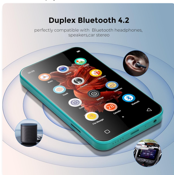
Figure 3.2: Front view of the device displaying the main interface with various application icons, illustrating its Bluetooth compatibility with headphones, speakers, and car stereos.