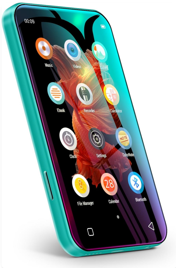
Figure 3.1: Angled view of the TIMMKOO Q3E MP3 Player, highlighting its 4.0-inch full touchscreen and physical buttons on the side.