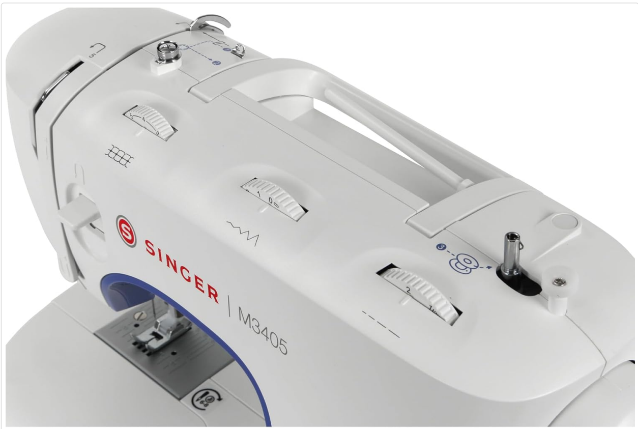
Figure 3.2: Top view of the machine, illustrating the upper thread path, tension dial, and bobbin winder.