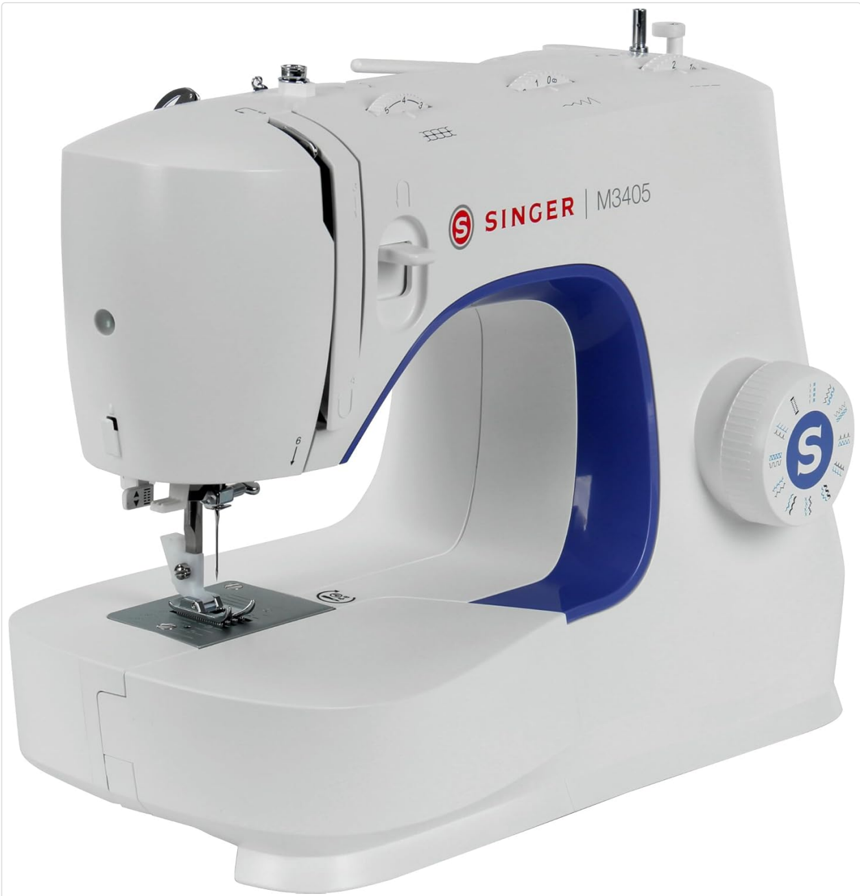
Figure 3.1: Front view of the SINGER SGM-M3405 sewing machine, highlighting the main body, needle area, and stitch selection dial.