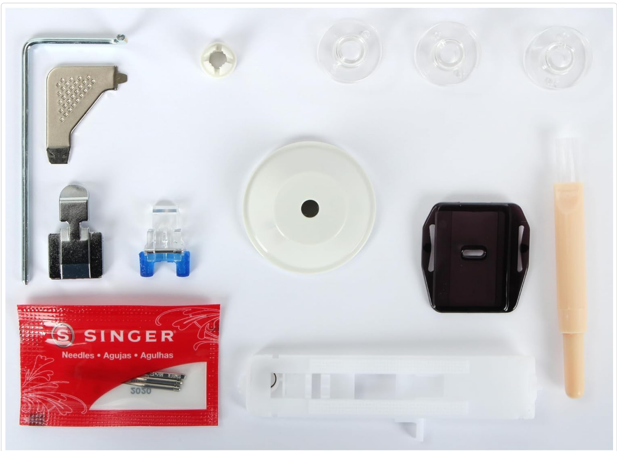
Figure 3.7: A selection of standard accessories included with the machine, such as various presser feet, needles, and bobbins.