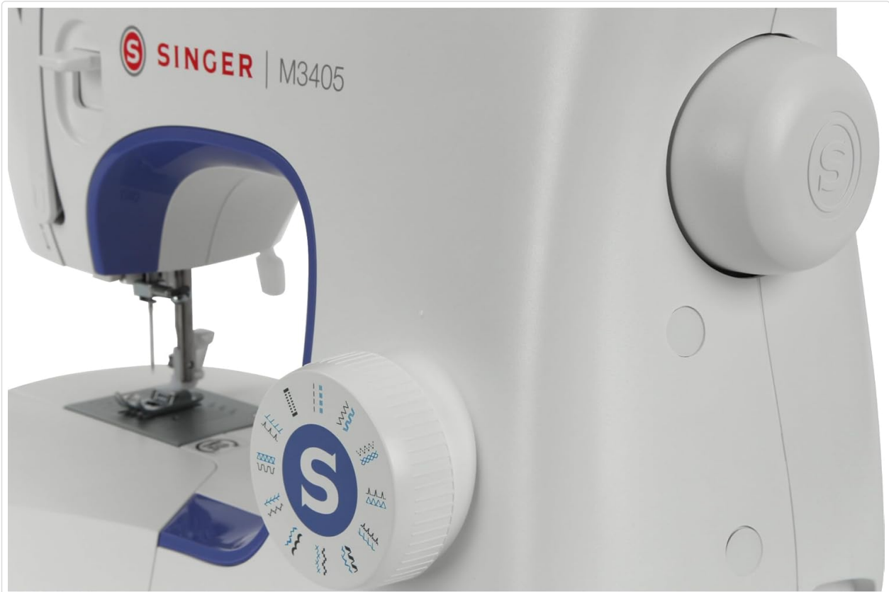
Figure 3.3: Detailed view of the stitch selection dial, clearly showing the various stitch patterns available.