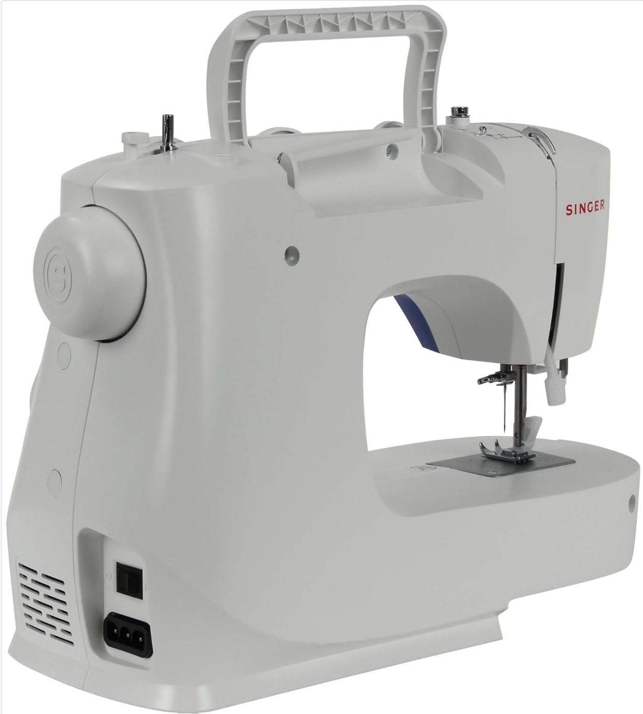
Figure 3.8: Rear view of the machine, showing the power input and main power switch.