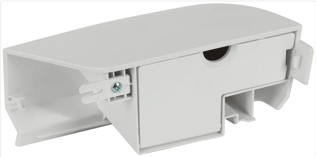
Figure 3.6: The removable accessory storage box, which also serves as an extension table for flat sewing.