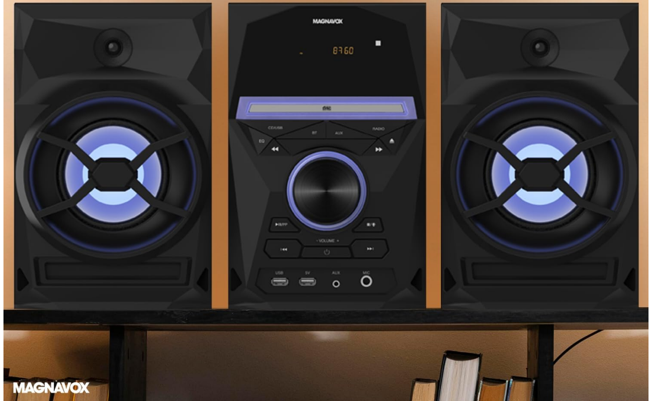
Image 2.2: Visual representation of the system's core features, including CD-R/CD-RW compatibility, USB ports, Bluetooth, FM Radio, and a built-in equalizer.