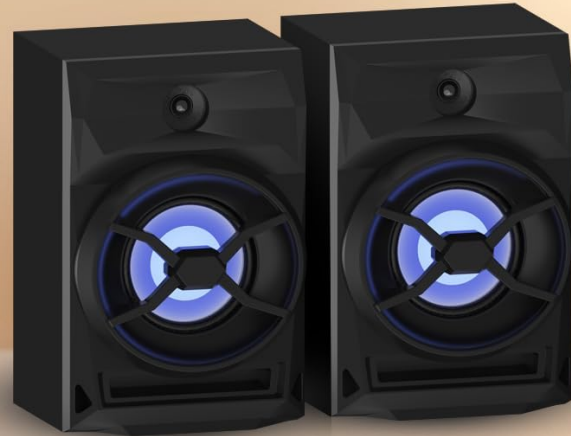
2 movable speakers