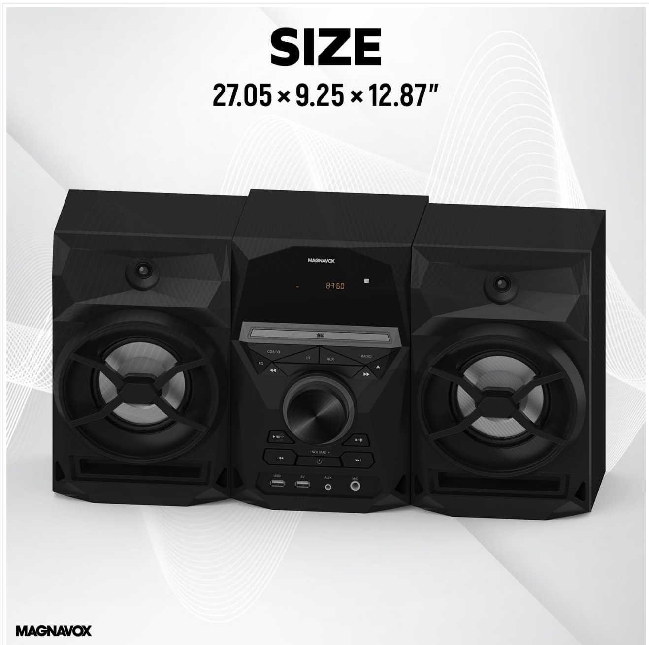
Image 7.1: The overall dimensions of the Magnavox 3-Piece CD Shelf System.