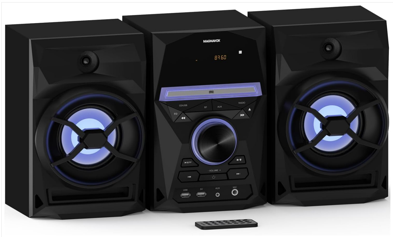
Image 2.1: The Magnavox 3-Piece CD Shelf System, featuring the central unit and two detachable speakers.