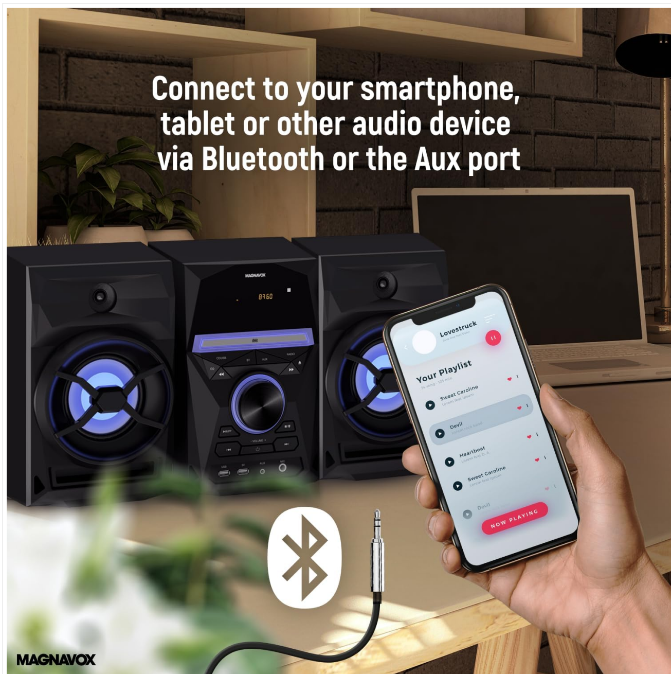
Image 4.1: Illustrates connecting a smartphone to the system via Bluetooth or the AUX port for audio playback.