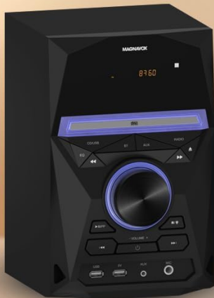
CD player/ Radio