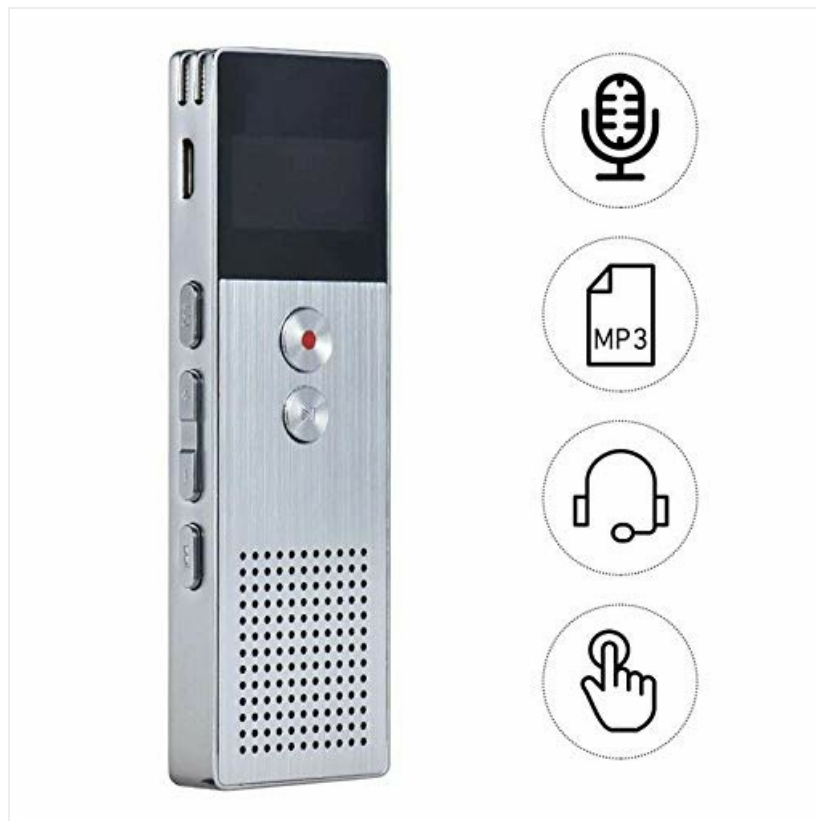
Image 4.2: This image illustrates the multi-functional capabilities of the device, including its use as a voice recorder (microphone icon), an MP3 player (MP3 icon), and its compatibility with headphones (headphone icon). The touch icon suggests ease of interaction.