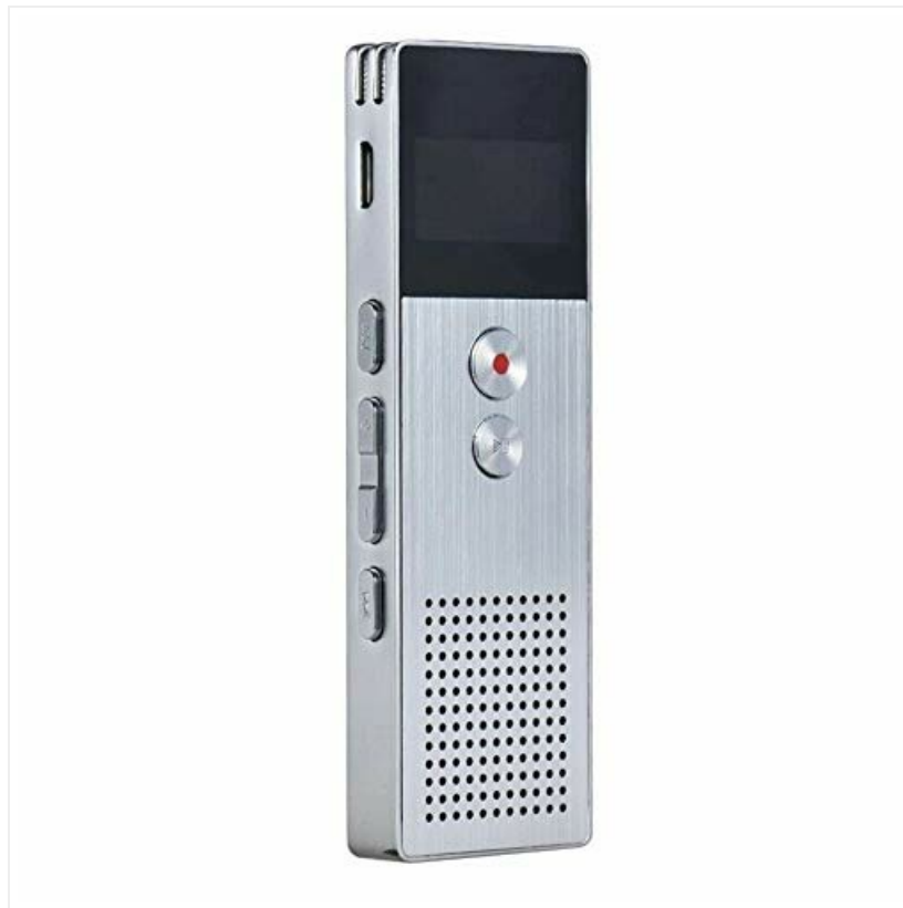
Image 2.1: Front view of the ELECTROPRIME Digital Voice Recorder. This image displays the device's screen, the prominent red record button, and other control buttons on the front panel, along with the speaker grille at the bottom.