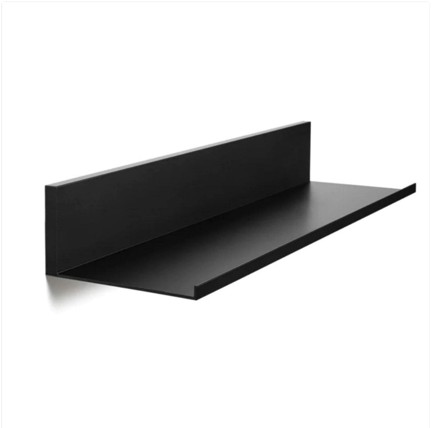
Image: The Hangman L18B 18-inch No-Stud Floating Shelf in black powder coat finish.