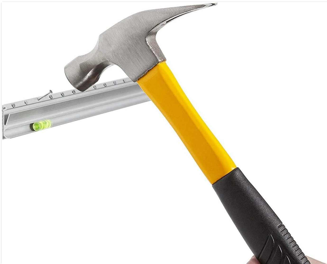
Image: A hammer next to the wall bracket, showing the built-in bubble level and nails for installation.