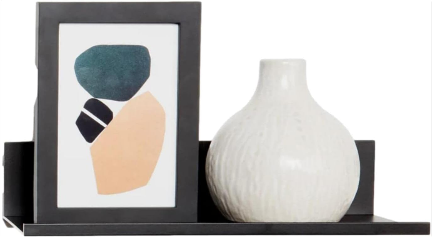
Image: The black floating shelf holding a framed picture and a white decorative vase, demonstrating its use.